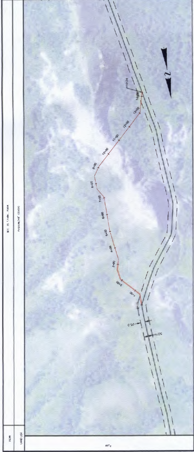
PROPOSED PIPELINE ROUTE (METER STATIONING)

PROJECT NUMBER: D-87-592-10500-01-B-15 SHEET NUMBER: 1 of 1