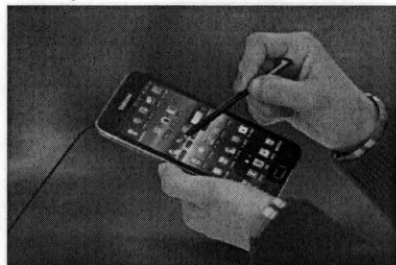
Hot gadgets for spring 2012: Here are some of the top consumer gadgets that have been creating a lot of buzz this season.