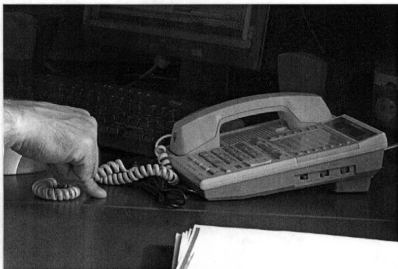
Telecom companies are pressing to be freed from the obligation of providing low-cost fixed-line telephone service to homes, a move critics say will leave Americans with less reliable or more expensive options.