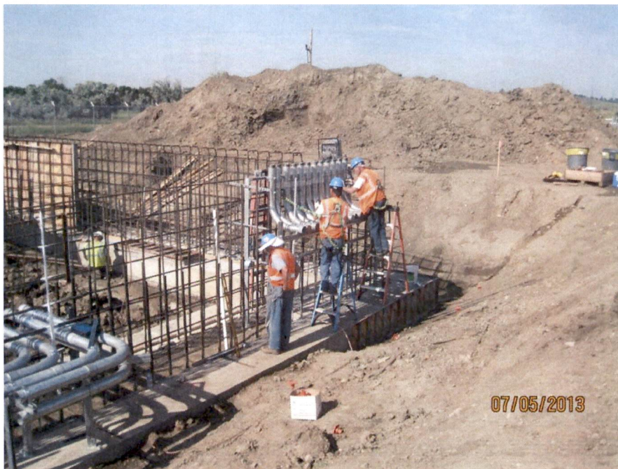
Electrical conduit embedments at Service Building (looking SW)