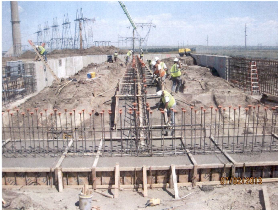
Service Building grade beam (looking E)