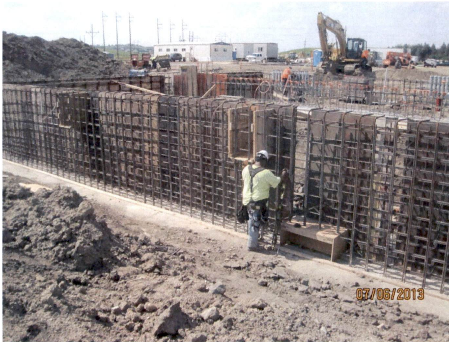
Service Building wall (looking NW)