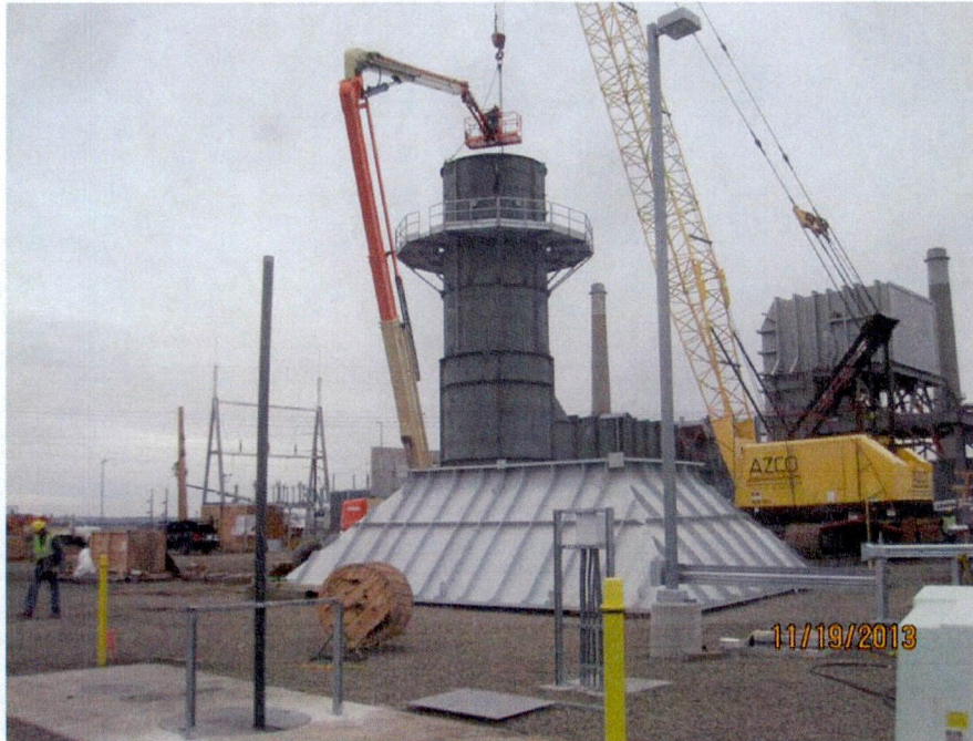
Top half of exhaust stack installation (looking NE)