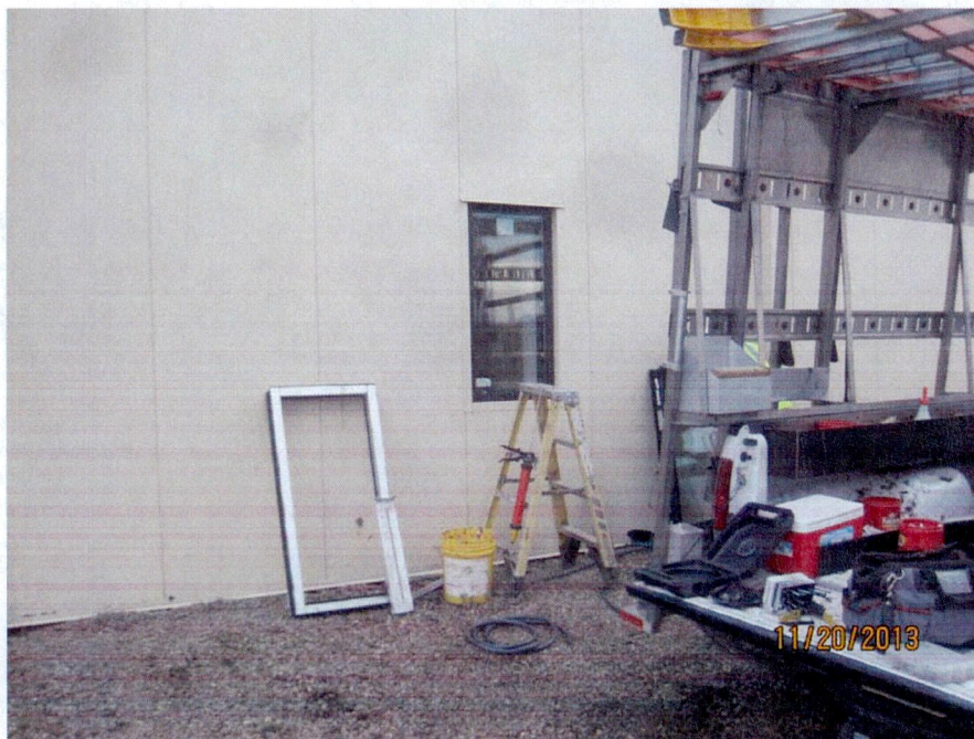
Service Building window installation (looking SW)