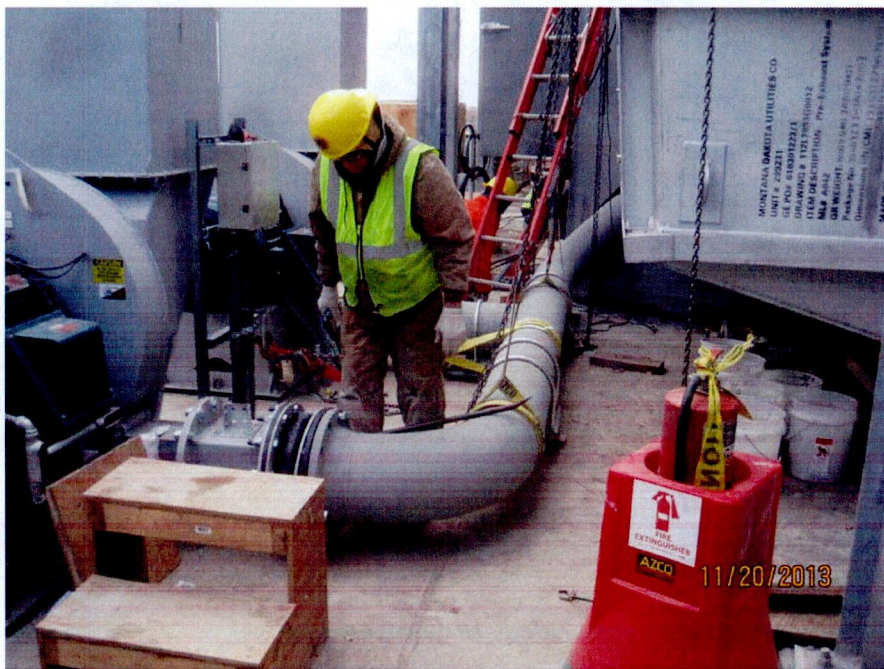
Exhaust blower piping installation (looking S)