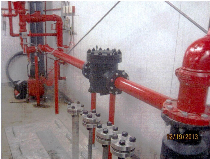
Fire protection strainer installation (looking NW)