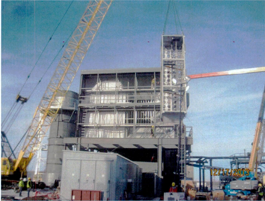
Inlet air filter section installation (looking N)