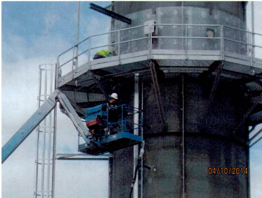
CEMS umbilical cord installation (looking N)