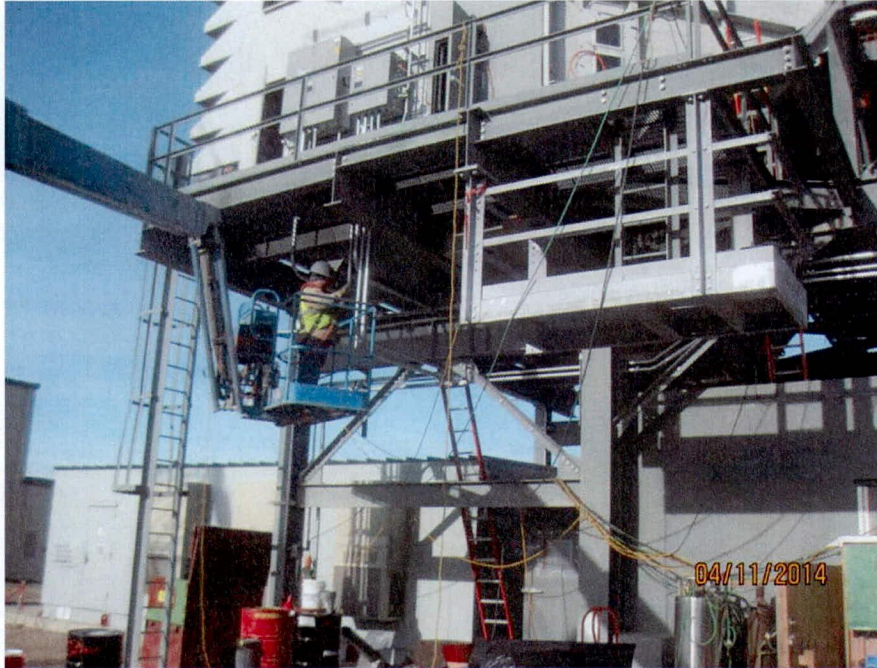
Air inlet filter conduit installation (looking SW)