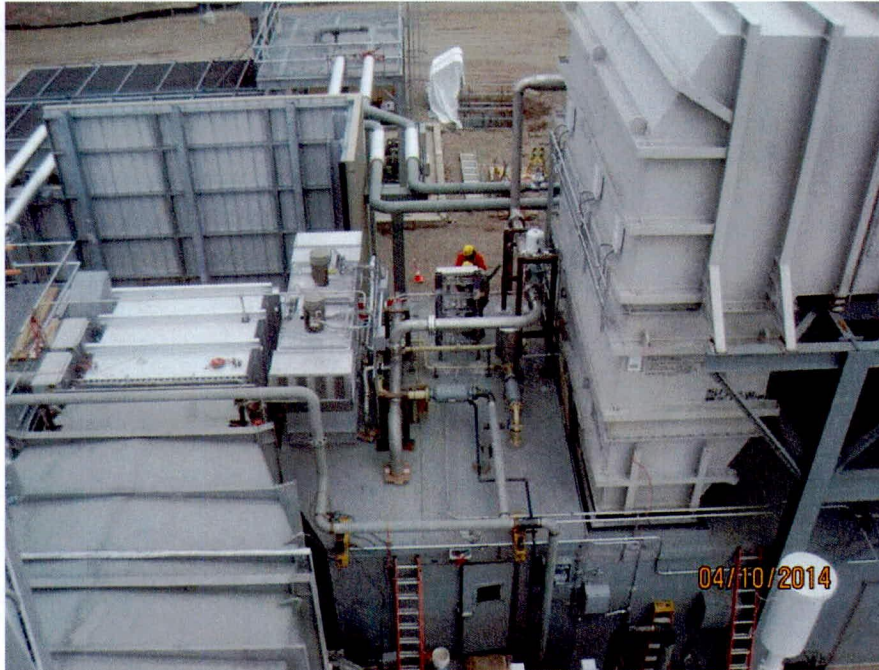
Bleed heat piping installation (looking E)