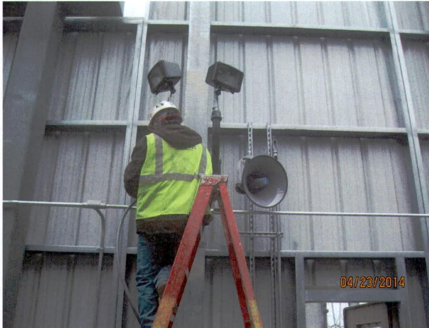
Lighting and Gai-tronics installation (looking E)