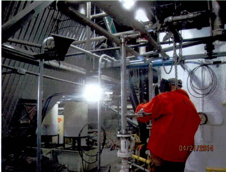
Service water piping installation (looking NE)