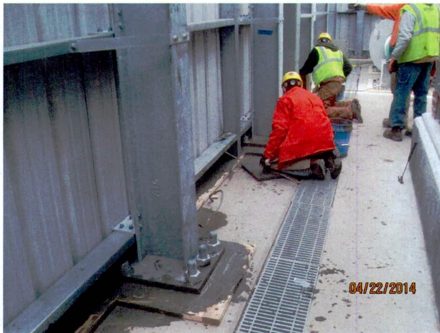
Acoustic barrier grout installation (looking S)