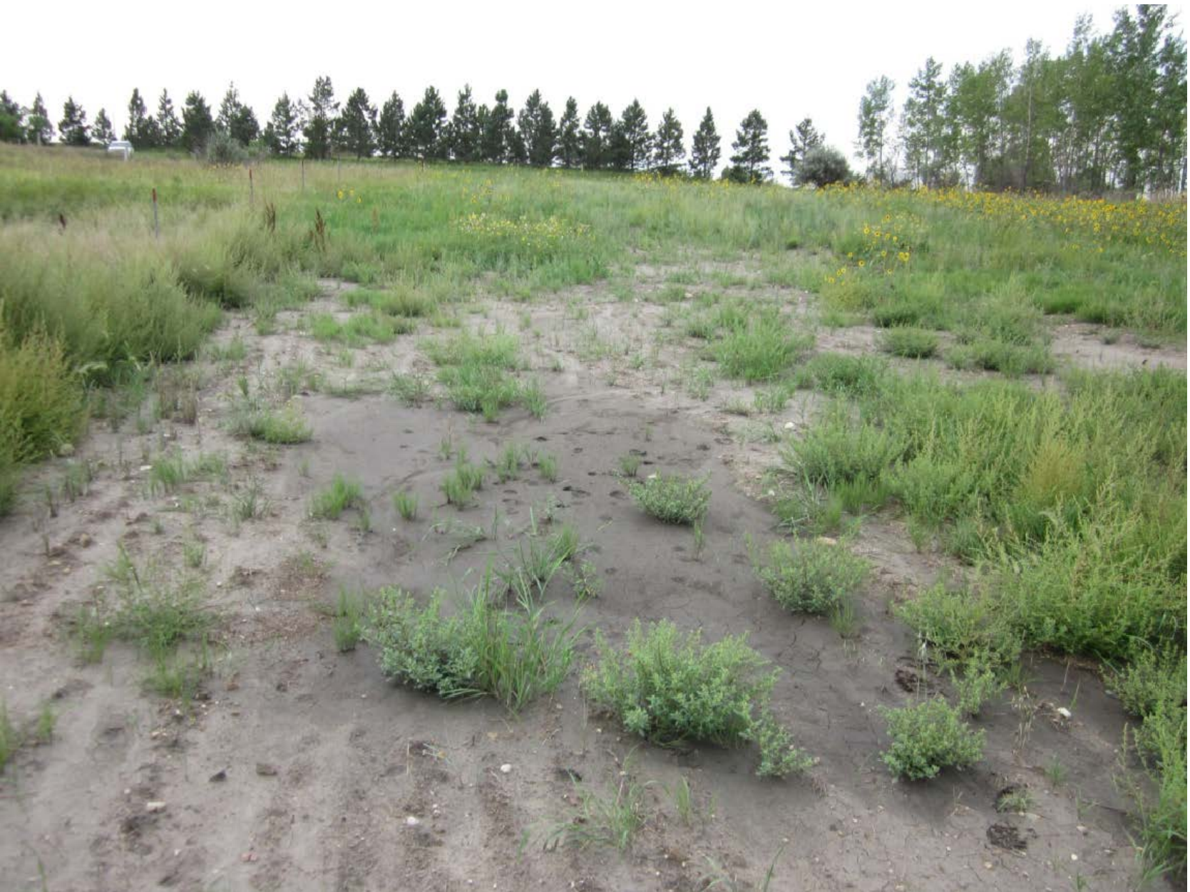
Attachment D PHOTO 19 - AREA OF CONCERN Page 2 of 4