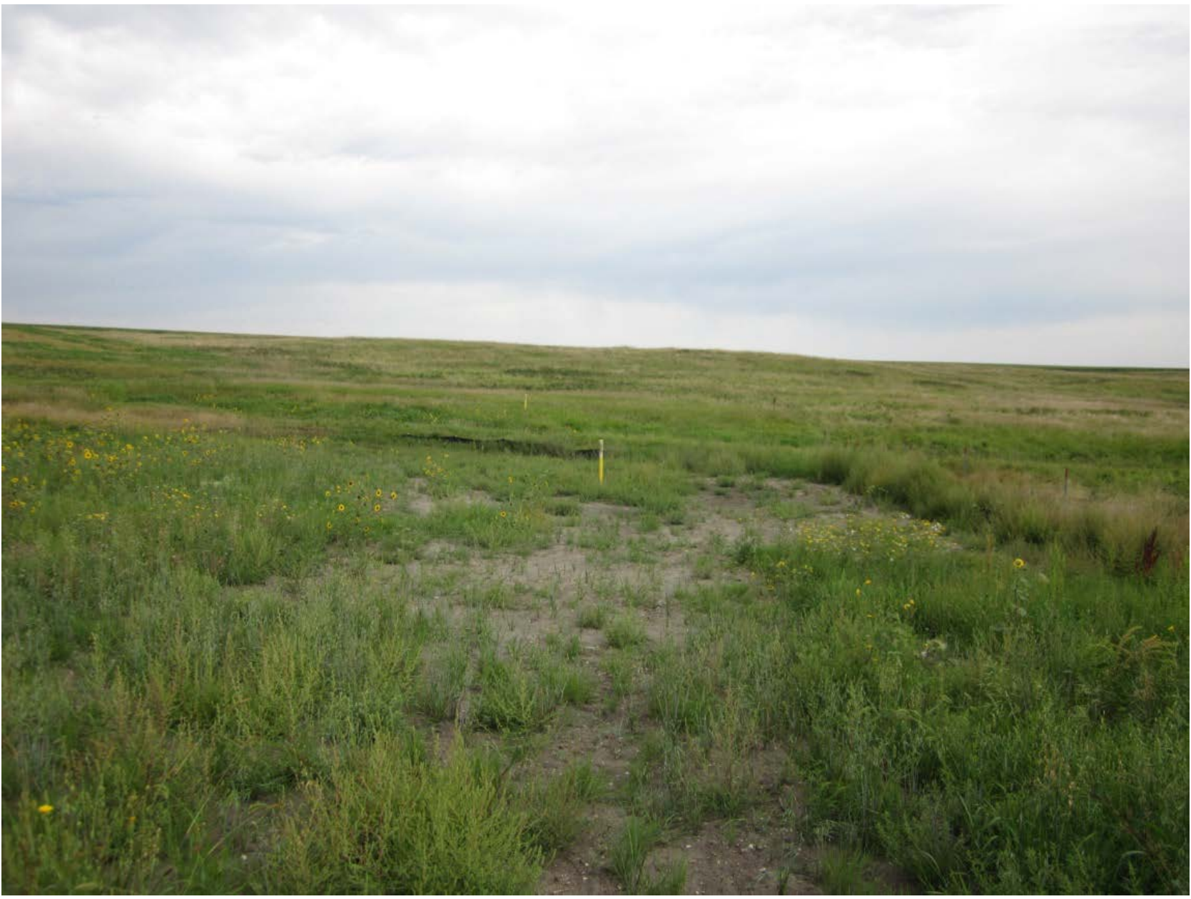
Attachment D PHOTO 8 - AREA OF CONCERN Page 1 of 4