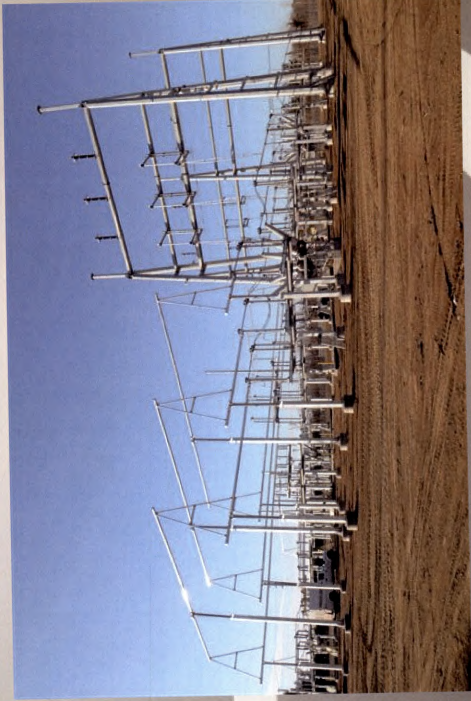
Cass Lake Sub