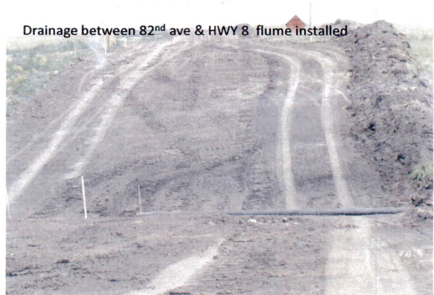
Drainage between 82 nd ave & HWY 8 flume installed