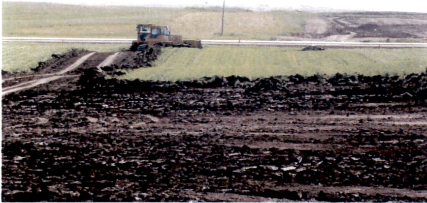
Stripping topsoil west side of HWY 8