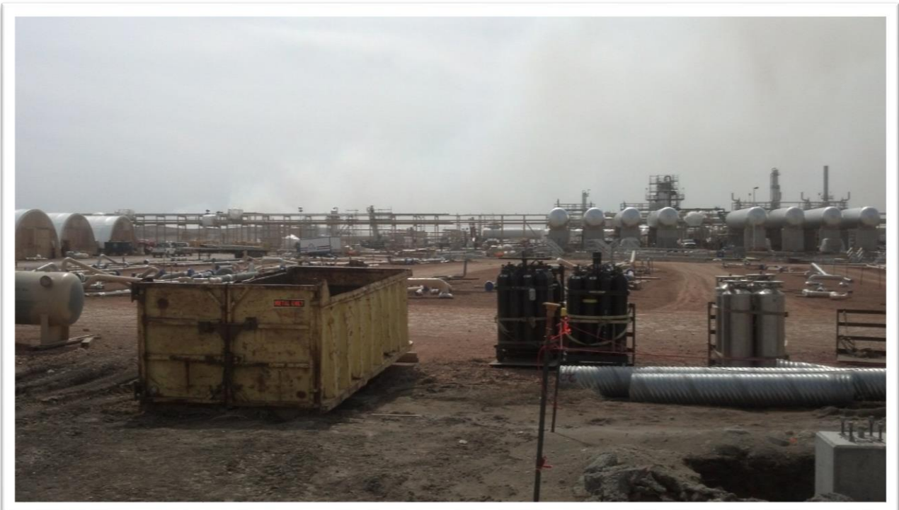
Figure 6. View looking south at the dividing point between Garden Creek II and III. The center of the 8 elevated tanks seen above is the dividing point, with Garden Creek II being the east (left) side and Garden Creek III being the west (right) side