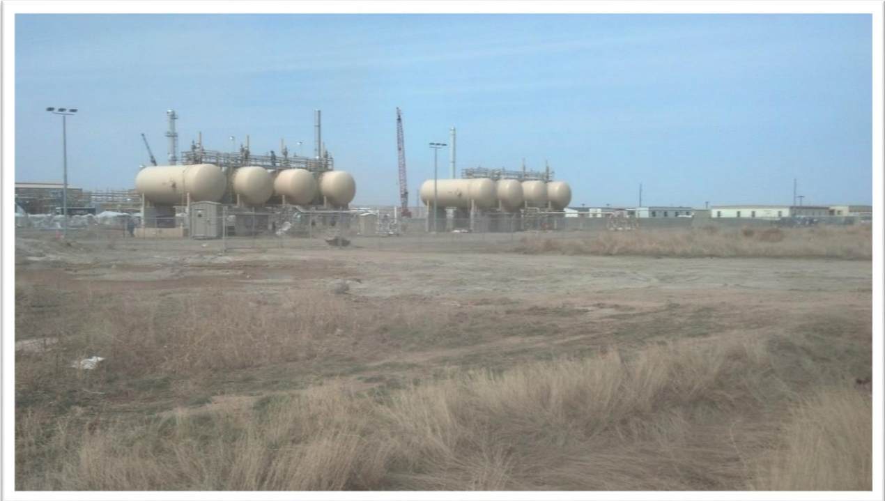
Figure 5. View from the southeast corner of Garden Creek II looking northwest