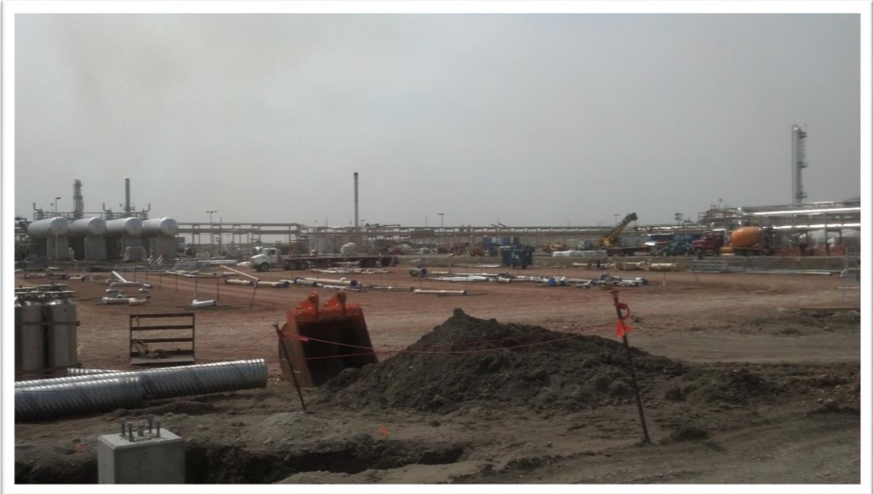
Figure 7. View of Garden Creek III from the dividing line looking southwest