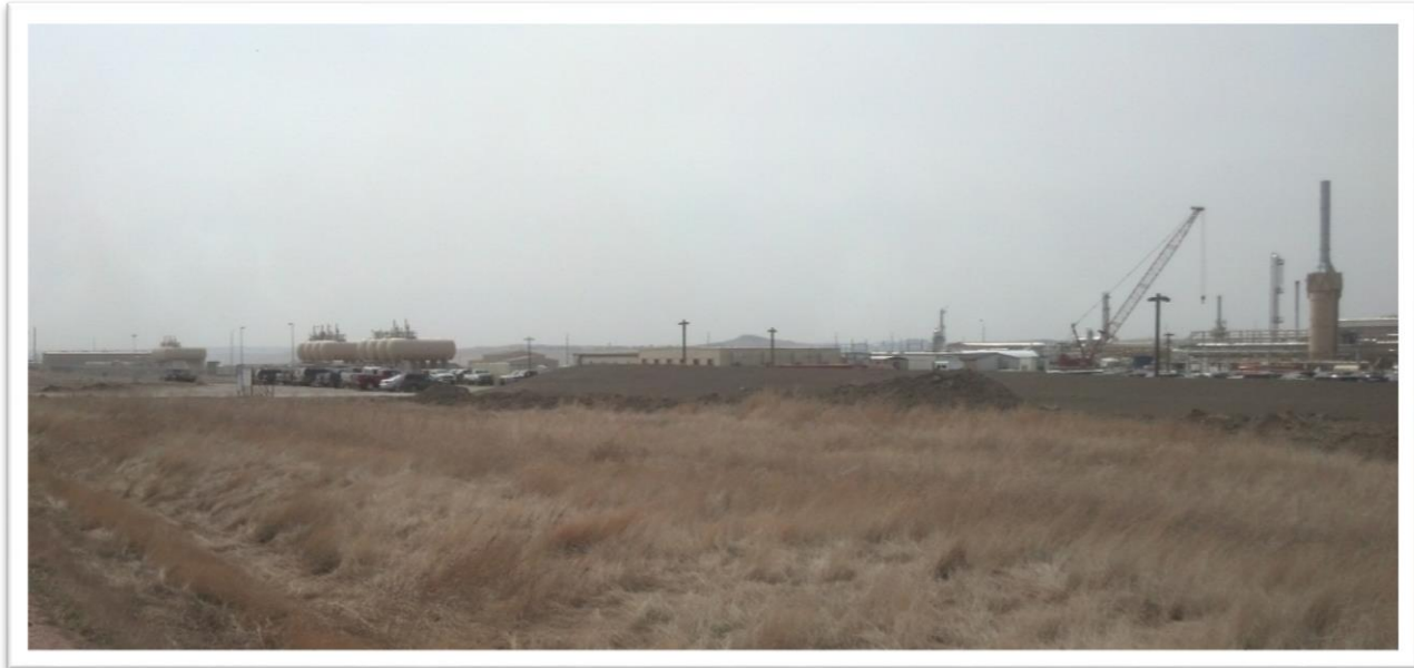
Figure 2. View from the northeast corner of Garden Creek II looking southeast