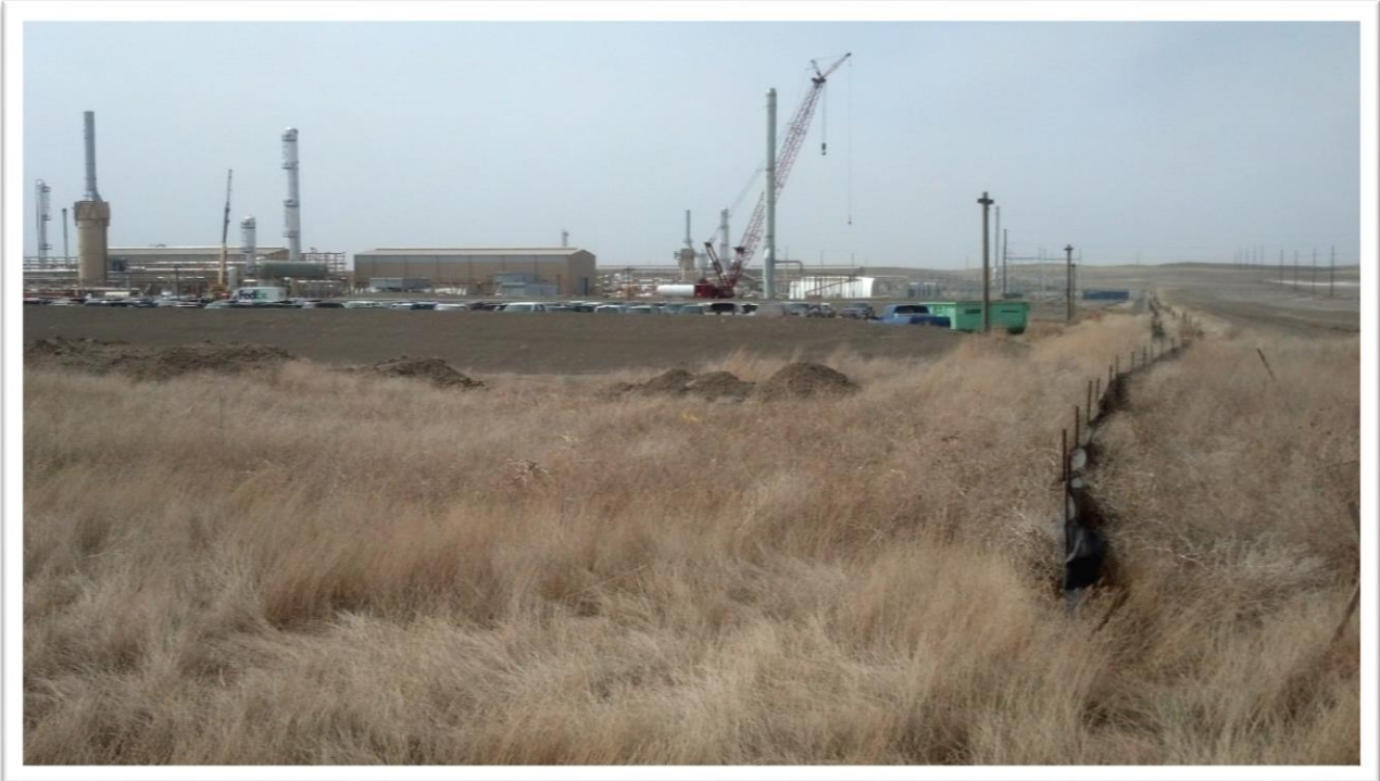
Figure 1. View from the northeast corner of Garden Creek II looking west