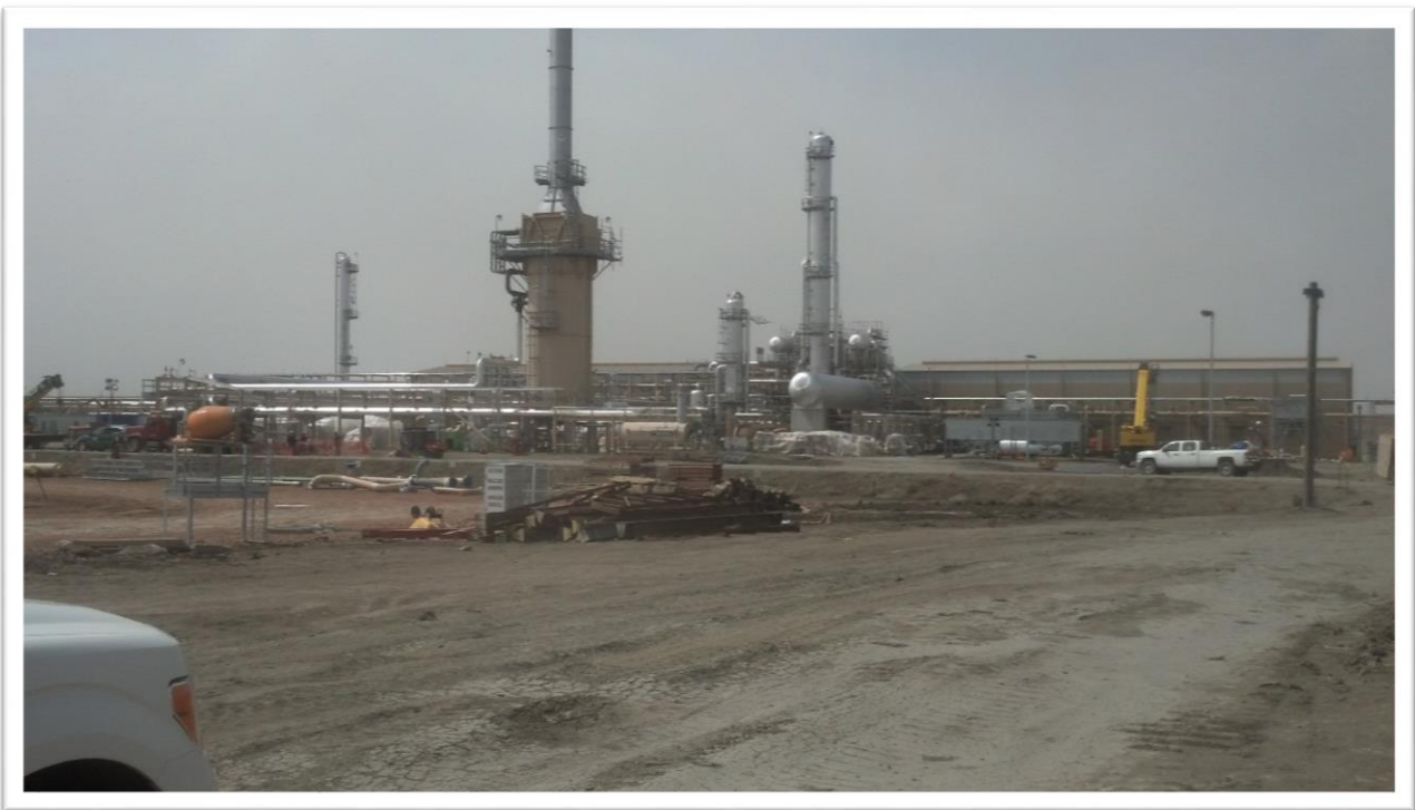
Figure 8. View of Garden Creek III from the dividing line looking west