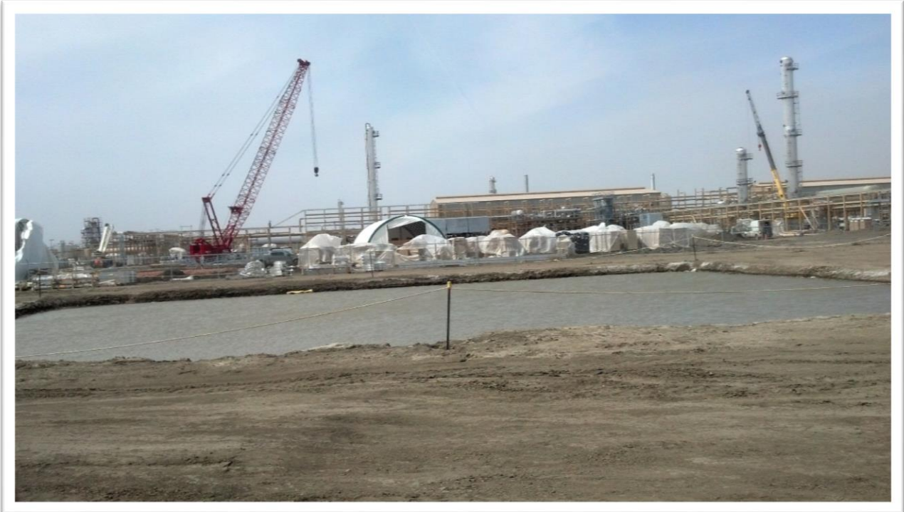
Figure 3. View of a retention pond along the eastern edge of Garden Creek II looking west