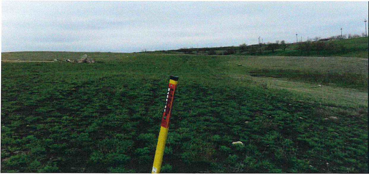
View taken from approximately 185+00 Sec 19, T145N R88W looking to the south.