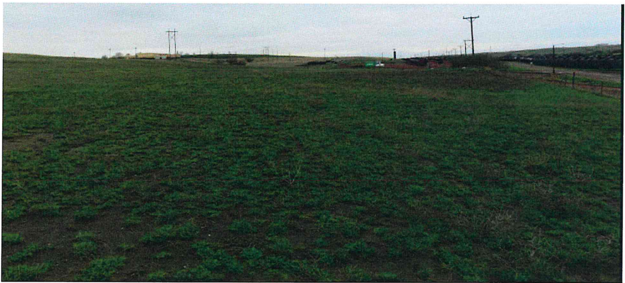
View taken from approximately 202+00, Sec 19, T145N R88W looking to the west.