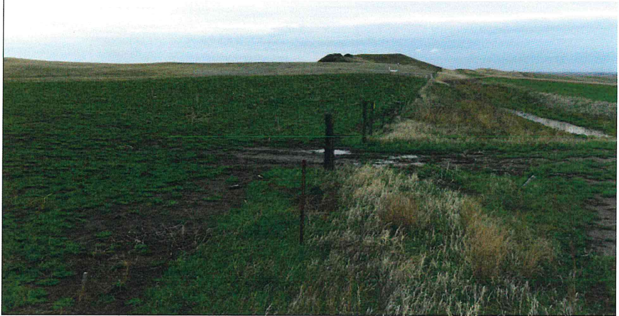
View taken from approximately 5+00 in Sec 1, T144N R89W looking south toward the Knife River valve station.