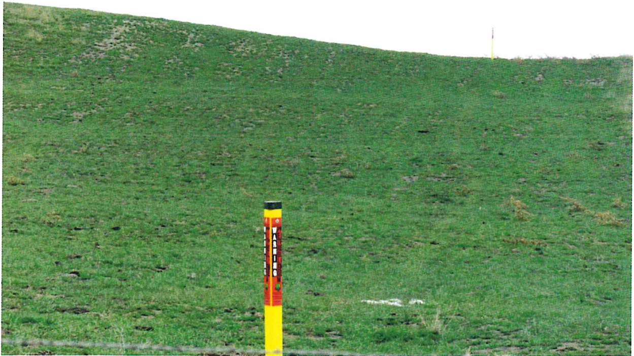
View taken from approximately 86+00 Sec 25, T145N R89W looking to the northeast.