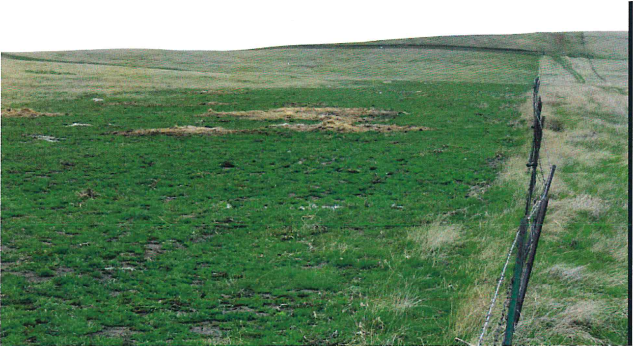
View taken from approximately 76+00 in Sec 25, T145N R93W looking to the east.