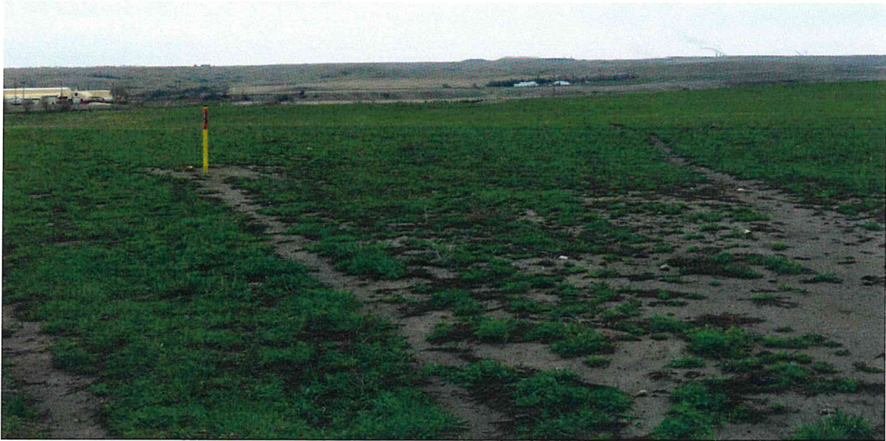
View taken from approximately 165+00 Sec 19, T145N R88W looking to the north.