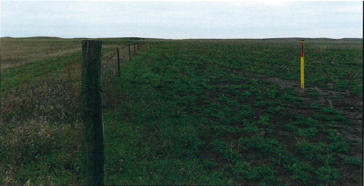
View take from approximately 5+00 in Sec 1, T144N R89W looking north.