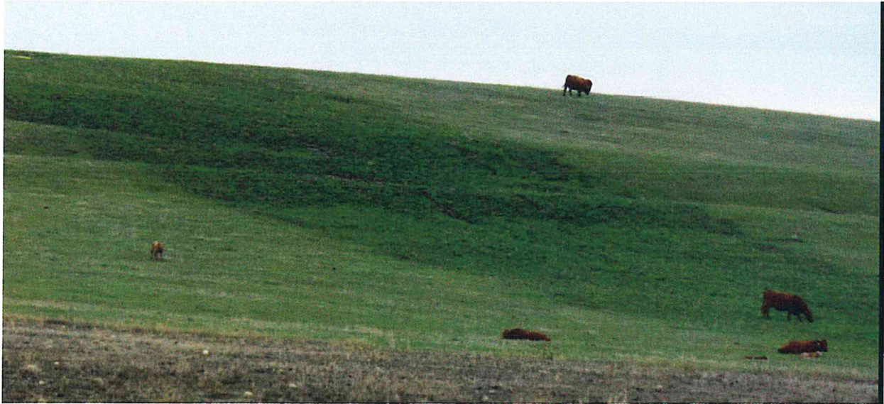
View taken from approximately 150+00 Sec 25, T145N R89W looking to the southwest.