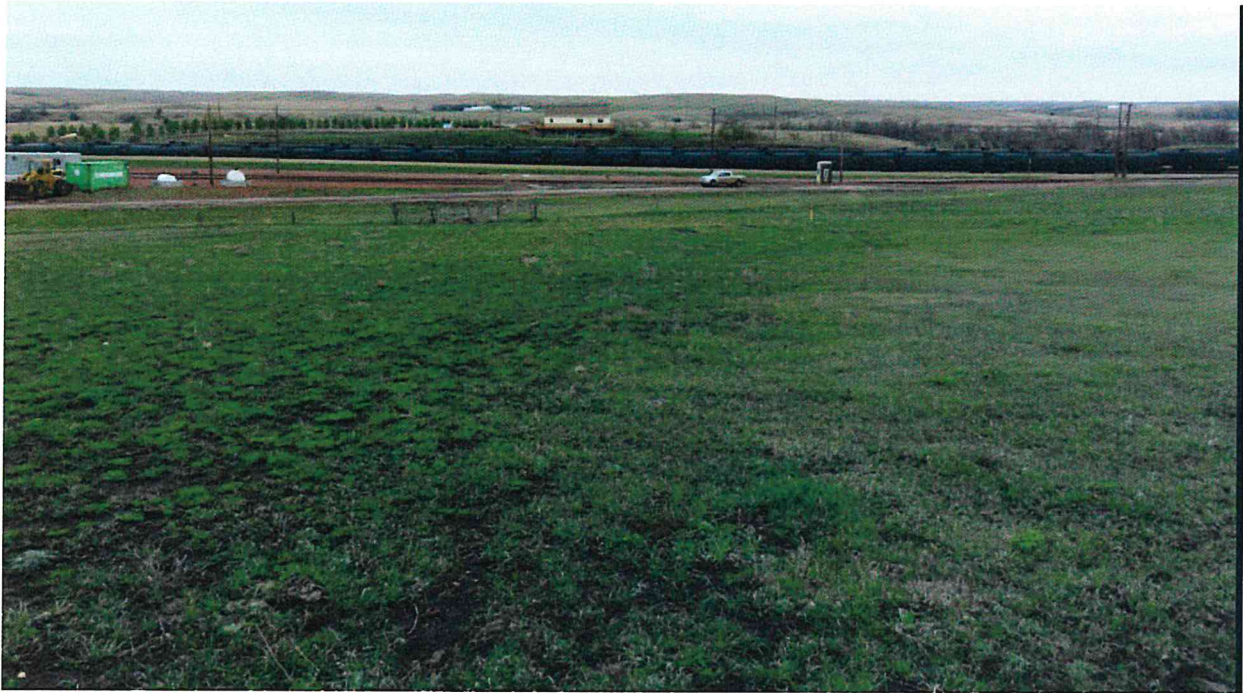
View taken from approximately 185+00, Sec 19, T145N R88W looking to the northeast.