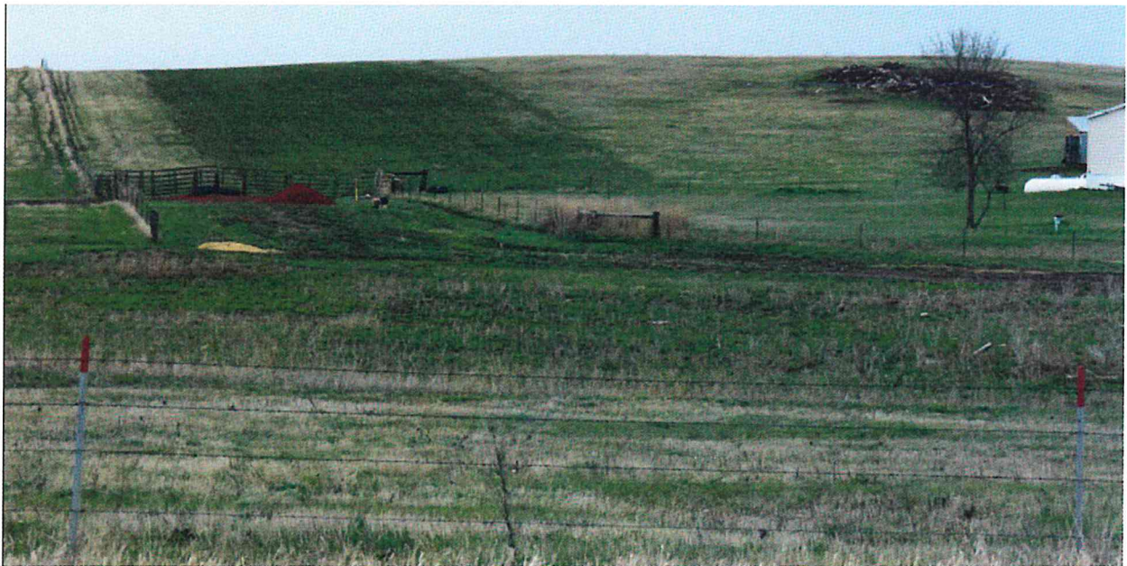
View taken from approximately 68+00 on the northern edge of Sec 35, T145N R89W looking south.