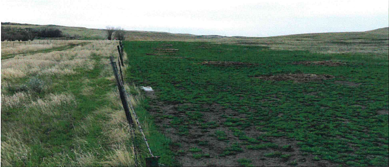
View taken from approximately 76+00 in Sec 25, T145N R89W looking to the west.