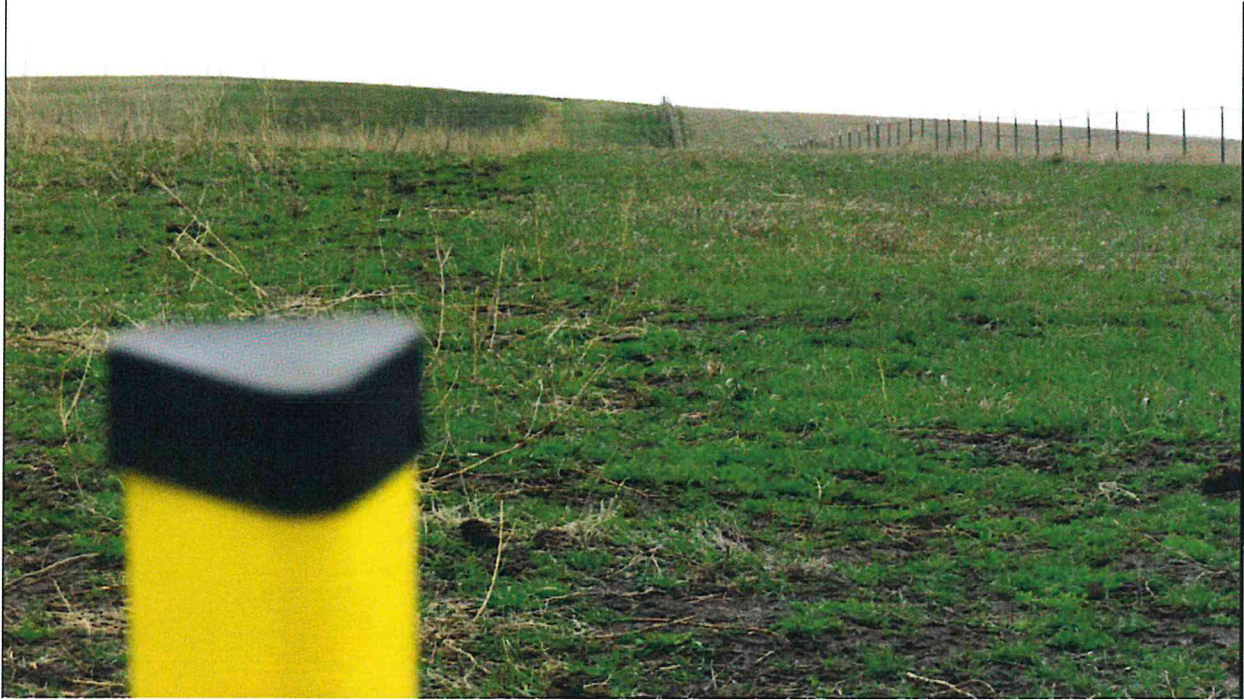
View taken from approximately 15+00 on southern edge of Sec 35, T145N R89W looking north.