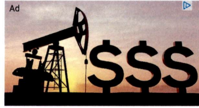
Oil $500 A Barrel?

Wisconsin and Michigan. The new company, known as NSP-Dakota, would be an electric distribution company, and gas operations would continue as they are today.