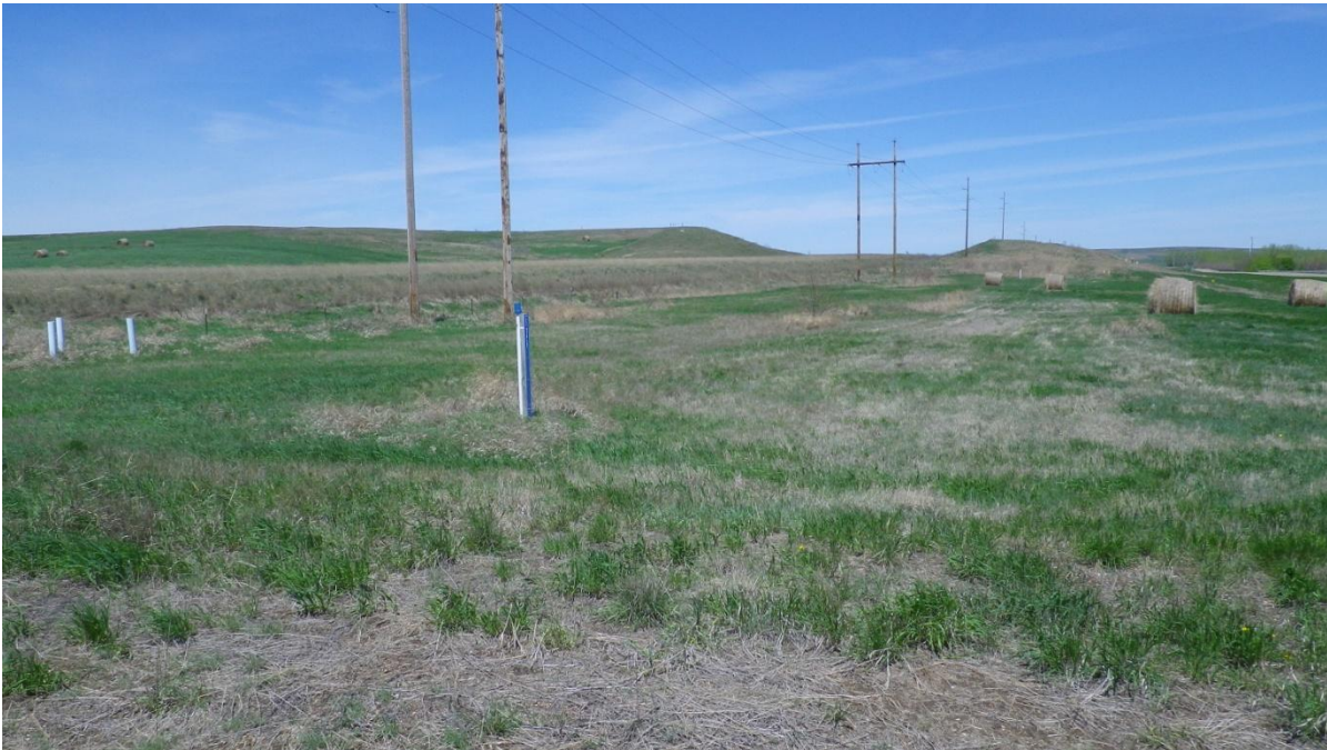
Figure 2: View to the north over central APE, located in the disturbed old road bed (Image 486).