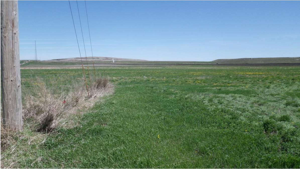
Figure 1: View to the northeast over the southern end of the APE (Image 482).