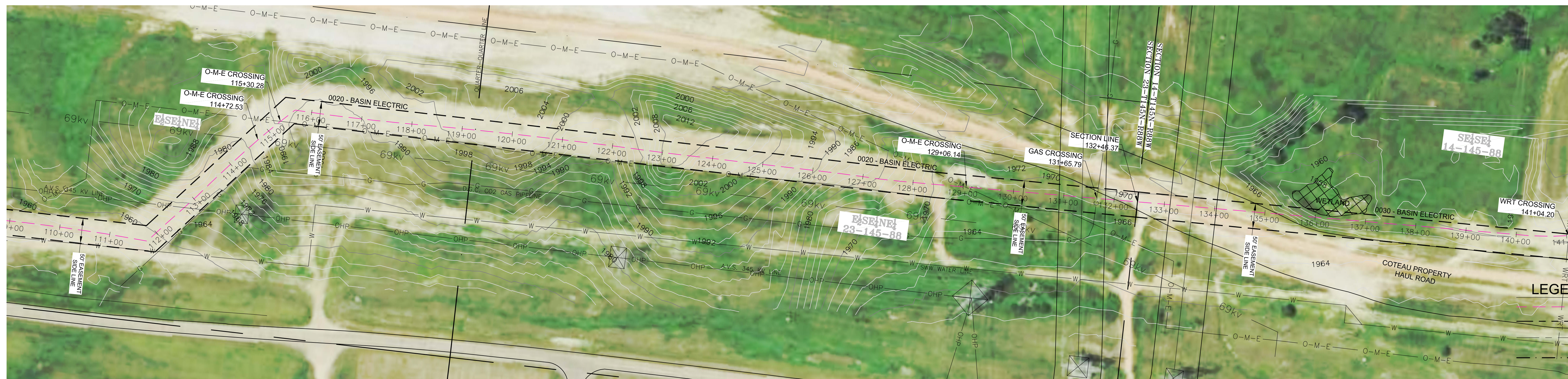
PLAN VIEW SCALE: 1" = 100'