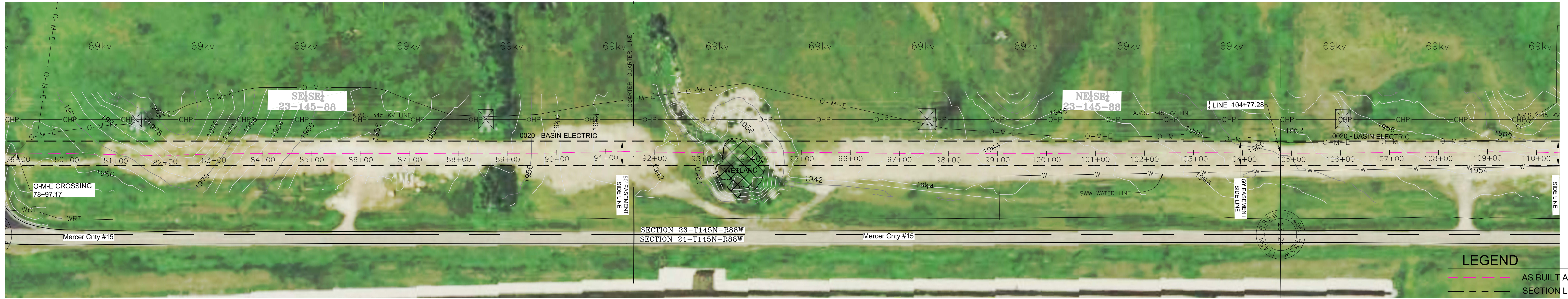
PLAN VIEW SCALE: 1" = 100'