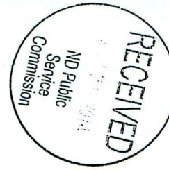
Exhibit A Page 1 of 6