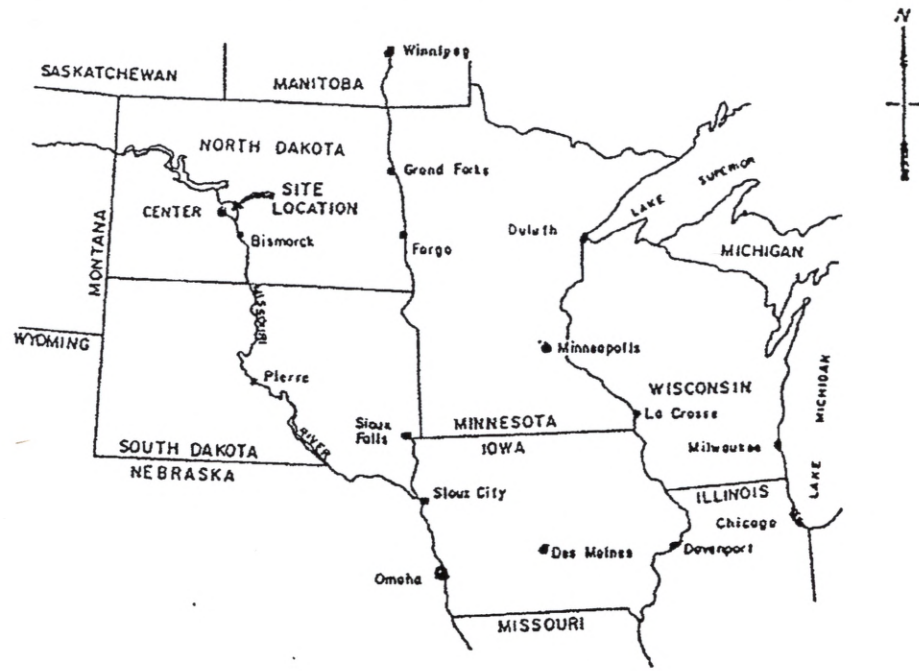
LOCATION MAP SCALE IN MILES 0 50 100 150