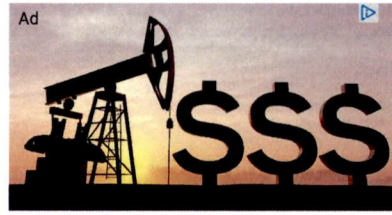
Oil $500 A Barrel?

Wisconsin and Michigan. The new company, known as NSP-Dakota, would be an electric distribution company, and gas operations would continue as they are today.