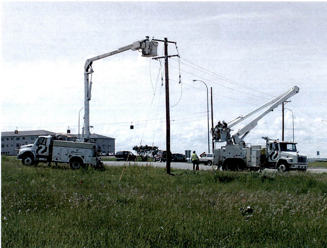
Xcel Energy crews work on a electrical line in Minot.

Xcel Energy is proposing to gradually split its North Dakota and Minnesota electric utility operations into separate companies because of disagreements over regulatory and policy priorities.