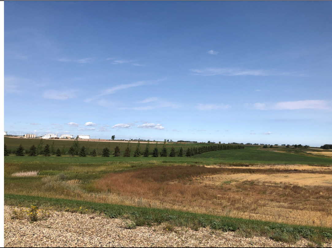
Photo 7 Overview of the planting area and existing trees/shrubs looking N-NW.