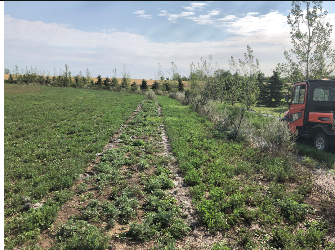
Photo 5 View of the southwest end of the planting with the least number of surviving shrubs.