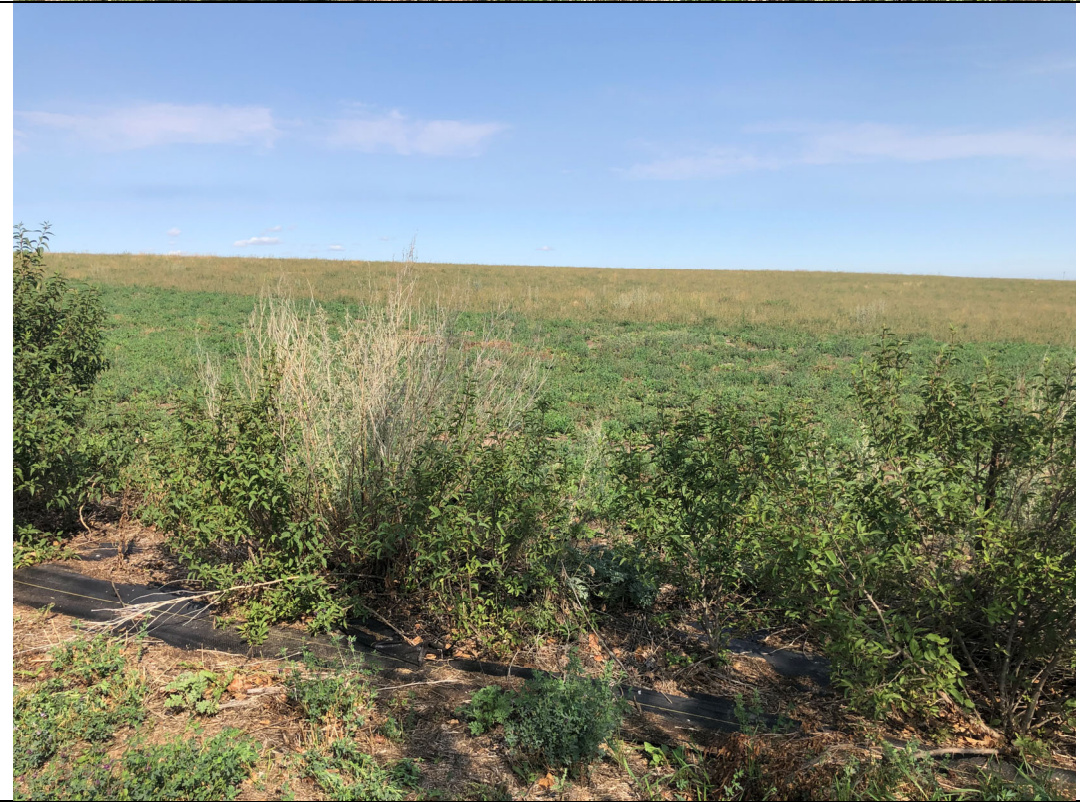
Photo 6 Close-up view of the shrub plantings, one dead shrub visible.