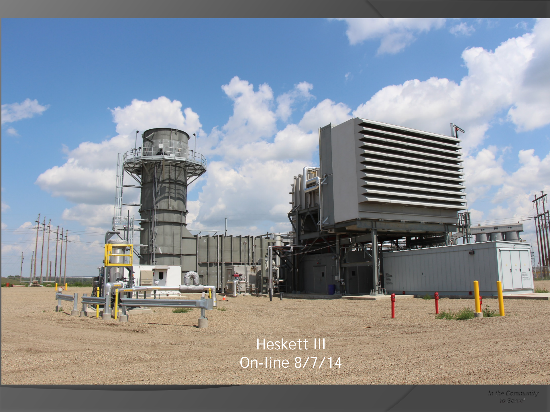
Heskett III On-line 8/7/14