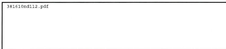
Name of Attached Document

<112> Attach Five-Year Service Quality Improvement Plan or, in subsequent years, your annual progress report filed pursuant to 47 C.F.R. § 54.313(a)(1). If your company is a CETC which only receives frozen support, your progress report is only required to address voice telephony service.