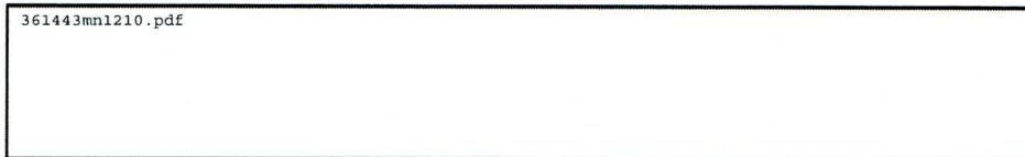
Name of Attached Document

<1210> Terms & Conditions of Voice Telephony Lifeline Plans