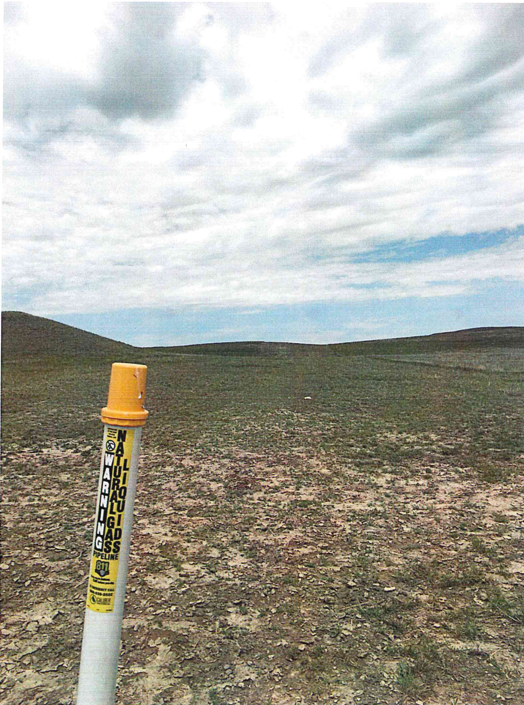
April 4 th , 2016 correspondence - Exhibit Page 6

Case No. PU-14-689 Caliber Midstream Partners, L.P. 6" NGL Pipeline Project McKenzie County April 4 th , 2016 correspondence