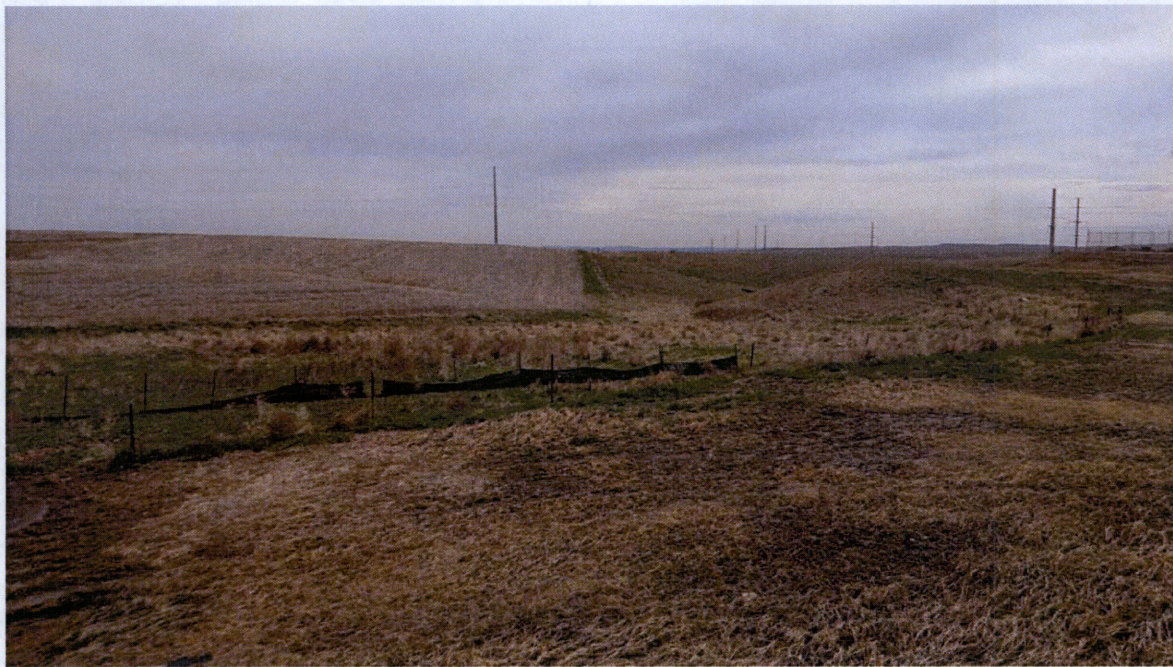
Photo 2. Silt fence protecting wetland at substation on west end of Project in need of maintenance.