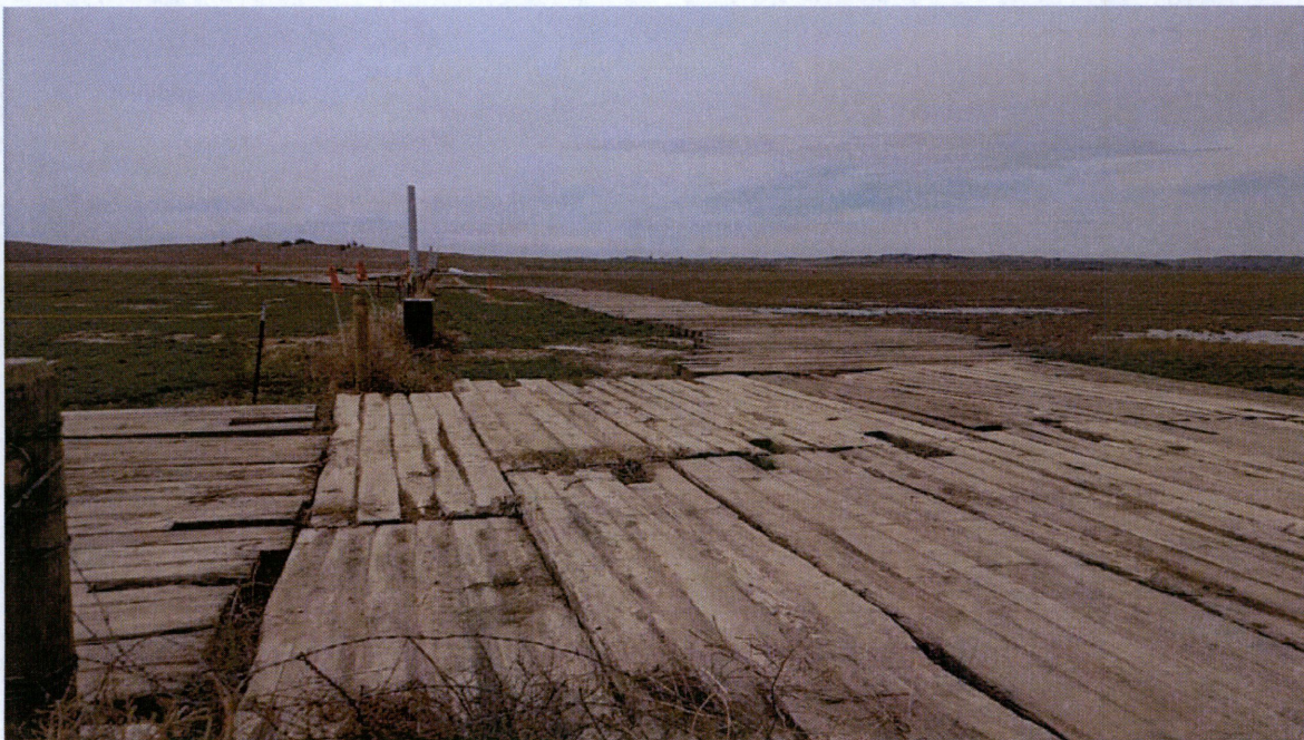
Photo 6. Construction mats for accessing ROW within wetland (under NW 12 Permit).