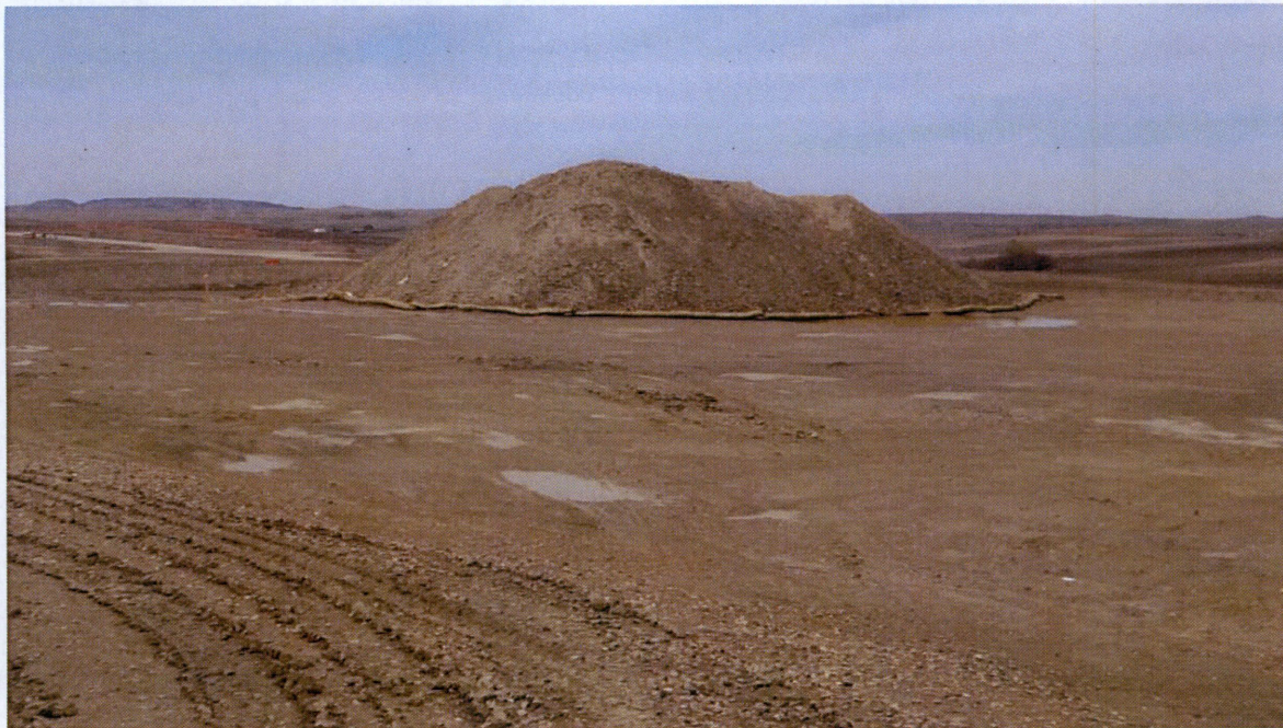
Photo 3. Subsoil pile on level surface, protected by waddles.