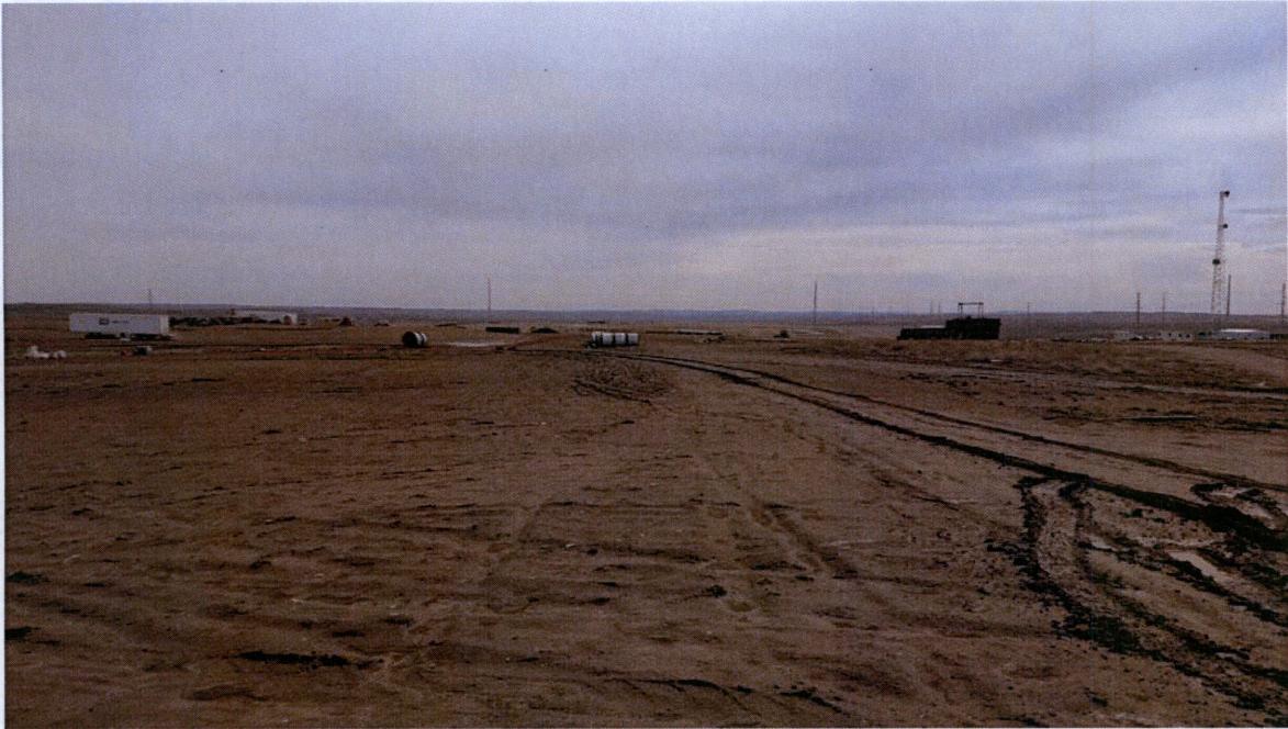
Photo 1. Substation on west end of Project, showing muddy conditions and stored equipment.