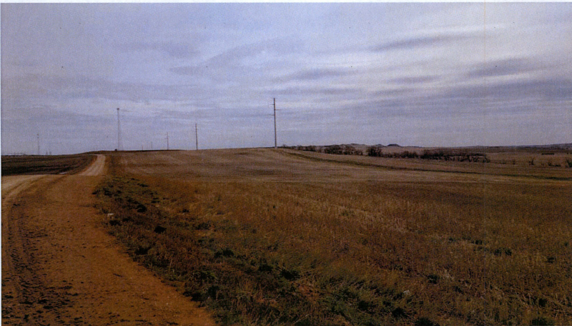
Photo 5. General landscape and ROW along Project.