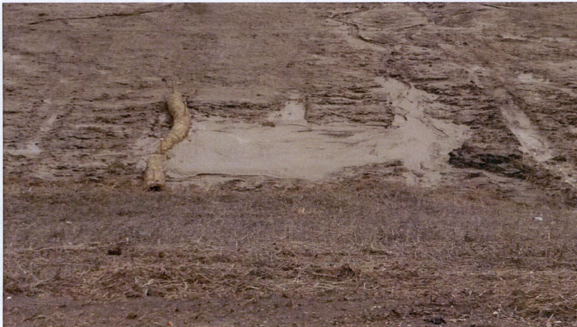
Photo 4. Waddle that will need maintenance after prolong rain event.