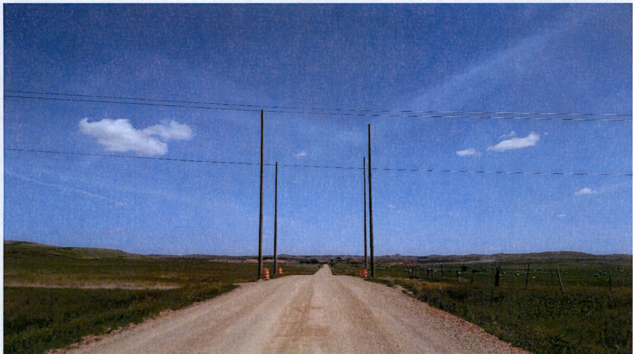
Photo 6. Supports for spanning wire across road.