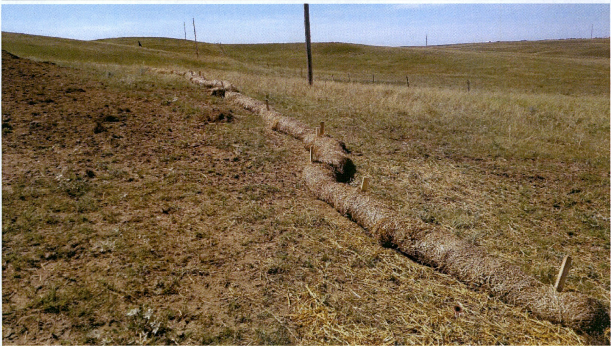
Photo 3. Properly-installed wattle on downhill slope of crane pad.