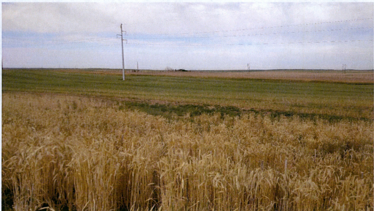
Photo 2. Reclamation progress within the Project Site.