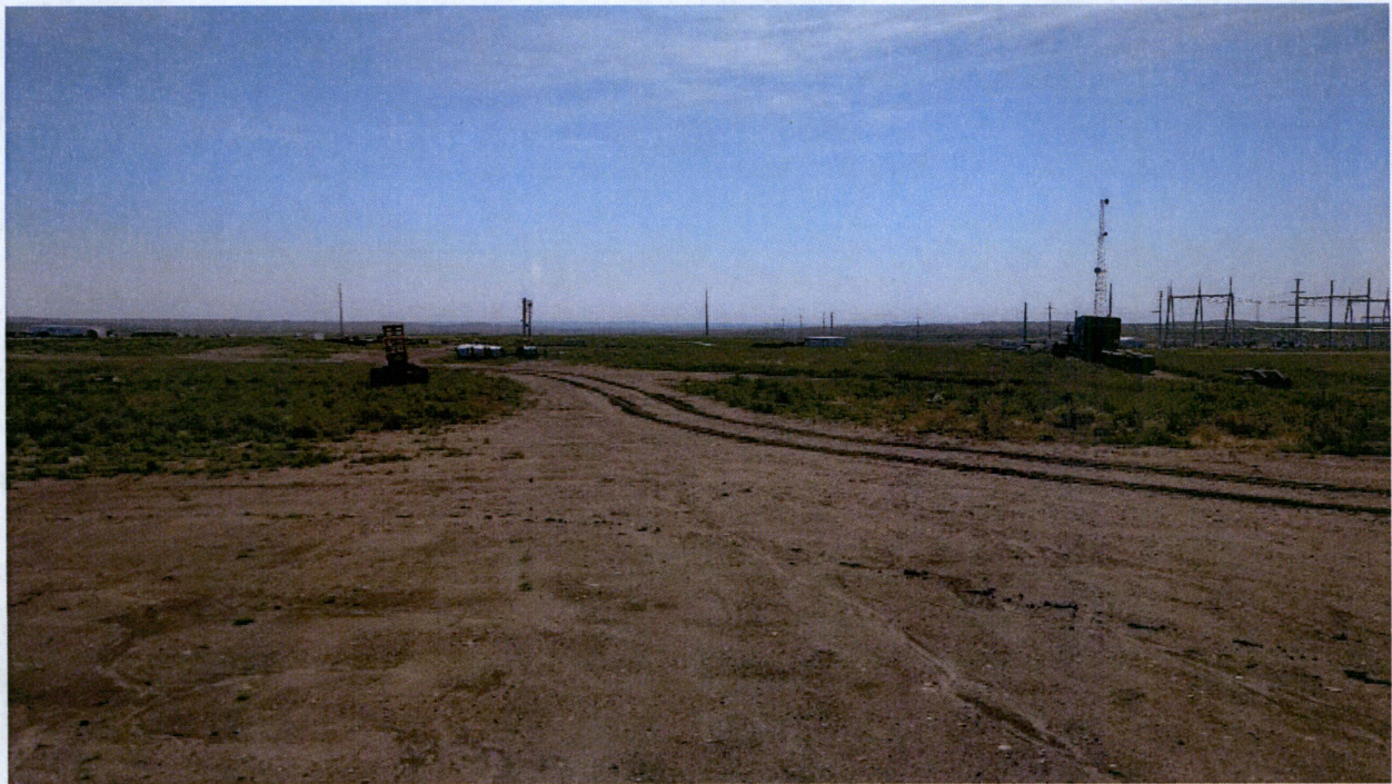
Photo 1. Substation on west end of Project, with stored equipment in the background.