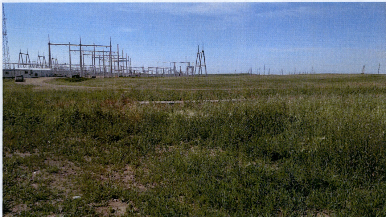
Photo 2. Natural vegetation growth along silt fence/waddles protecting wetland at substation on west end of Project.