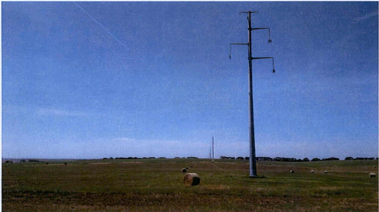
Photo 4. General landscape and ROW along Project.