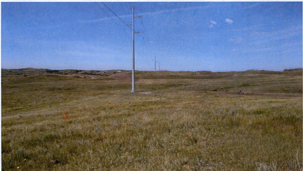
Photo 5. Strung towers spanning recent pipeline project.