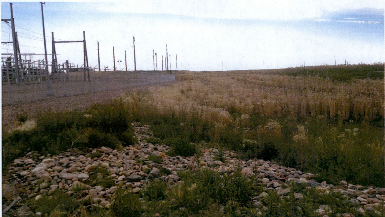
Photo 3. Lonesome Creek Station perimeter with partially-reclaimed side-slope and riprap.