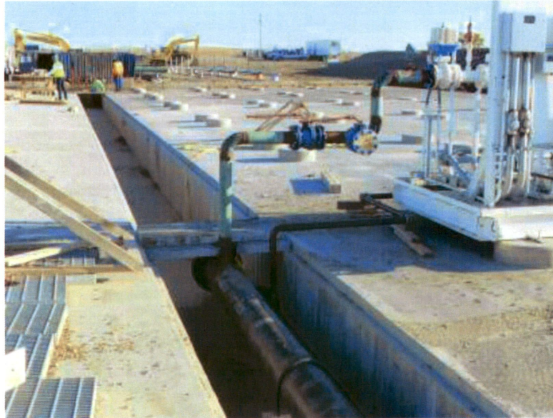
Picture 3 - Tractor Trailer LACT area west end of pipeline