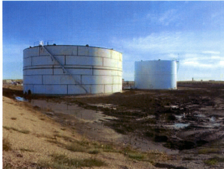
Picture 1 - New 55,000 barrel storage tank nearly completely constructed