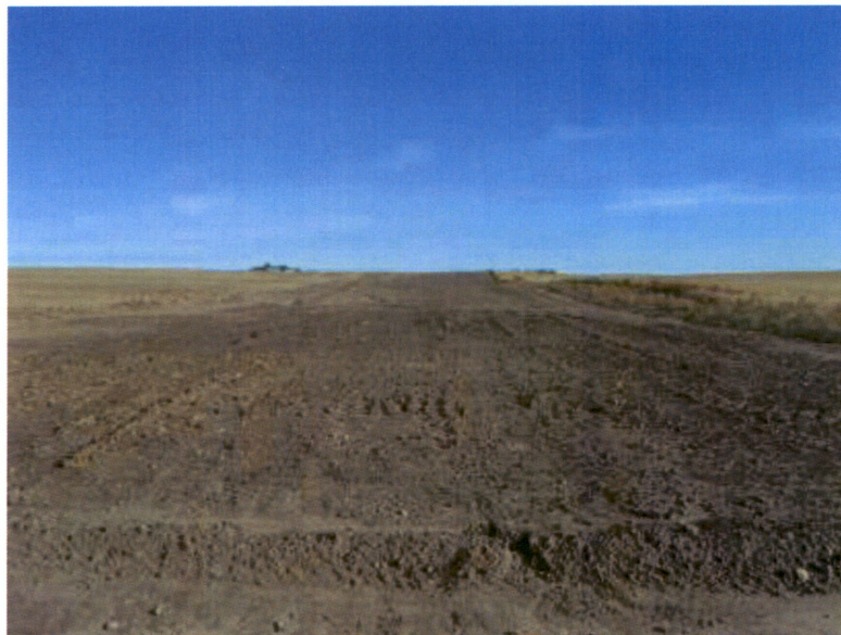
Picture 4 - Typical area where backfill and grading have taken place