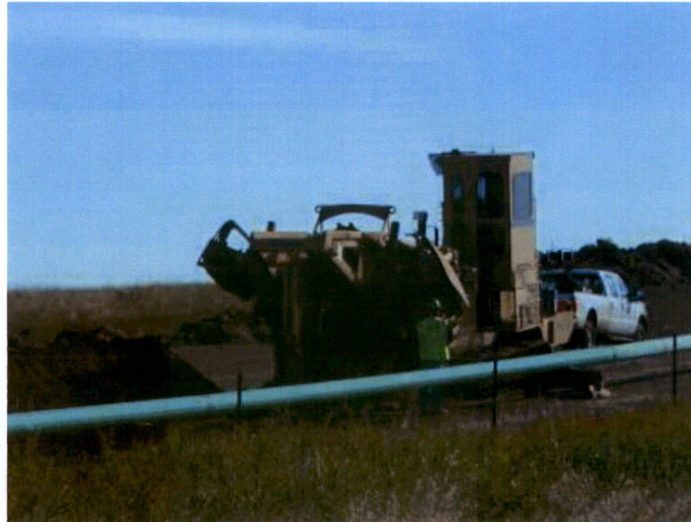
Picture 7 - Piping trencher in operation