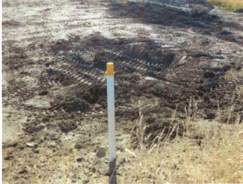
Picture 5 - Typical piping cathodic protection point