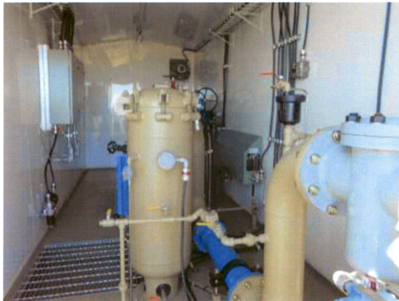
Picture 10 - Inside view of LACT on east side of pipeline