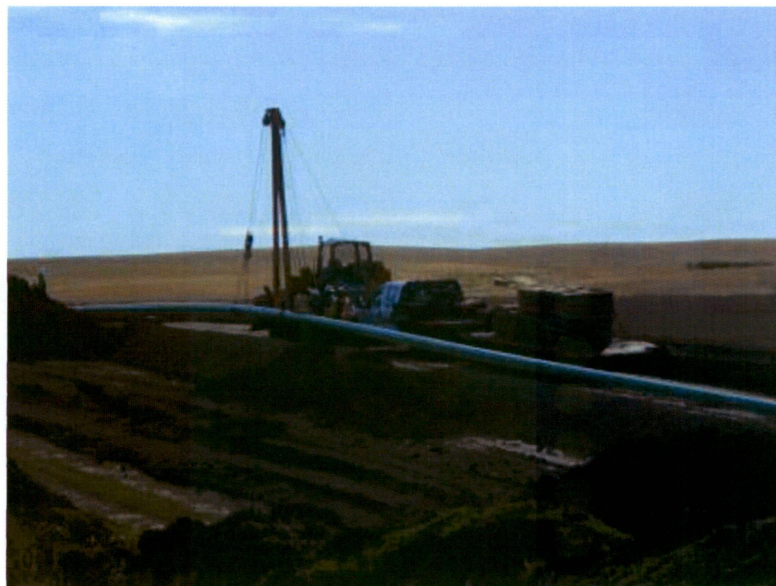
Picture 8 - Pipe being placed in trench