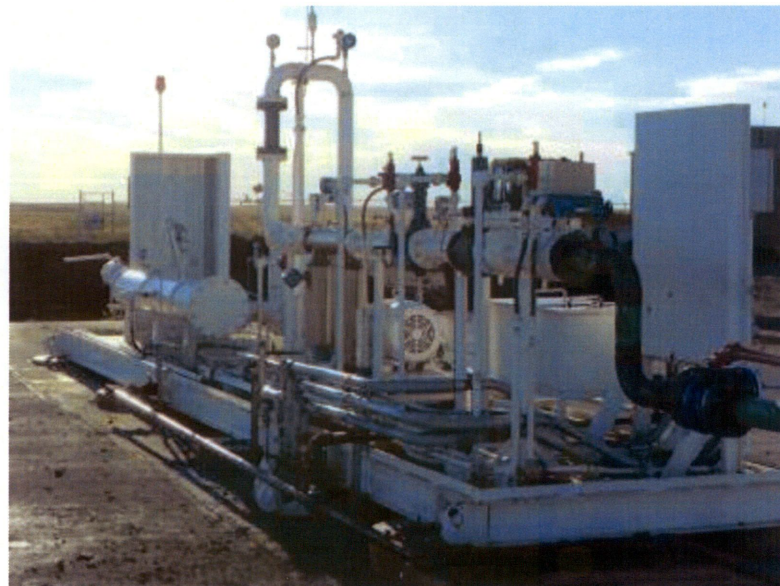
Picture 2 - Piping serving future truck LACT area