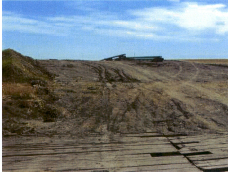
Picture 9 - Typical matting set at critical areas