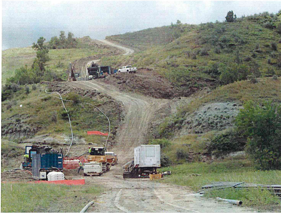
Report Photo #3 "Overview Site Looking North from Slip Bore Machine Level": 47.6072°N 102.8764°W