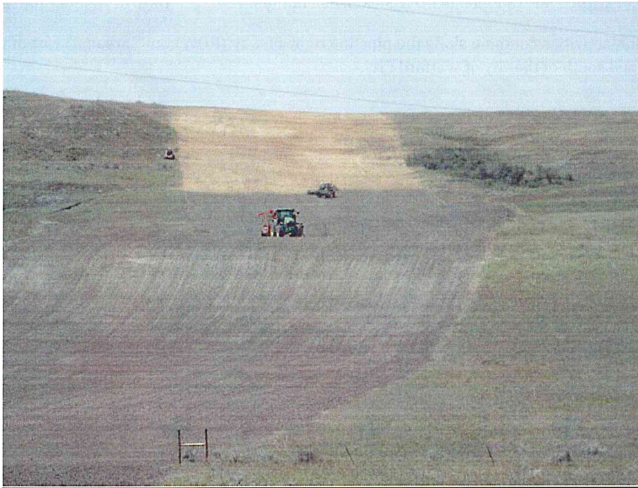
Report Photo #2 "Pipeline ROW West of County Road 37" Looking West: 47.7833°N 103.2192°W