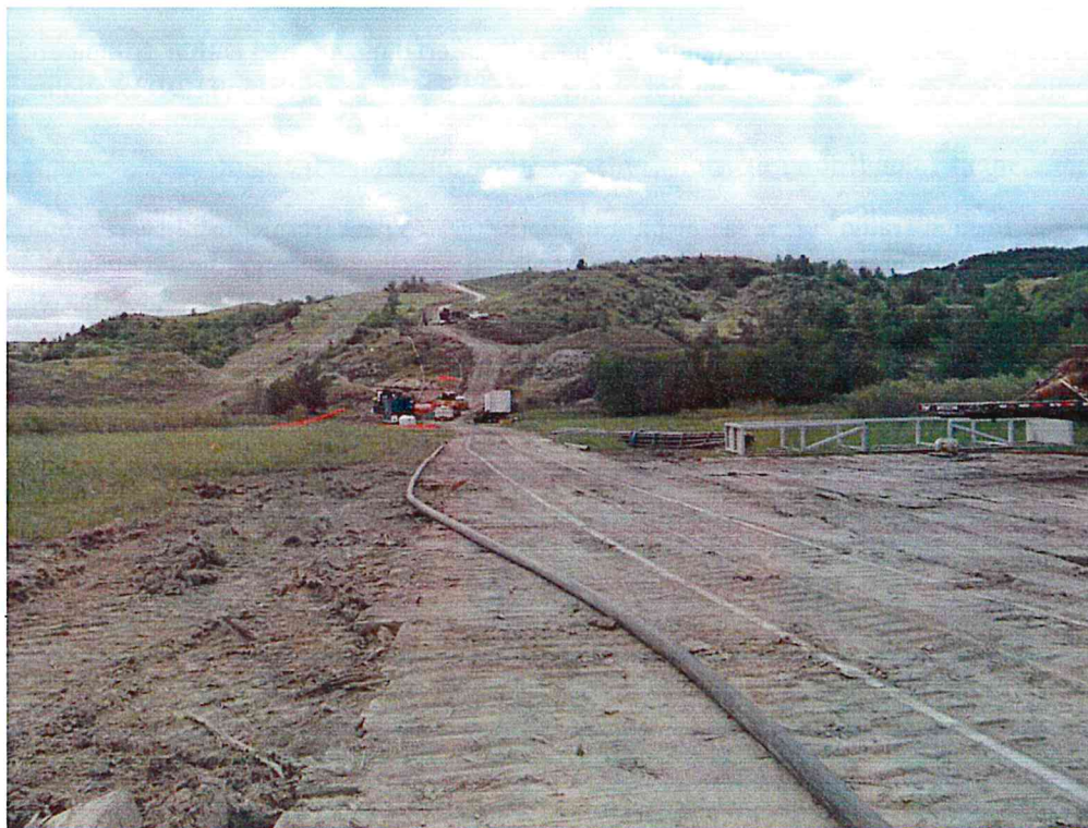
NOTE: Bridger ROW to 50 feet to east (left)

Report Photo #1 "Overall Site Looking South Toward Backside of Prior Slip": 47.6069°N 102.8765°W