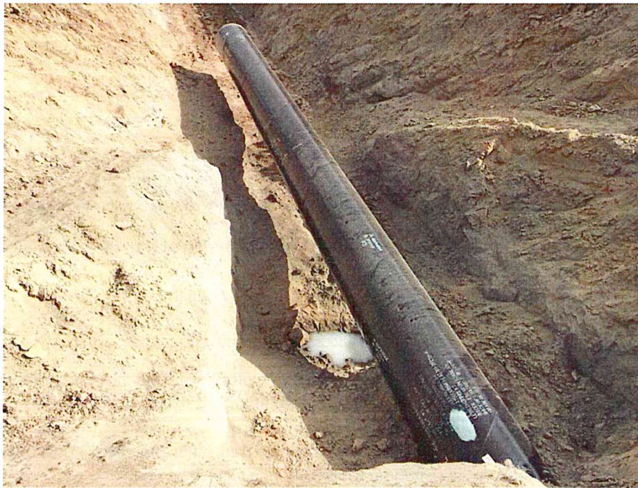
Report Photo #2 "Adequate Depth Trench with HDD/Std Pipe Looking NNE":