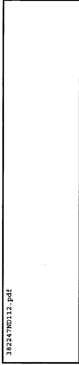
Name of Attached Document

<112> Attach Five-Year Service Quality Improvement Plan or, in subsequent years, your annual progress report filed pursuant to 47 C.F.R. § 54.313(a)(1). If your company is a CETC which only receives frozen support, your progress report is only required to address voice telephony service.