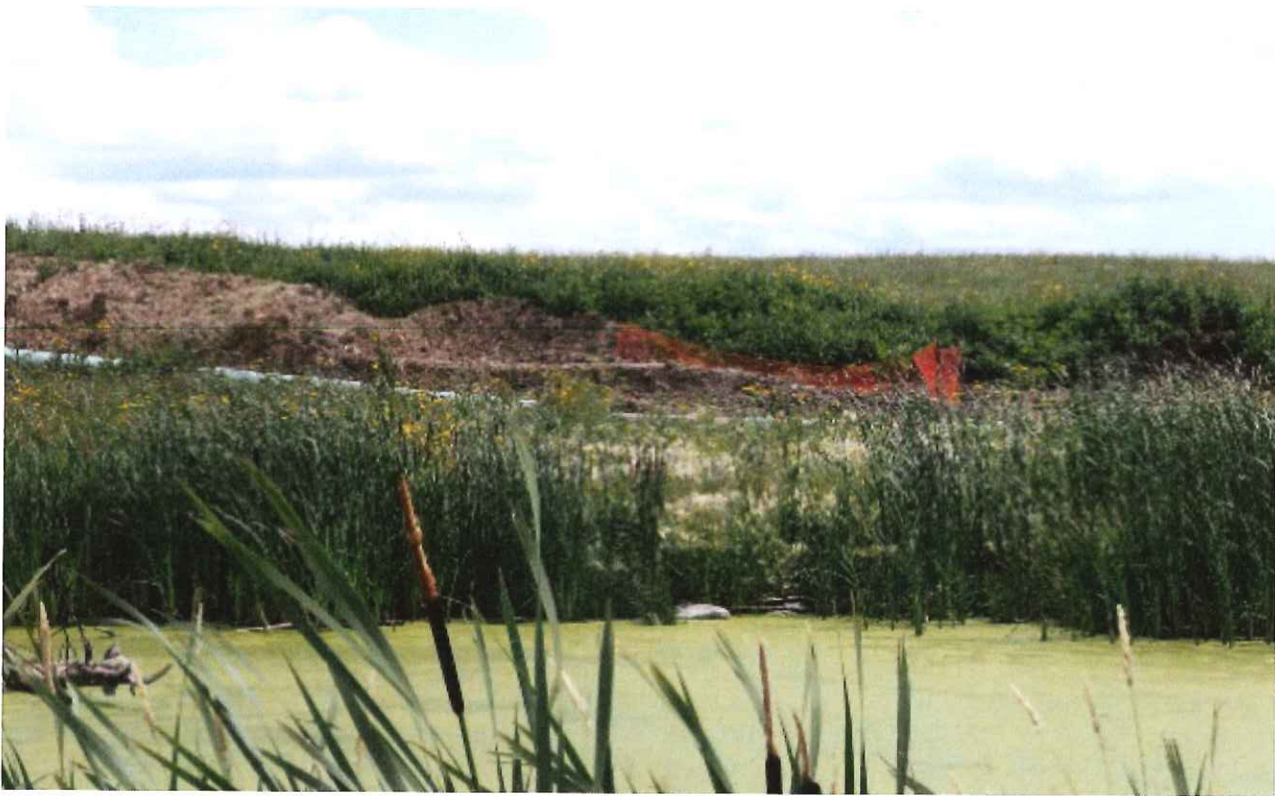
The next two photos, taken at a location east of 87 th Avenue on an unnamed road in Mountrail County, show an area where silt fence was installed but then evidently run over and neglected.