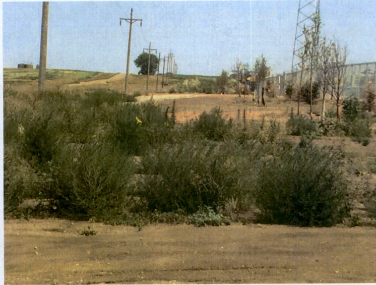
Photo No. 3 Tesoro Pipeline Station 4+00 to 0+57 PI #2 of Pipeline Project South of 40 th Street NW July 31, 2017

The above picture taken is looking east. The photograph represents the landscaping between the Tesoro property and the 40 th Street NW right of way. Trees were planted to buffer the Tesoro fenced area. Ownership of disturbed area is Tesoro. No action is necessary.