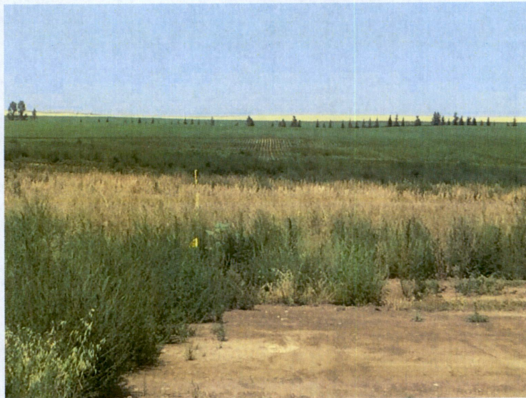
Photo No. 4 Tesoro Pipeline Station 4+20 to 7+81 PI #2 of Pipeline Project South of 40 th Street NW July 31, 2017

The above picture taken is looking east. The photograph represents the landscaping between the Tesoro property and the 40 th Street NW right of way. Trees were planted to buffer the Tesoro fenced area. Ownership of disturbed area is Tesoro. No action is necessary.