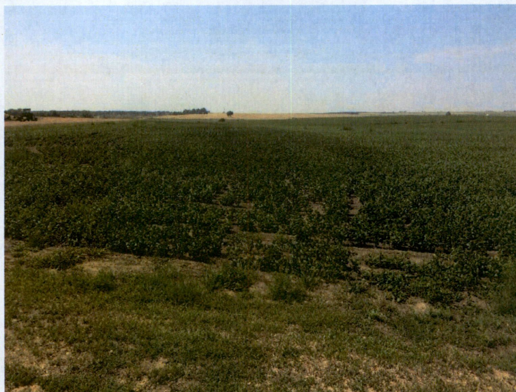
Photo No. 5 Tesoro Pipeline Station 4+20 to 7+81 PI #3 of Pipeline Project South of 40 th Street NW July 31, 2017

The above picture taken is looking north beyond 40 th Street NW. The photograph represents the landscaping south of 40 th Street NW and crops planted north of 40 th Street NW. Ownership of disturbed area is Tesoro. No action is necessary.