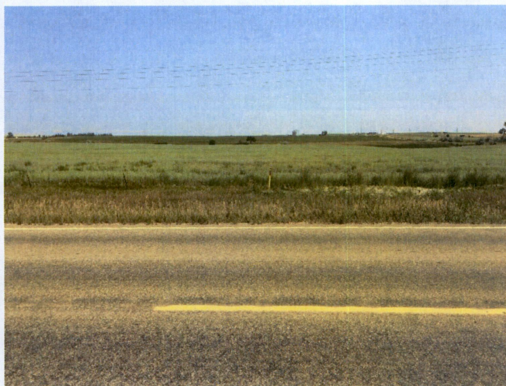
Photo No. 8 Tesoro Pipeline Station 46+00 to 42+89 Pipeline Bored under the Highway Looking East of ND Hwy 1806 July 31, 2017

Picture taken is looking east towards PI #7 from ND Highway 1806. The photograph represents the crops planted on the east side of the highway. There is a good stand of crops though this area has been under severe drought conditions. The land is owned by Harvey O. and Elizabeth A. Thompson Trust. No action is necessary.