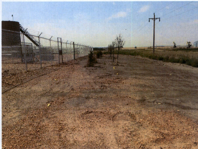
Photo No. 2 Tesoro Pipeline Station 0+57 to 2+00 PI #1 of Pipeline Project South of 40 th Street NW July 31, 2017

The above picture taken is looking west. The photograph represents the landscaping between the Tesoro property and the 40 th Street NW right of way. Trees were planted to buffer the Tesoro fenced area. No action is necessary.