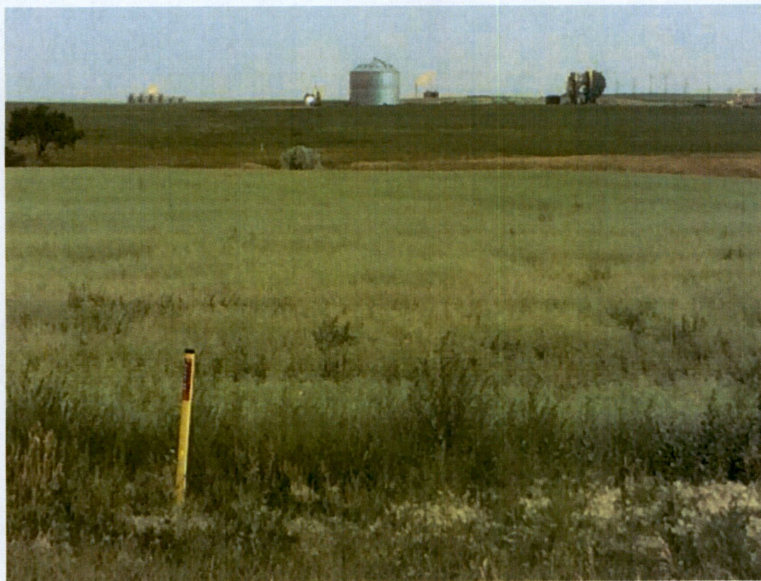
Photo No. 7 Tesoro Pipeline Station 9+69 to 42+89 Between PI #3 and PI #6 of Pipeline Project North of 40 th Street NW July 31, 2017

The above picture taken is looking east towards PI #3 from gravel road. The photograph represents the crops planted on the North side of 40 th Street NW and west of PI #3. There is a good stand of crops though this area has been under severe drought conditions. The land is owned by Kenneth A. Mogen. No action is necessary.