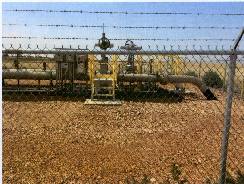
Photo No. 11 Tesoro Pipeline Station 67+02 End of Pipeline west of Highway 1806 Looking West July 31, 2017

The above picture taken is located immediately south of PI #8. The photograph represents the Tesoro station. The land is owned by Tesoro. No action is necessary.