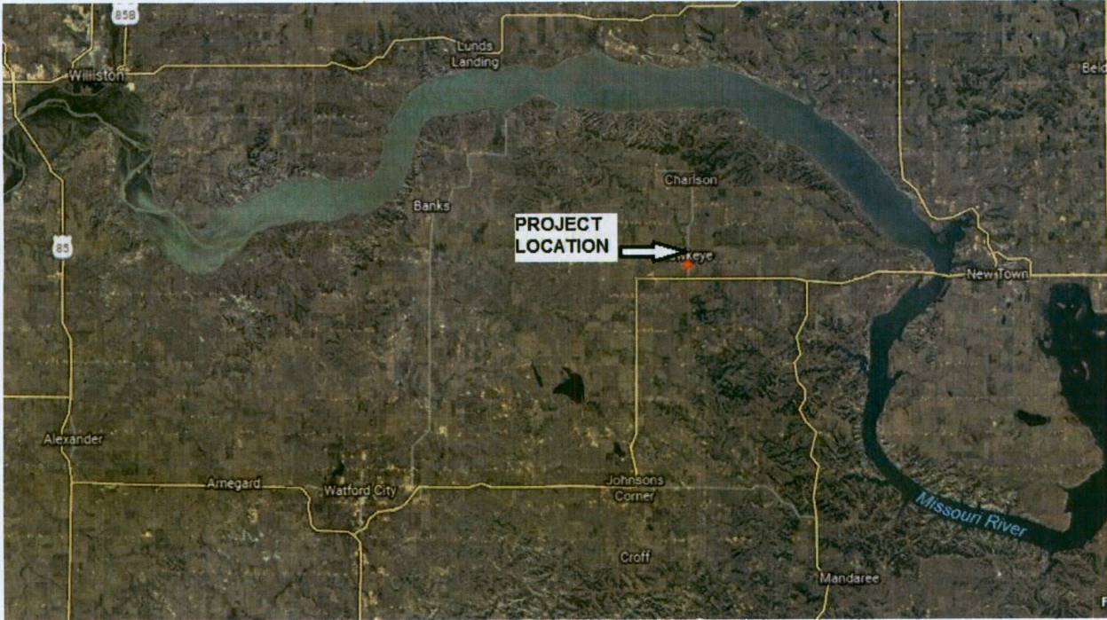
Project Location- Exhibit 1 Tesoro Pipe Line Project PU15-720