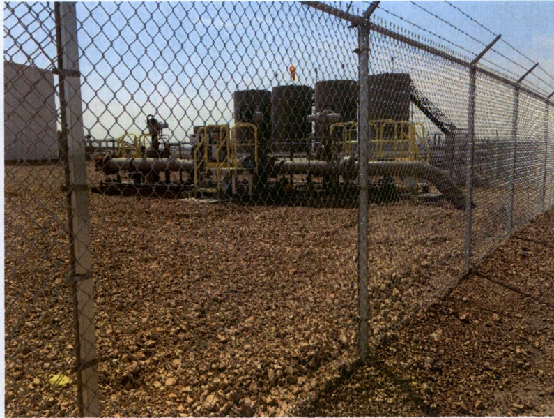
Photo No. 1 Tesoro Pipeline Station 0+00 Starting Point of Pipeline Project South of 40 th Street NW July 31, 2017