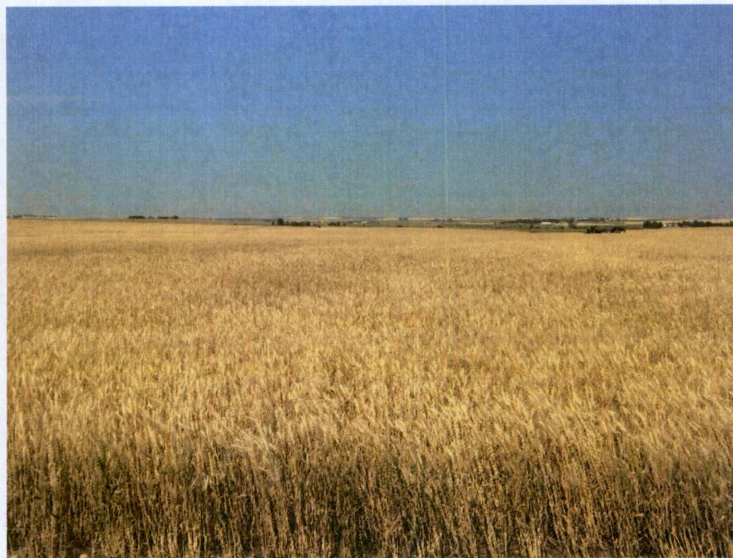
Photo No. 10 Tesoro Pipeline Station 56+00 to 50+00 Pipeline west of Highway 1806 Looking East towards PI #7 July 31, 2017

The above picture taken is looking west towards PI #8 from ND 1806. The photograph represents the crops planted on the West side of the Highway. There is a good stand of crops, though this area has been under severe drought conditions. The disturbed area was part of the boring operation, however, crops were not planted in the disturbed area this season. The pipe line goes past the trees on the horizon. The land is owned by Paul and Milo Wisness. No action is necessary.