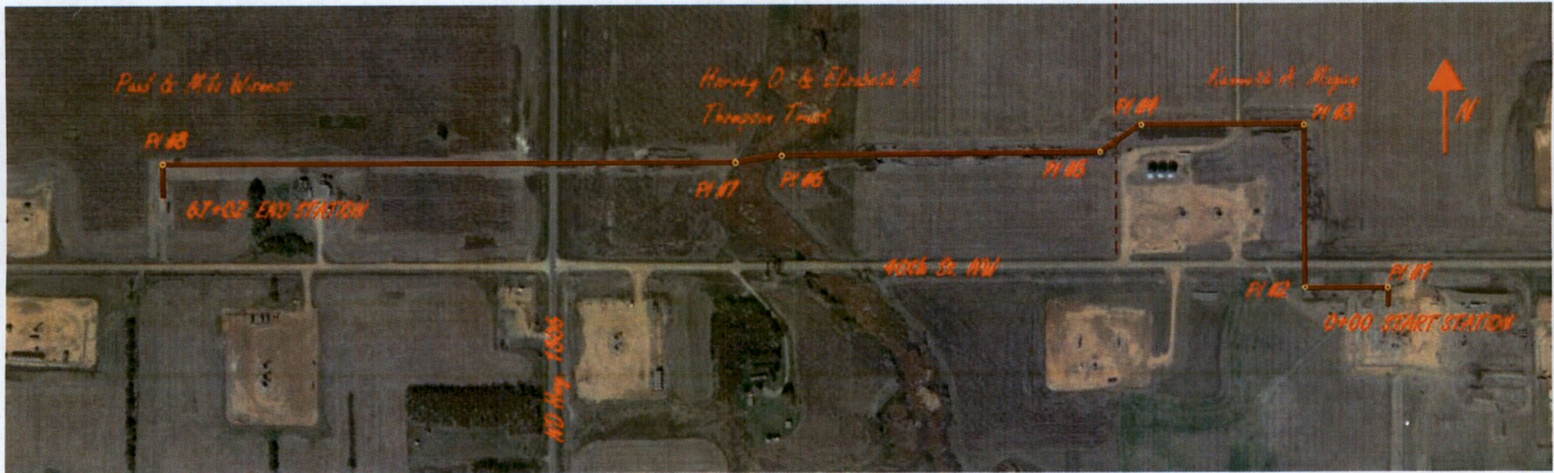
Project Overview- Exhibit 2 Tesoro Pipe Line Project PU15-720