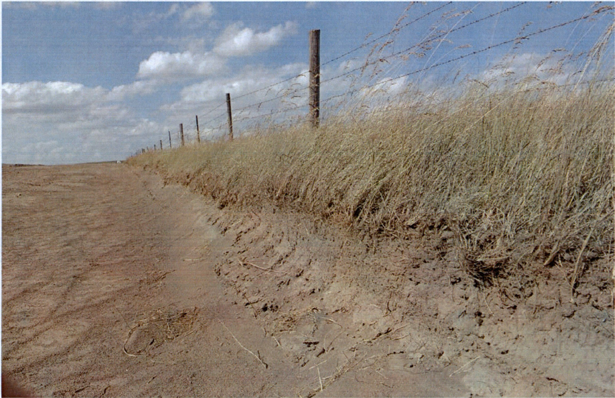
Report Photo #2 "Topsoil removal and north stockpile"