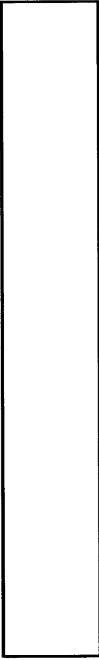
Name of Attached Document

<010> Study Area Code 381636 <015> Study Area Name UNITED TELEPHONE MUTUAL AID CORP. <020> Program Year 2017 <030> Contact Name - Person USAC should contact regarding this data Perry Oster <035> Contact Telephone Number - Number of person identified in data line <030> 7012565156 ext. <039> Contact Email Address - Email Address of person identified in data line <030> poster@utma.com