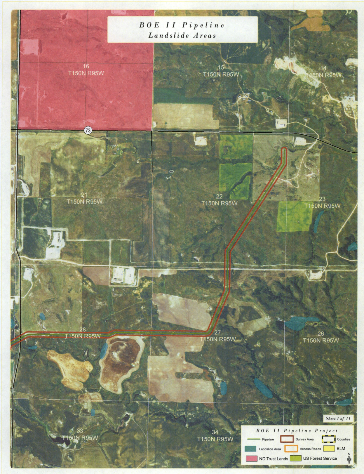
Figure A-11. Landslide Areas