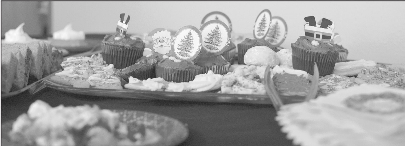
Decisions, decisions....Twas no easy task to pick just one with this delicious assortment of desserts at the St. Catherine Christmas Eve Dinner.