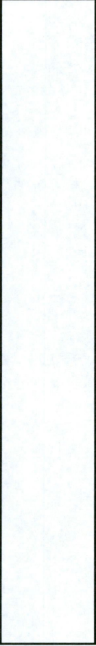
Name of Attached Document

<010> Study Area Code 381636 <015> Study Area Name UNITED TELEPHONE MUTUAL AID CORP. <020> Program Year 2018 <030> Contact Name - Person USAC should contact regarding this data Perry Oster <035> Contact Telephone Number - Number of person identified in data line <030> 7012565156 ext. <039> Contact Email Address - Email Address of person identified in data line <030> poster@utma.com