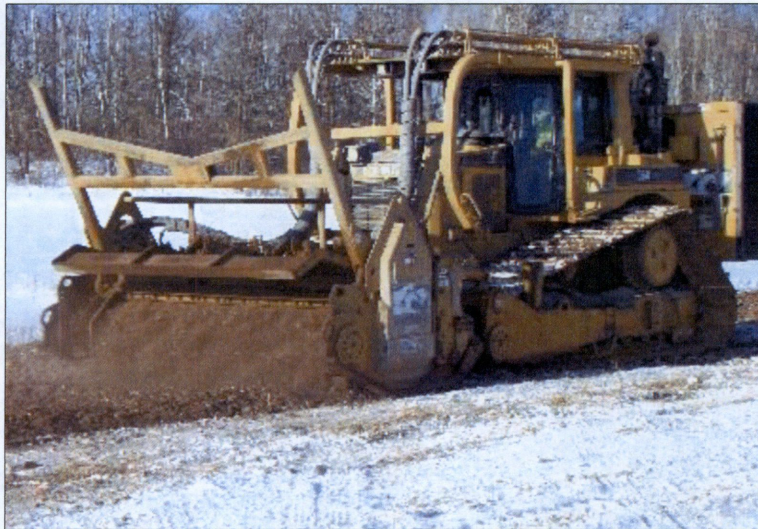
Iron Wolf Breaking up Frozen Topsoil

Topsoil Removal: Topsoil segregation should be completed prior to frozen soil conditions where practicable in areas with long periods of frozen conditions. When the topsoil is frozen at the time of topsoil stripping, multiple passes (vs. a single pass) with a bulldozer or other specialized equipment may be necessary to remove only the topsoil and not the subsoil. Specialized equipment (e.g., soil rippers) may be necessary to break up the topsoil prior to removal. An "Iron Wolf" or pavement grinder can remove frozen topsoil; however, the use of this method should be reserved for special situations and in cooperation with landowners and regulatory agencies because this process can affect the native soil structure.