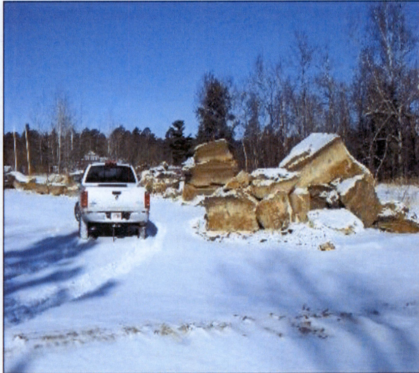
Topsoil Frozen to Subsoil

Frozen soil conditions in upland (unsaturated, non-wetland) areas can create a firm working surface with a low potential for topsoil mixing. Planning to construct over frozen soils could be a factor in determining how large of an area over which to segregate topsoil. However, frozen conditions are not always consistent and intermittent thaws can occur depending on the location or annual variations in cool season temperatures. Construction or restoration work could extend into the spring thaw period due to unanticipated schedule slowdowns or an unseasonably early thaw period.