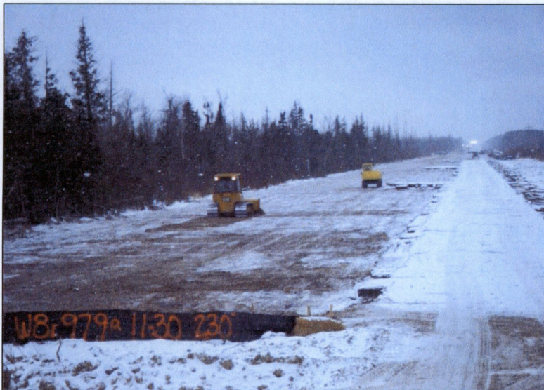
Preparing the Right-of-Way

Advance Planning with the Landowner: Prior to construction, land agents should address snow removal and storage with landowners. Items to discuss with landowners include snow removal equipment, snow storage areas, and existing features (gates, fences, etc.). In the pre-planning phase, it is recommended that land agents identify and gain landowner approval for extra area off the approved right-of-way and along access roads to allow snow storage. Previous projects in northern climates have used additional