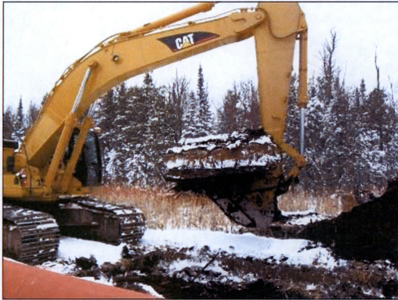
Segregating Frozen Topsoil Layer in Wetland

Construction through wetlands and other wet areas presents its own unique challenges, such as wheel rutting and mixing of soils, impacts to plants and other species, and downtime from construction equipment becoming stuck in loose or saturated soils. The following elements contribute to the challenges inherent in crossing and restoring wetlands and waterbodies and are addressed in this section: soil types, extent of freezing, topsoil segregation requirements, open ditch limitations, and trench subsidence and crowning.