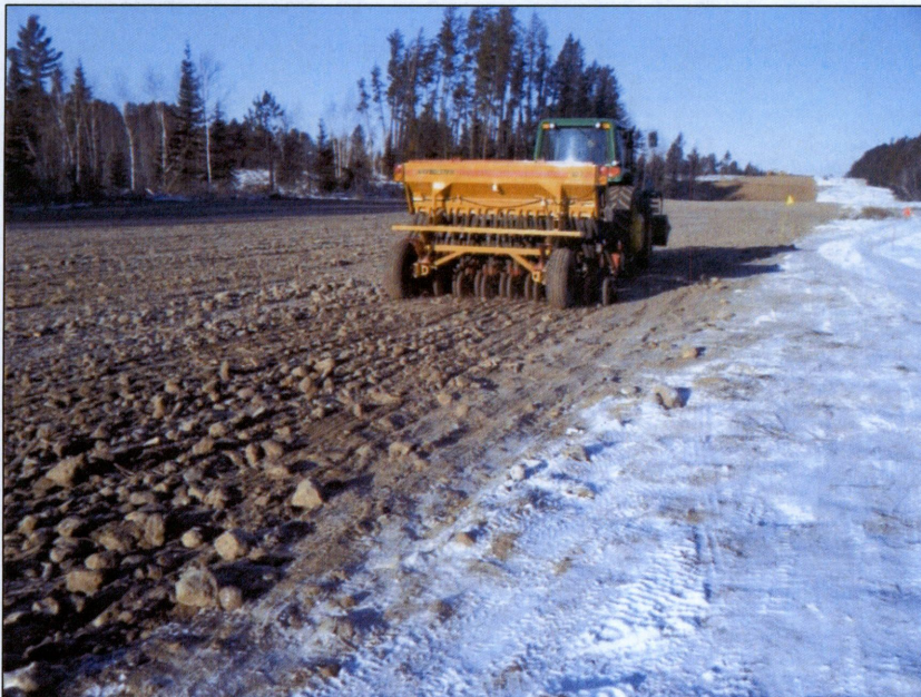
Drill Seeder in Upland Area

Landowners: The plan should emphasize the importance of communicating with landowners throughout frozen conditions about construction activities, construction shut downs, restoration of the right-of-way and cleanup activities timing. It is important to address their expectations for the overall timeframe for construction and restoration activities and for access across the right-of-way at all phases of construction considering that winter construction often extends the overall period of disturbance.