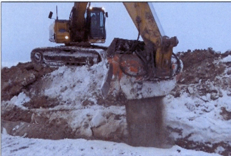
Shaker Equipment Backfilling Trench

A decision-making chain is necessary for determining if work on the construction right-of-way should occur in frozen weather conditions due to changing conditions.