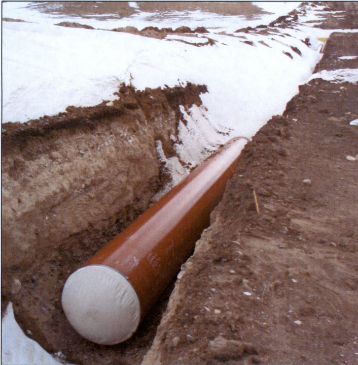
Pipeline Construction in Frozen Conditions

indicated for a given project. The FERC's recommendations recognize the increasing incidence of natural gas pipeline construction during winter months and under frozen conditions, especially in the northern, northeastern, and Rocky Mountain regions.