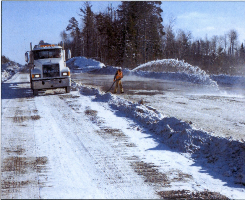
Building the Ice Road

Once the frost road is established, it should be maintained by removing or compacting additional snowfalls to prevent development of an insulating cover as well as to maintain equipment travel. A layer of snow should be kept on the frost road to reflect the sun's energy and minimize thawing during warmer periods of the day. Darker areas of exposed soil can absorb heat and accelerate thawing, reducing the length of time the frost road can be safely used. Bare spots should be covered with snow as soon as possible.