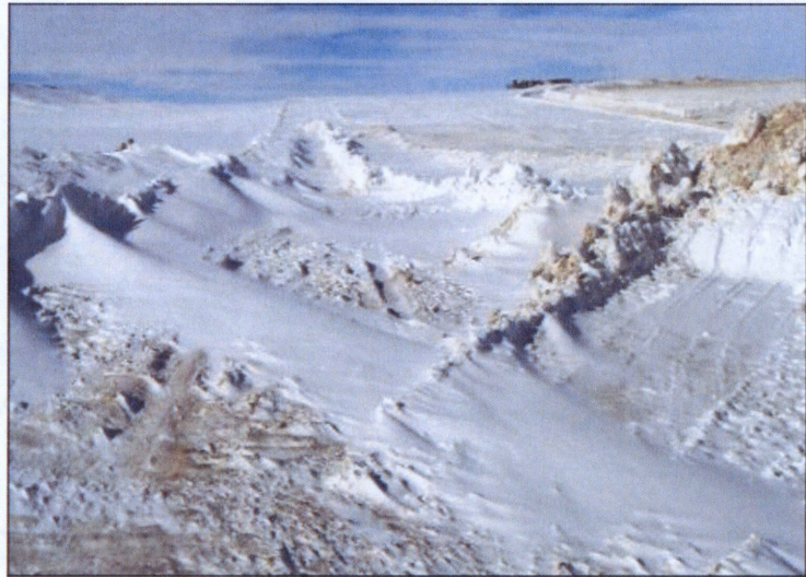
Snow Covered Right-of-Way

Significant snow fall events before or during construction can create unsafe work conditions and make it difficult to complete the job properly. Removal of snow from the construction workspace may be necessary to provide safe and efficient working conditions and to expose soils for grading and excavation. Snow may also need to be removed along access roads to allow safe access to the right-of-way.