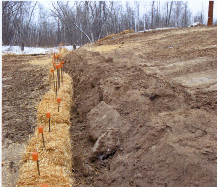
Erosion Control Devices With Protective Caps on Metal Stakes

Certain areas of the right-of-way may not be accessible during thawing periods or during the spring melt due to soft soil conditions, thus preventing regular inspections and hampering repairs or maintenance.