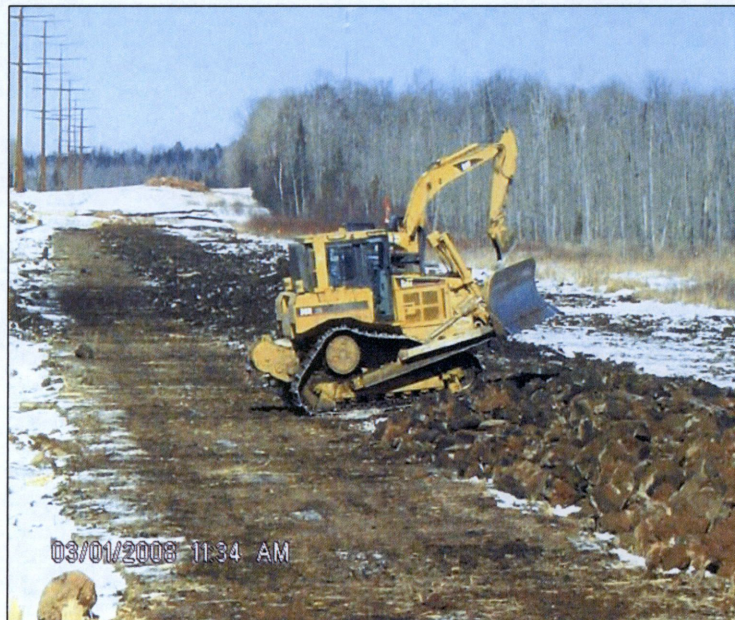
Reducing Frozen Crown Over Backfilled Trench

The crown should only be constructed directly over the backfilled trench with native material and should not extend out beyond the trenchline. Subsoil used to build the crown should not extend above natural surface grade. A crown should always be capped with native topsoil material to ensure elevations will be restored with topsoil at the surface. If the topsoil layer has been removed