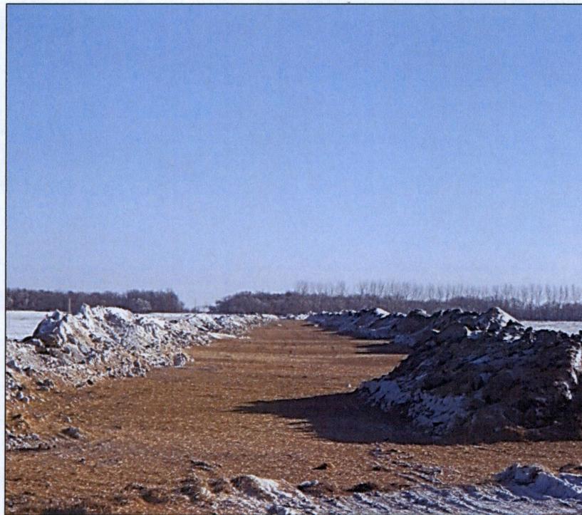
Right-of-Way Prepared for Final Stabilization

Monitoring Plan: If final cleanup and restoration activities have not occurred prior to the spring melt, monitoring of the right-of-way should be implemented during the delay between construction and restoration or temporary shutdown of construction activities. The monitoring program should identify: (1) erosion control structures requiring repair; (2) areas of slope instability; and (3) areas where significant levels of erosion are occurring. The EI should determine the most effective means of dealing with identified problems, taking into consideration the suitability of the right-of-way for access by equipment, potential damage that could