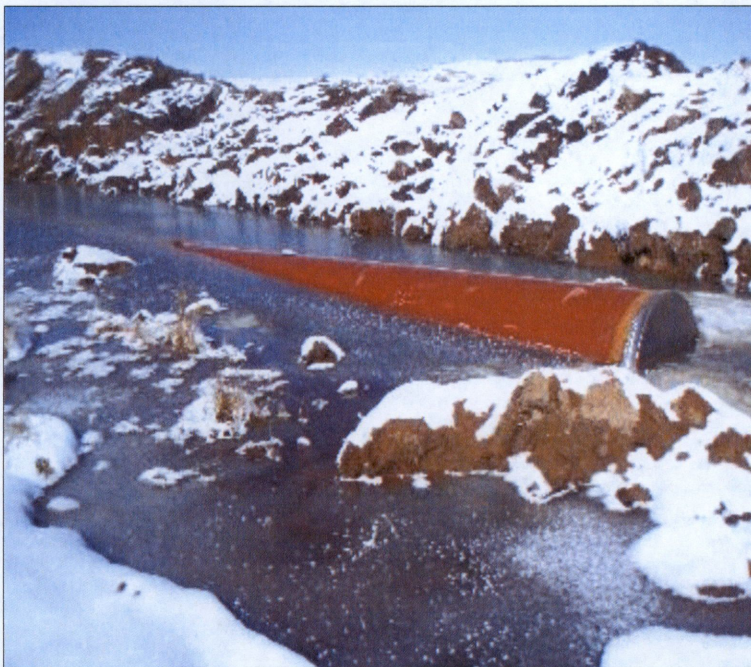
Trench With Frozen Infiltrated Groundwater

Equipment Care: Freezing conditions make operating equipment outdoors more difficult. Lubricants and other liquids in pumps can freeze up and not operate. Plans should consider measures to ensure equipment is protected from the elements and operational prior to use. When dewatering during freezing conditions, pumps may have to be installed in small, heated shelters to prevent the pumps from freezing and becoming non-operational or causing damage to the pumps that could result in a spill or leak of lubricants or fuel. The use of anti-freeze liquids in the pump housing is not recommended due to the difficulty of removing the potentially hazardous liquids prior to the re-use of the pumps.