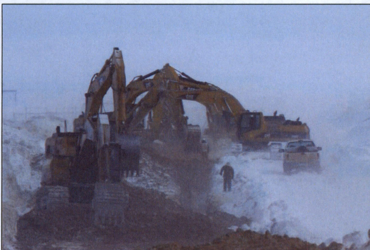
Pipeline Construction in Frozen Conditions

In a March 2013 report on United States natural gas pipeline capacity, the U.S. Energy Information Administration (EIA) noted that “more than half of new pipeline projects that entered commercial service in 2012 were in the Northeast.” 1 Elsewhere on the EIA’s website, data show that the number of producing gas wells in the United States has increased by 36 percent from 2001 to 2011. 2 This number includes an increase in producing gas wells of 36 percent in Pennsylvania and Colorado and 152 percent in North Dakota over the same