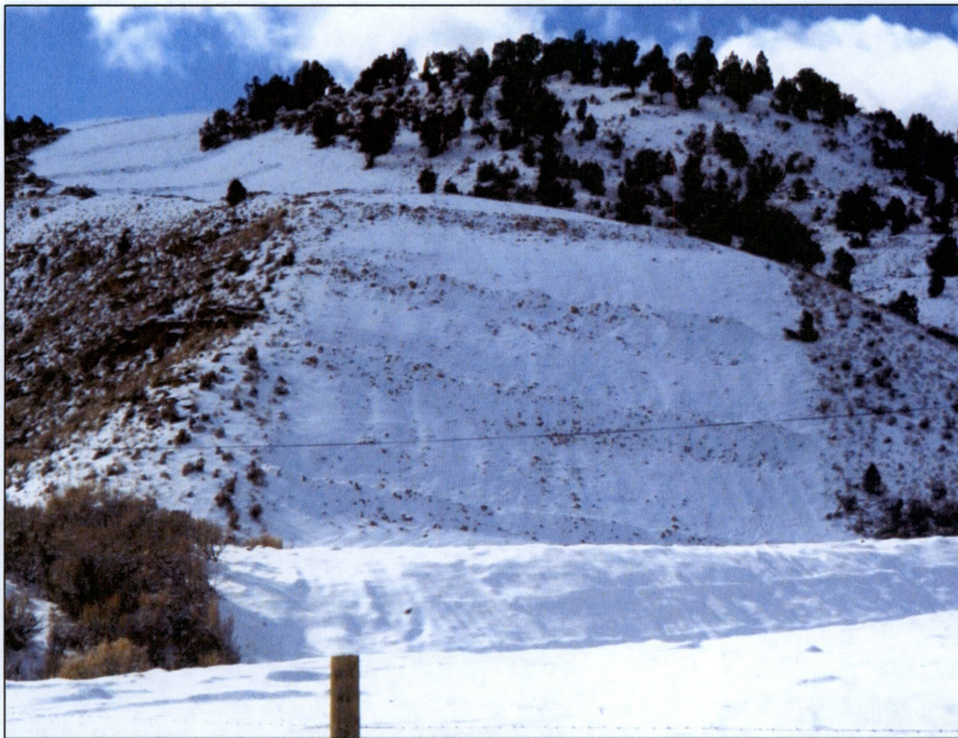
Right-of-Way Stabilized for Winter

Whether restoration is completed under frozen conditions or delayed until the spring or summer period, the right-of-way will require stabilization prior to the spring thaw. Seed intended for site stabilization or restoration will not germinate under frozen conditions, and therefore Companies should plan for alternative methods of site stabilization prior to the first spring rains (see Section 7.0, Temporary Erosion and Sediment