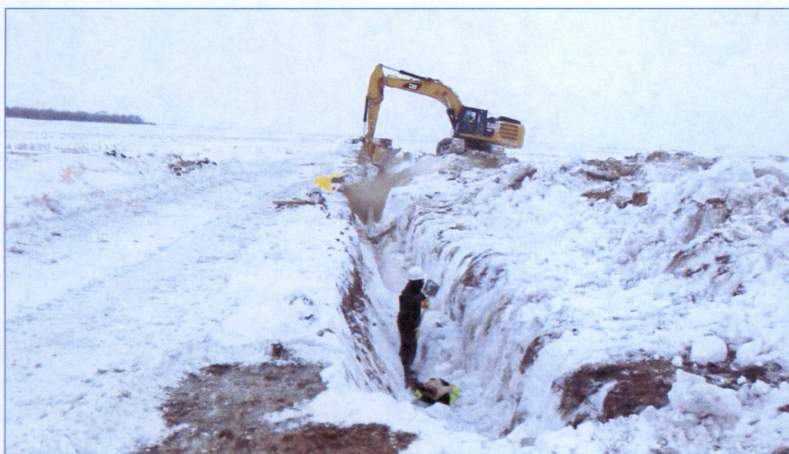
Snow Removal From Trench

The guidelines presented herein focus on construction and environmental protection practices unique to frozen conditions. These guidelines primarily focus on providing additional information to Companies regarding what to consider when developing a project-specific frozen conditions plan and what past practices have been successful under frozen conditions. In this way, the guidance presented in this document may also be used by Companies to develop project-specific plans based on each project's unique location, timing, and other variables.