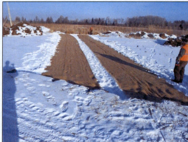
Stabilization of the Right-of-Way

Timing of Restoration: Determine whether the project will be completely restored or if restoration will be delayed until after the spring thaw. Backfill all areas of open excavation or provide safety fencing and signage for protection. If restoration will be delayed, consider leaving the subsoil in a roughened condition to slow the sheet flow of water. After restoration, restore contours for drainage to preconstruction conditions. Delaying seeding can also result in the development of noxious weeds that require treatment, such as the application of herbicides, prior to additional seeding and other restoration activities.