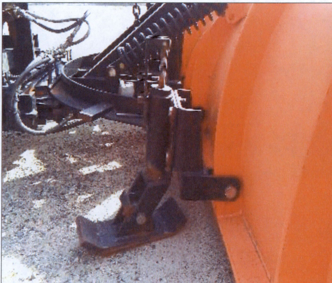
Equipment Modified With a Shoe

Snow removal activities should be monitored by the Environmental Inspector.