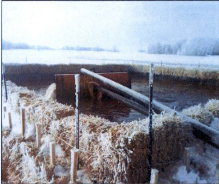
Hydrostatic Test Water Discharge Structure

The management of water is an essential factor of pipeline construction. All new pipelines require the use of water to perform hydrostatic testing prior to placing the line into service. In addition, depending on such project-specific factors as geography, climate, and season, open trenches may fill with water from rain events or from the presence of groundwater. Water in the trench must often be removed (trench dewatering) to prevent the trench sidewalls from collapsing or otherwise to maintain trench or backfill integrity prior to or during pipe installation and restoration. All of these activities can become difficult at best, and dangerous at worst, during sustained frozen conditions.