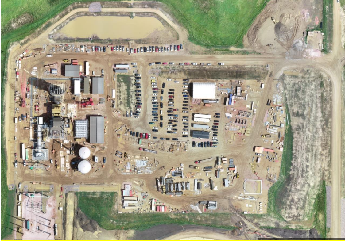
Site activity near end of quarter 7/1/2020