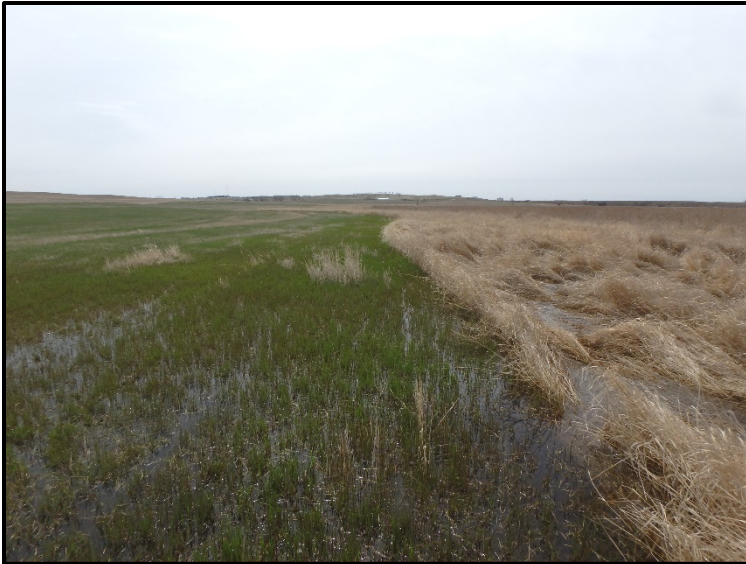
w-18042h-003 (extension) facing south