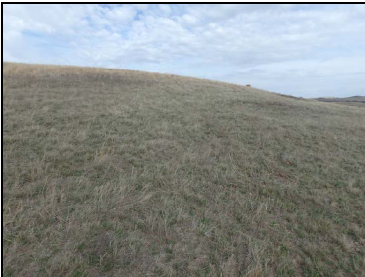
g-19009j-004 facing east