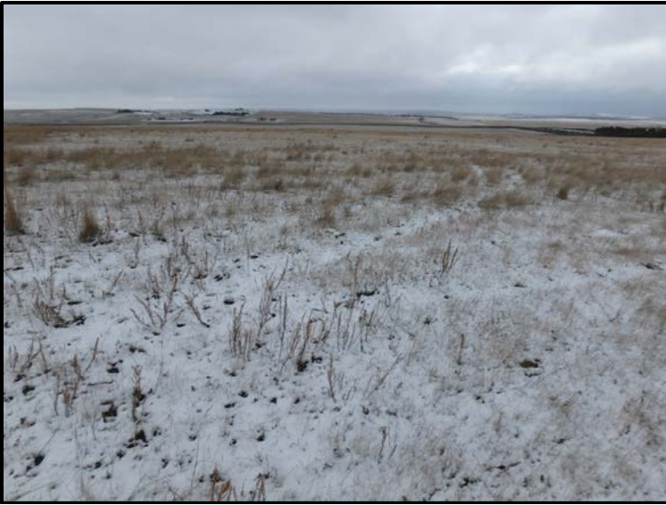
g-19009j-006 facing east