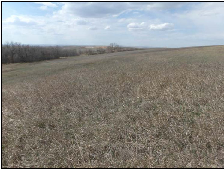
g-19009j-002 facing west