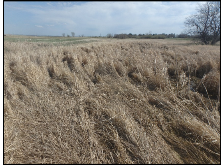
w-19009k-006 facing south