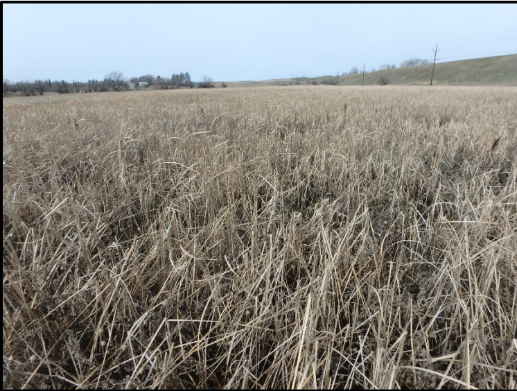
w-19009k-001 facing west