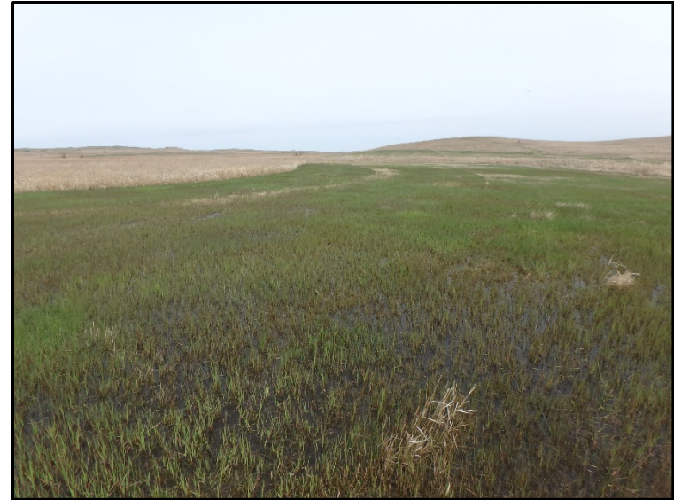
w-19009j-001 facing north