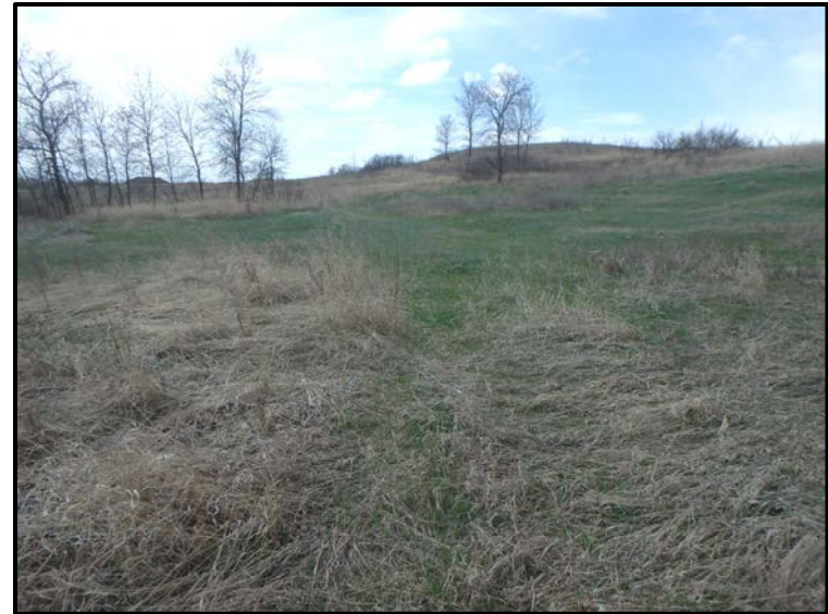
g-19009j-003 facing west