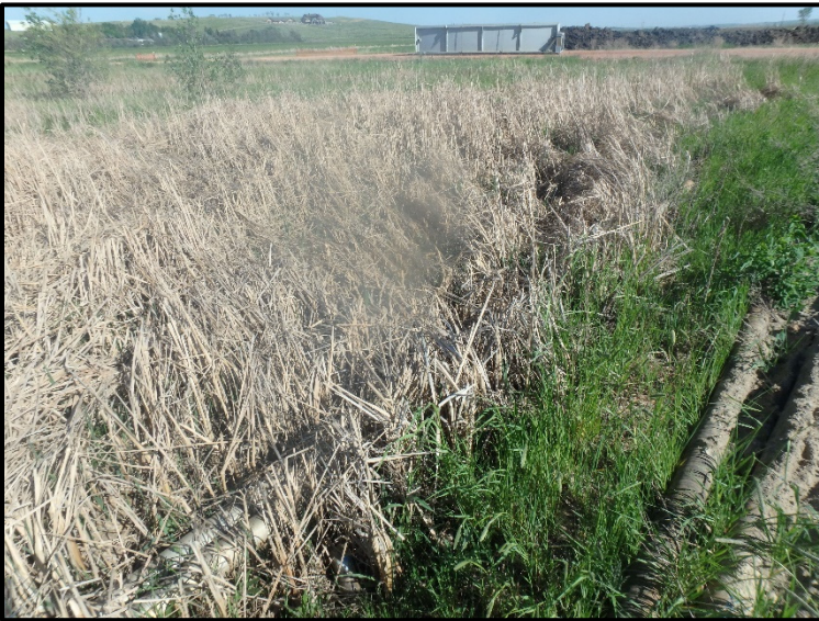
w-190091-001 facing east