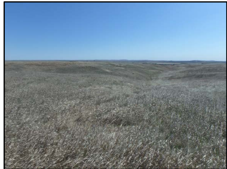
g-19009j-005 facing east