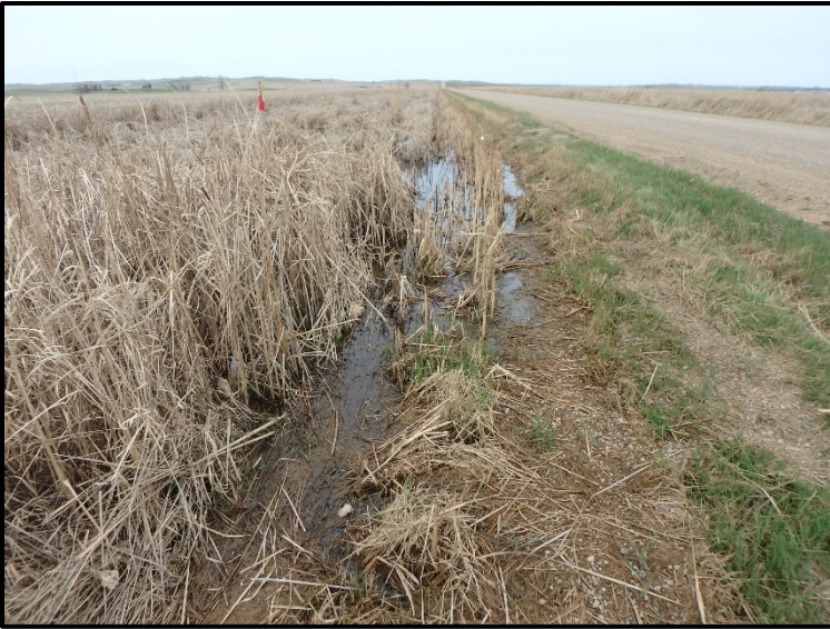
w-19009k-005 facing north