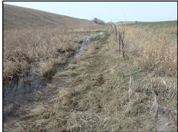
w-19009k-004 facing west