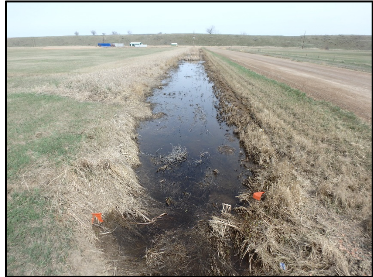
w-19009k-002 facing north