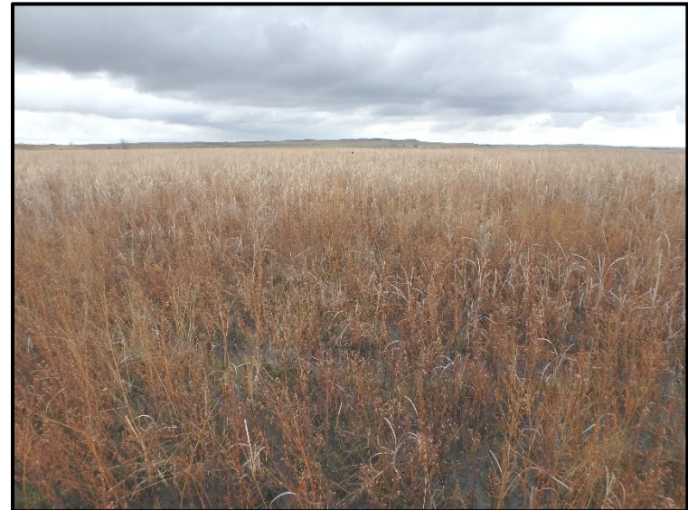
w-19009j-003 facing northwest