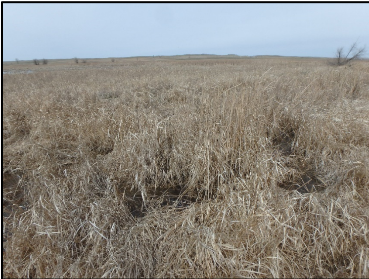
w-19009j-002 facing northwest