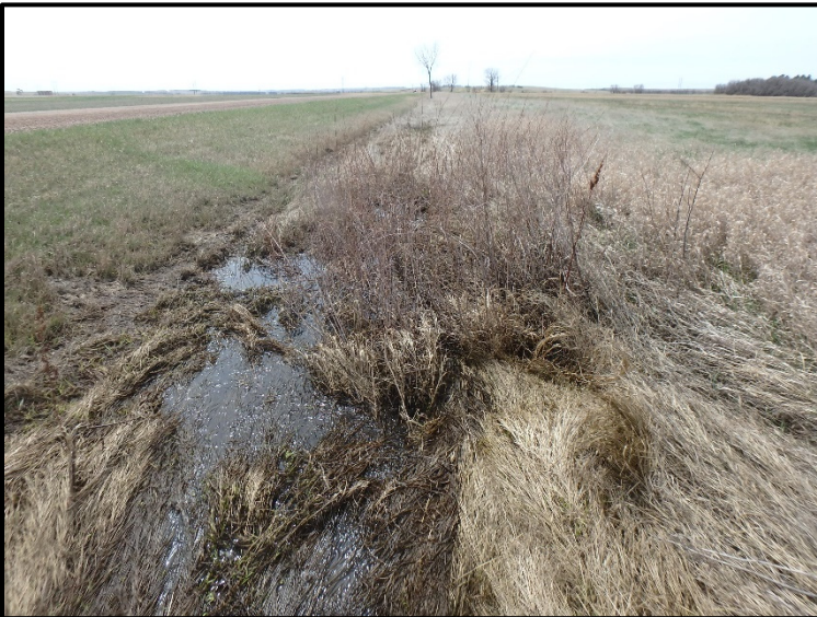
w-19009k- facing south