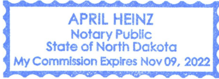
Notary Public Burleigh County, North Dakota

Subscribed and sworn before me this 12th day of February, 2019.