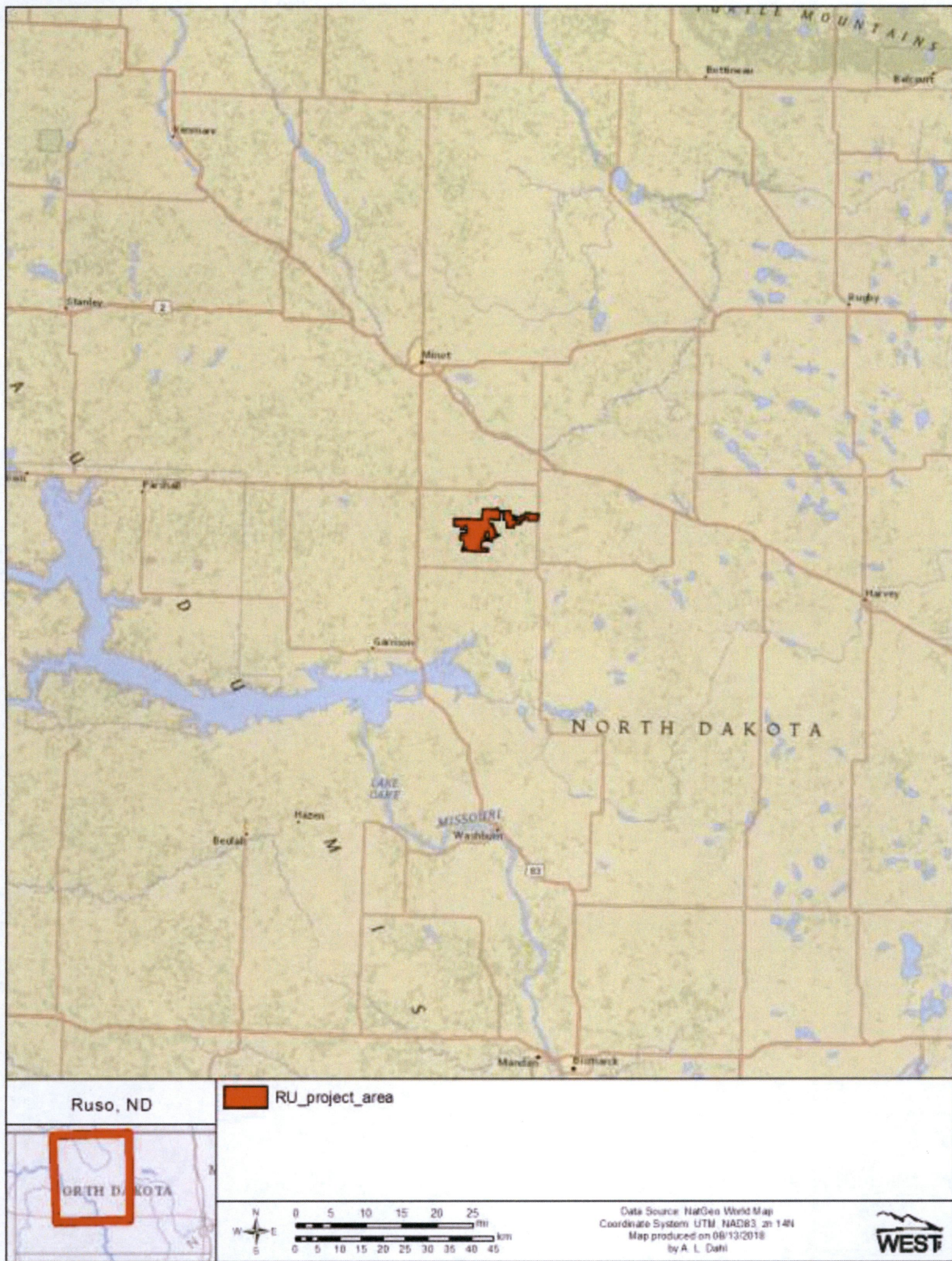
Figure 1. Location of the Ruso Wind Project in McHenry and Ward counties, North Dakota.