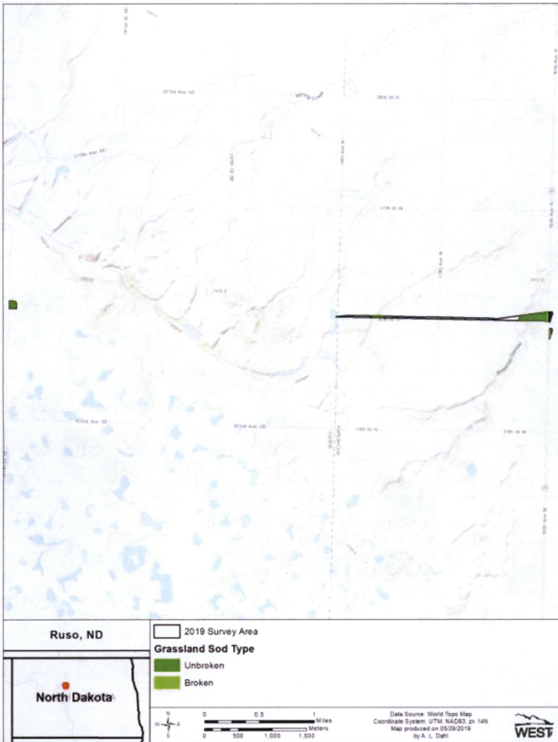
Figure 3. Grassland sod types assessed during field surveys completed May 28, 2019 for the 2019 grassland survey area at the Ruso Wind Project, McHenry and Ward counties, North Dakota.