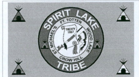
Flag of the Spirit Lake Tribe