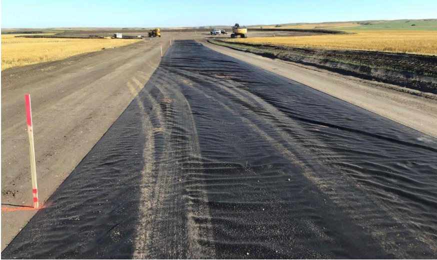
Access Road Building