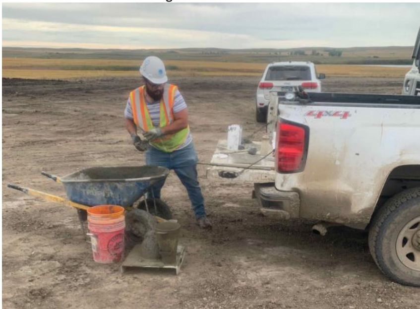
Foundation Concrete Testing