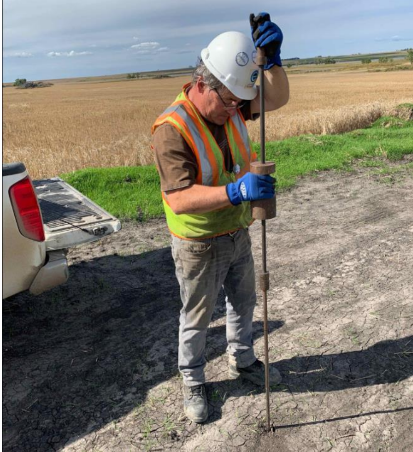
Road Subgrade Testing