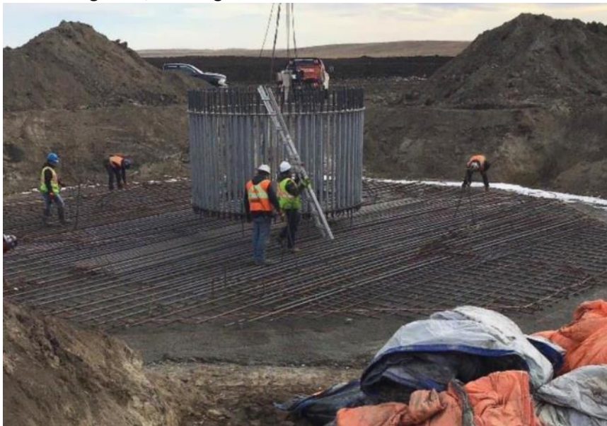
Reinforcing Steel/Bolt Cage Install