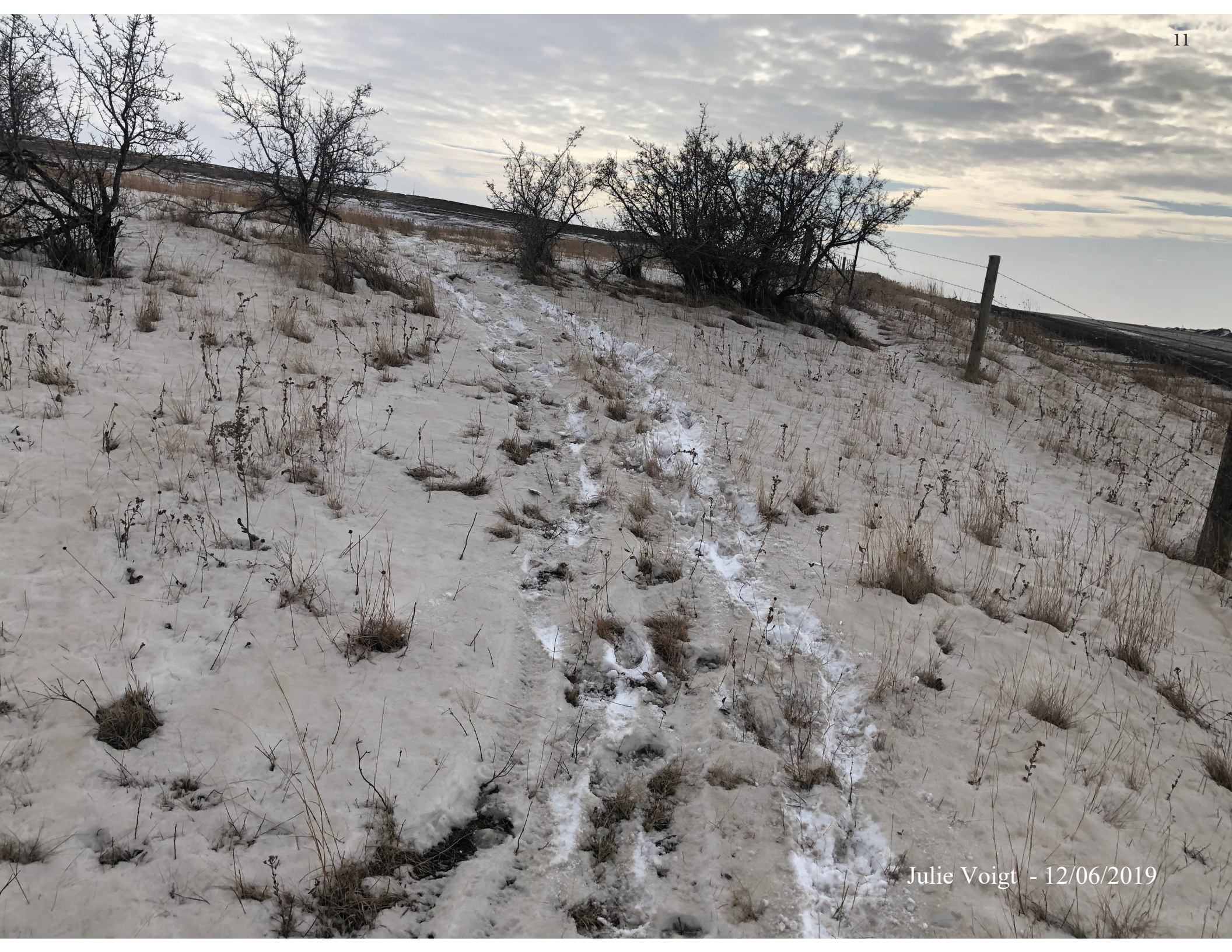
Julie Voigt - 12/06/2019