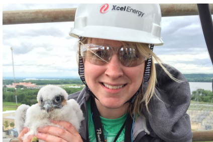
Xcel Energy employee holding a Peregrine Falcon chick.

Like all nuclear power plants, Monticello and Prairie Island produce carbon-free electricity. Nuclear power produces 62 percent of the United States' carbon-free electricity and nearly 20 percent of total electricity generated. Hydro, wind and solar produce 19, 15, and 2 percent of carbon-free electricity, respectively. Nuclear power plants avoided 564 million metric tons of carbon dioxide in 2015, while hydro, wind and solar avoided 327 million metric tons combined. Annually, the avoided emissions from nuclear power is similar to adding 128 million cars to the nation's roads. Nuclear power plants also avoided hundreds of thousands of tons of nitrogen oxide and sulfur dioxide. The Environmental Protection Agency estimates that the Clean Power Plan will reduce carbon emissions by 414 million tons annually by 2030, or 73 percent of current carbon avoidance of the nuclear industry.