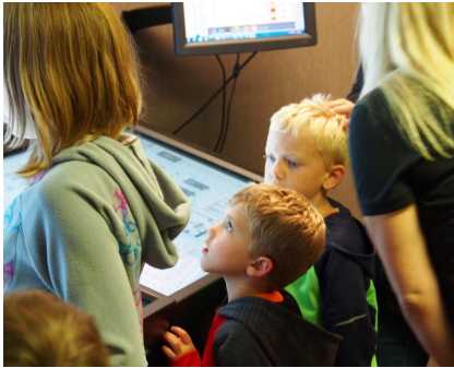
Children using Monticello mobile simulator at open house event.

In addition to the economic benefits that Xcel Energy's nuclear operations contribute to Minnesota in the form of jobs, income and taxes, the company and its employees contribute to local communities in many other beneficial ways. Xcel Energy strengthens Minnesota communities through hiring veterans, charitable contributions, educational programs that teach and promote the benefits of nuclear energy, environmental programs that improve the quality of the environment, and civic engagement activities that build trust and goodwill.