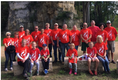
Prairie Island employees volunteering at Red Wing Memorial Park.

Below are further examples of contributions of Xcel Energy and its employees: