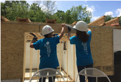
Xcel Energy employees volunteering for Habitat for Humanity.

Xcel energy generates 55 percent of its Upper Midwest electricity using carbon-free generation. Thirty percent of that generation is from its two nuclear plants in Minnesota, 15 percent is from wind energy, and 10 percent is from a combination of hydro/biomass/solar sources. Beyond its nuclear program, Xcel Energy has been the number one utility provider of wind energy for 12 straight years.