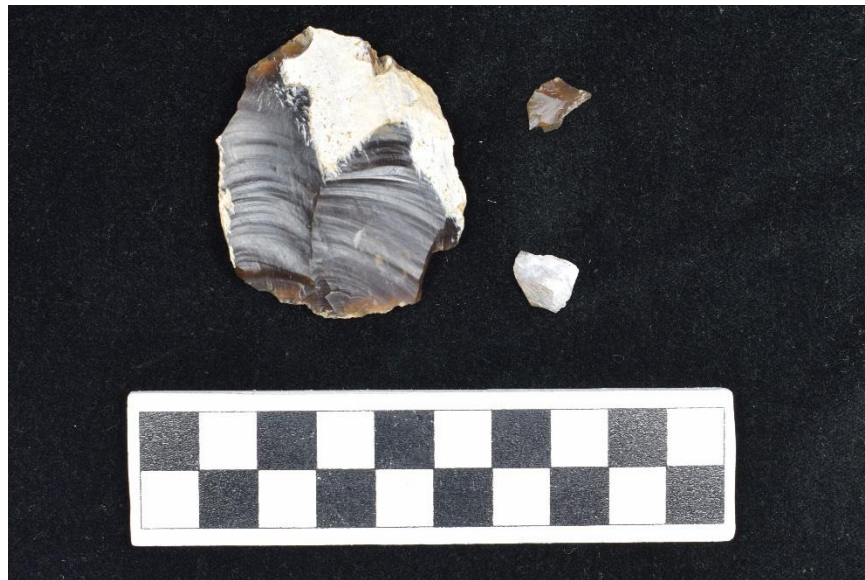
Photograph 4: Artifacts from XU3, Level 2. Bifacial core and lithic debitage.

Two excavation units (XU1 and XU3) were positive for cultural material. XU1 contained three flakes within the plow zone, within a depth between 0 and 10 cmbs. XU3 contained seven artifacts; six of which were recovered from the plow zone (between 0 and 30 cmbs) and one flake was recovered between 50 and 60 cmbs. Of the six recovered from the plow zone, four were flakes and two were bifacial cores (see Photographs 4 and 5). No artifacts were recovered from XU2.