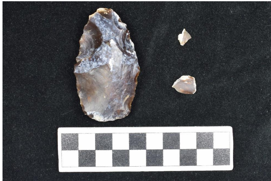
Photograph 2: Artifacts from Auger Probe A2. Biface and lithic debitage.

too compact or impenetrable rocks were encountered, attempts to complete the probe were performed manually with a shovel. Auger probes generally extended to depths between 40 and 50 centimeters below ground surface (cmbs) with a maximum depth of 72 cmbs. Seven auger probes were positive for cultural material (n = 5.6 percent). These positive auger probes expanded the site boundary by 2.06 acres. Artifacts recovered include one biface (Photograph 2), one bifacial core (Photograph 3), and 12 pieces of lithic debitage (Photograph 3).