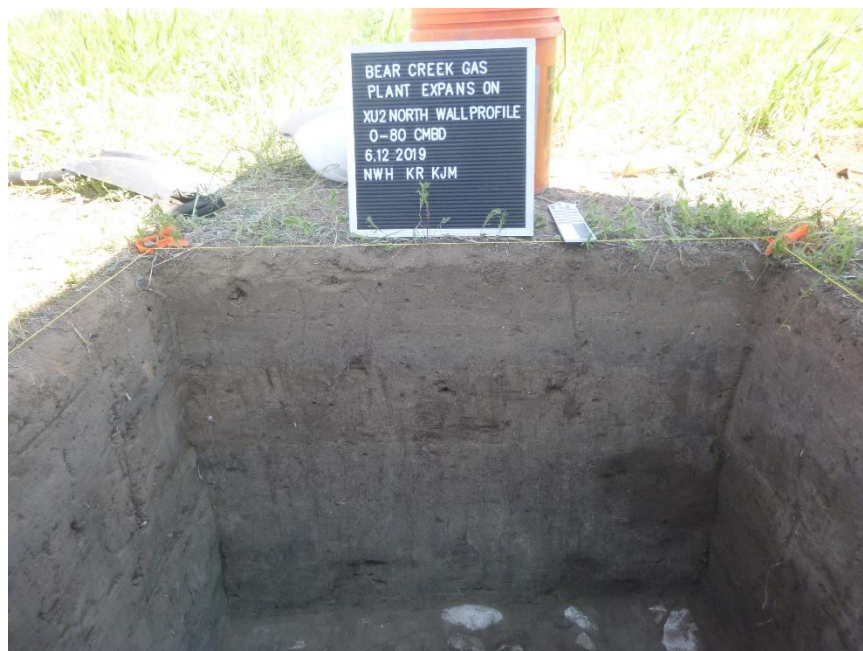
Photograph 7: South wall profile of XU2. Note the natural KRF nodules within the C Horizon.