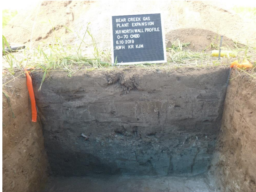
Photograph 6: North wall profile of XU1. Note the ice wedge in bottom left corner.

XU1 and XU2 were placed 18 meters apart on the level terrace. Soil profiles for these excavation units were similar and consisted of a 20 to 30-centimeter-thick sandy loam plow zone underlain by a sandy loam B horizon which transitioned to a sandy clay loam C horizon between 45 and 50 cmbs (Photographs 6 and 7). The C horizon in XU1 contained an ice wedge geological feature defined in the field by Merjent soil specialist Nick Haus. The C horizon in XU2 contained a natural concentration of unmodified nodules of Knife River Flint.