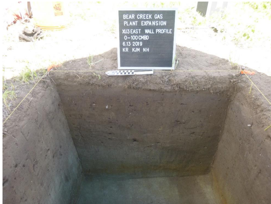
Photograph 8: East wall profile of XU3.

XU3 was placed on a gentle slope on the edge of a narrow drainage. The soil profile for this excavation unit consisted of a 20 to 30-centimeter-thick fine sandy loam plow zone underlain by a fine sandy loam B horizon which transitioned into a fine sand C horizon at approximately 60 cmbs (Photograph 8).