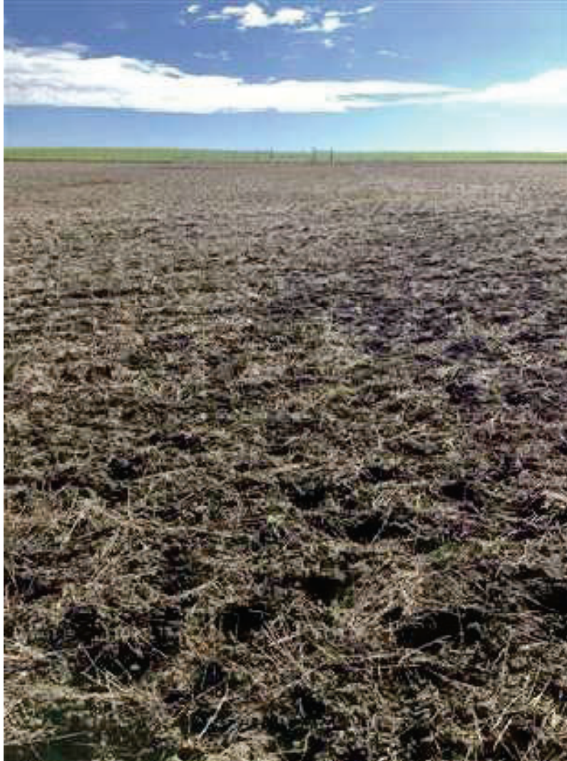
P23, looking NE, lots of dead vegetation, though this area is used for ranching, lots of hoofprints evident. Vegetation likely killed by landowner's herd.