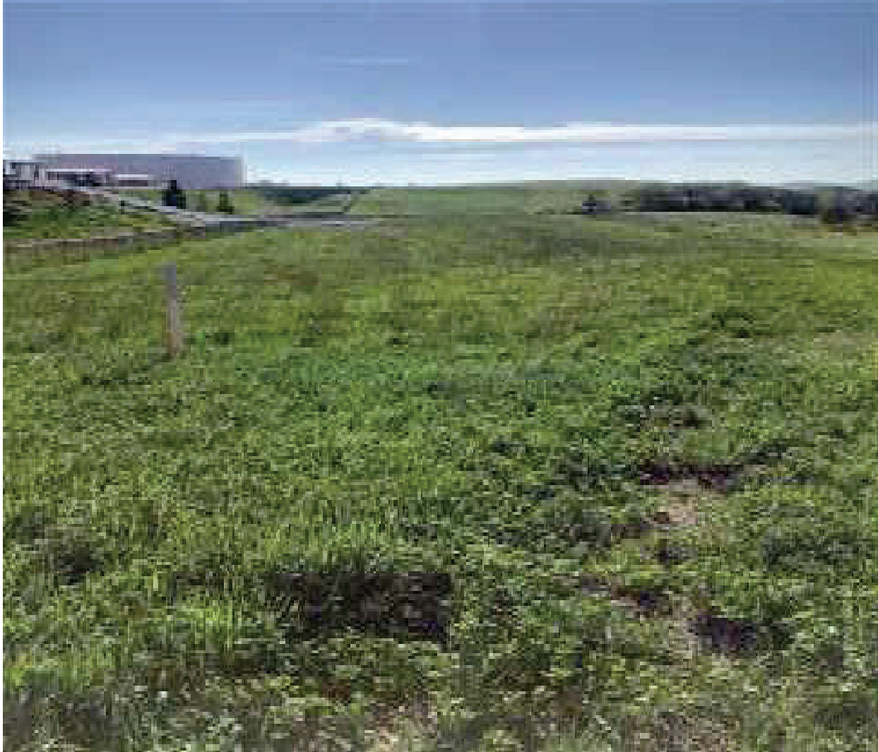
P1 Looking East. Beginning of pipeline, abundant vegetative growth.