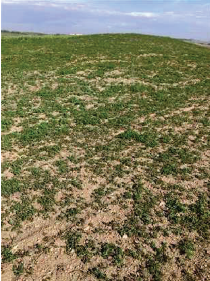
P10, looking West. Vegetation growth evident.