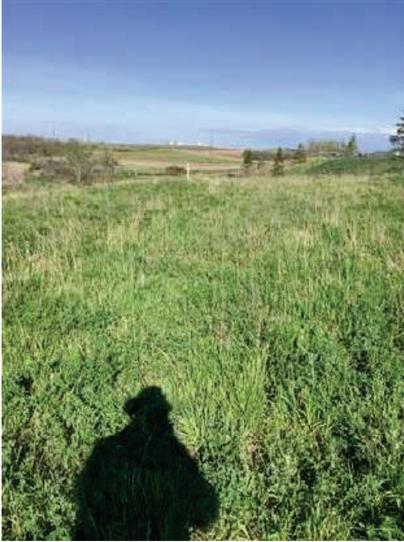
P2 Looking West, abundant vegetative growth.