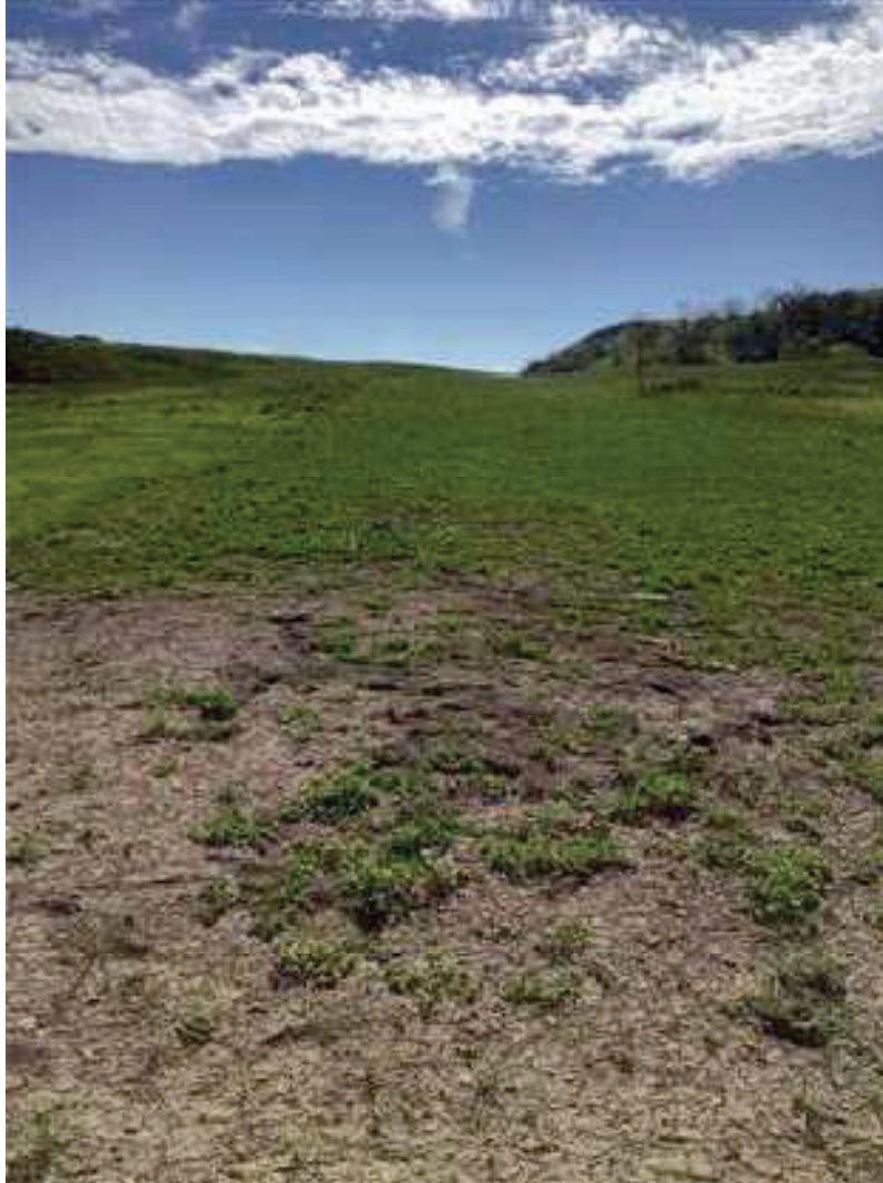
P17 looking East, more of the bare soil shown in P16, but beyond that spot, adequate vegetative cover has been established.