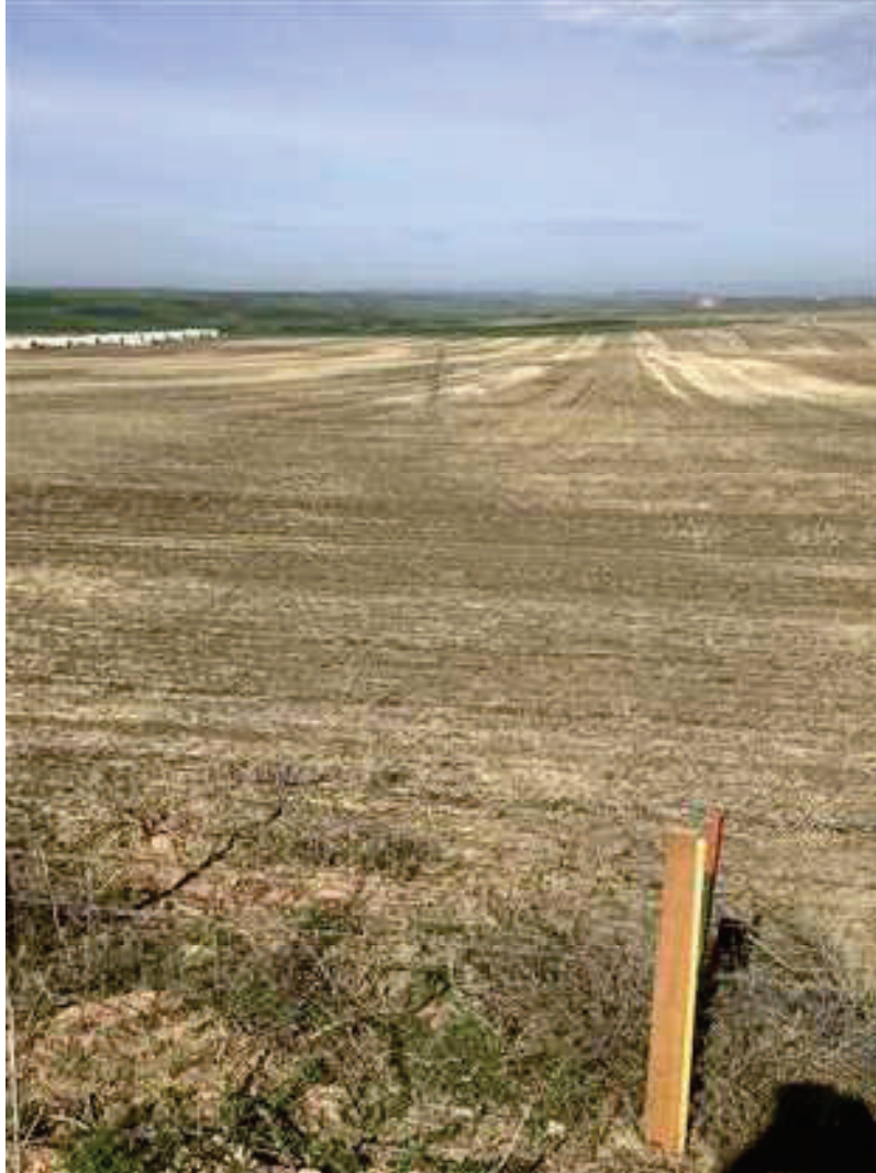
P28 looking SW, pipeline path visible, no issues with crop land apparent.