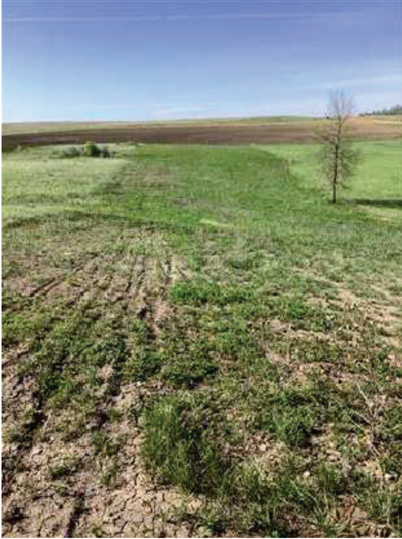
P12 looking south, ROW revegetation evident.