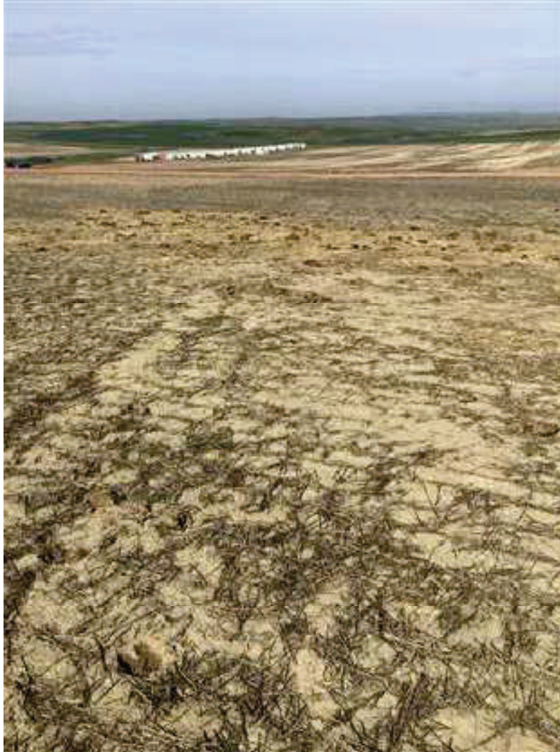
P27 looking SW, lots of bare soil and dead vegetation. Farmer hasn't worked this area yet.