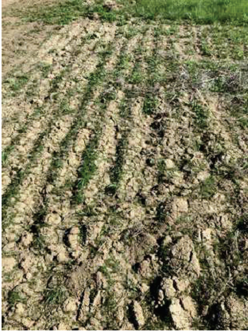
P18 looking North-seeding evident, though soil is cracking.