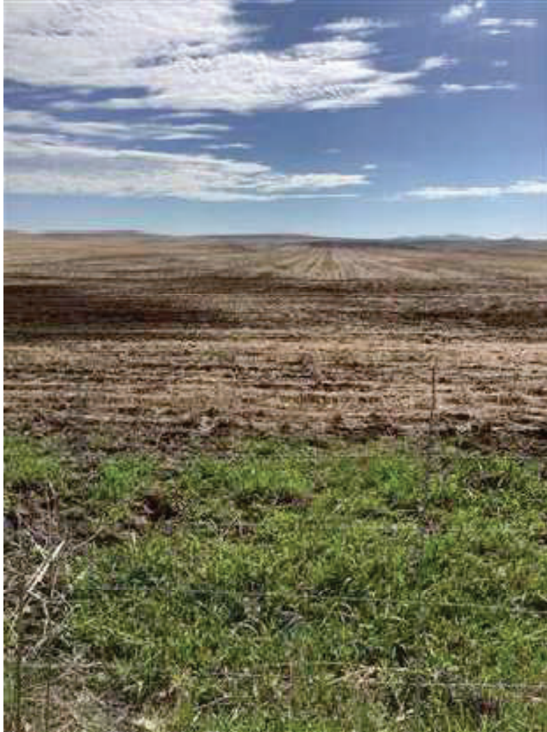
P29 looking East, crop land seems to have been worked, no issues. ROW outside field boundary has adequate vegetative cover.