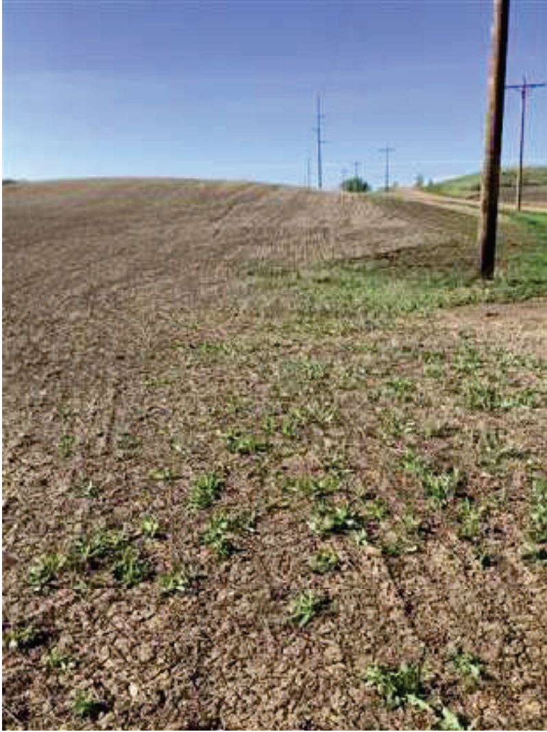
P4 looking South. Some weeds growing, however landowner seems to be working land again.