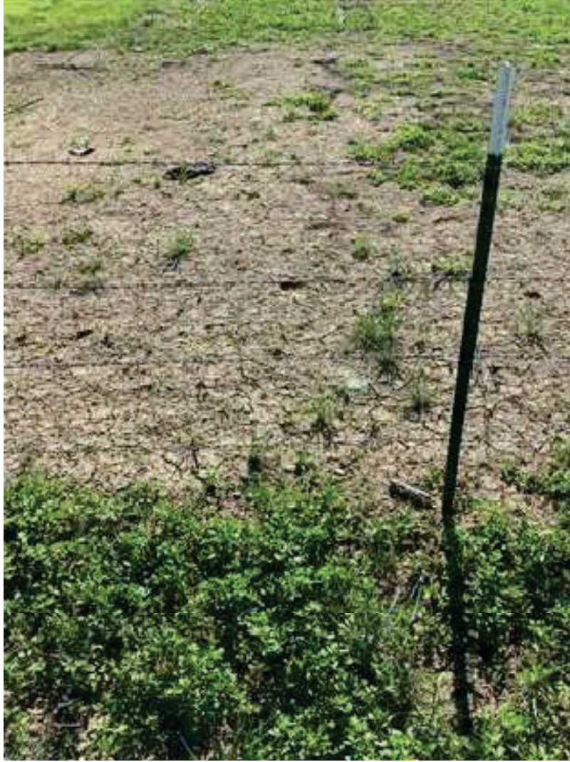
P16 looking East, localized spot of bare soil. Will need reseeding.