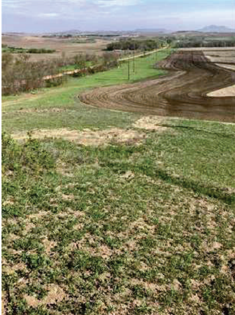
P9, looking NNW, cropland reclamation and vegetation growing.