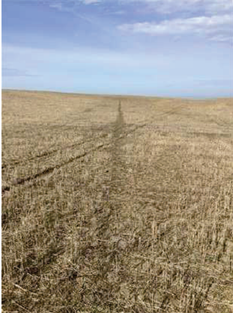
P26, looking SW, pipeline path clearly visible, stalks from previous year's harvest evident, crop land reclaimed.