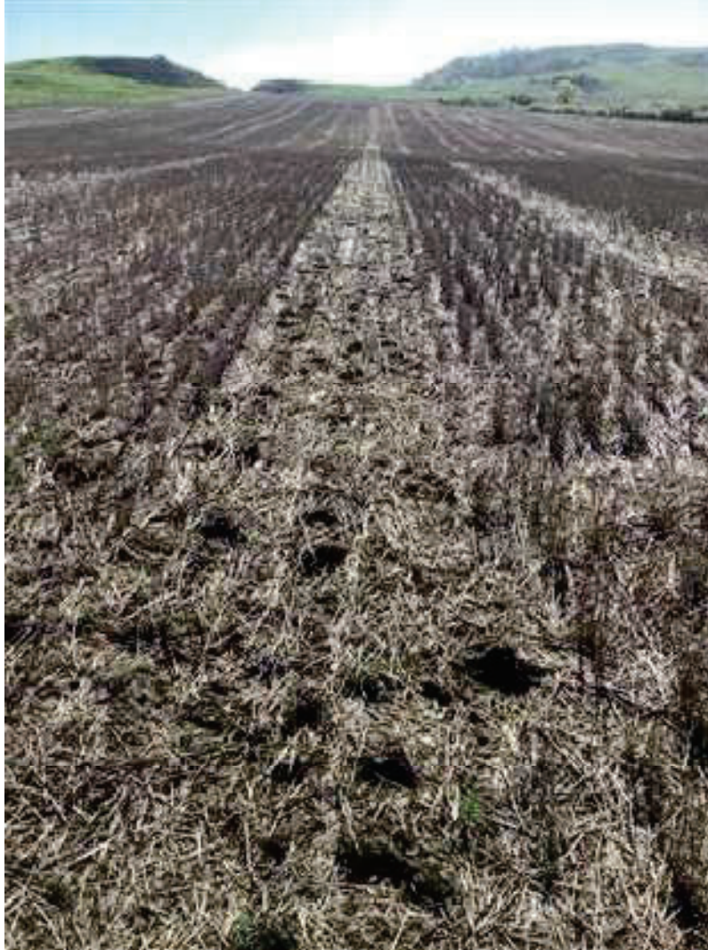
P20 looking East, can see where pipeline was installed. Field is still full of stalks from last year's harvest.