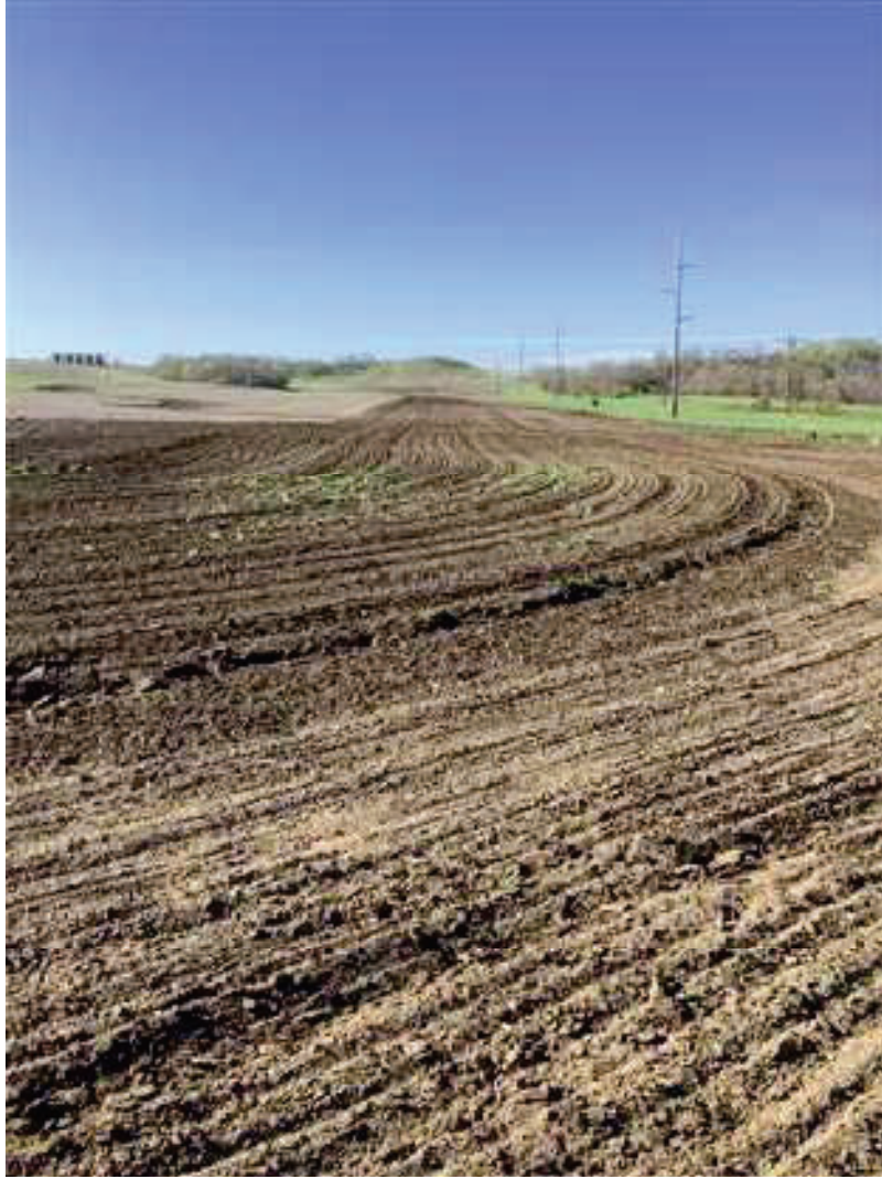
P8 looking South, substantial evidence of farmland being utilized again by landowner.