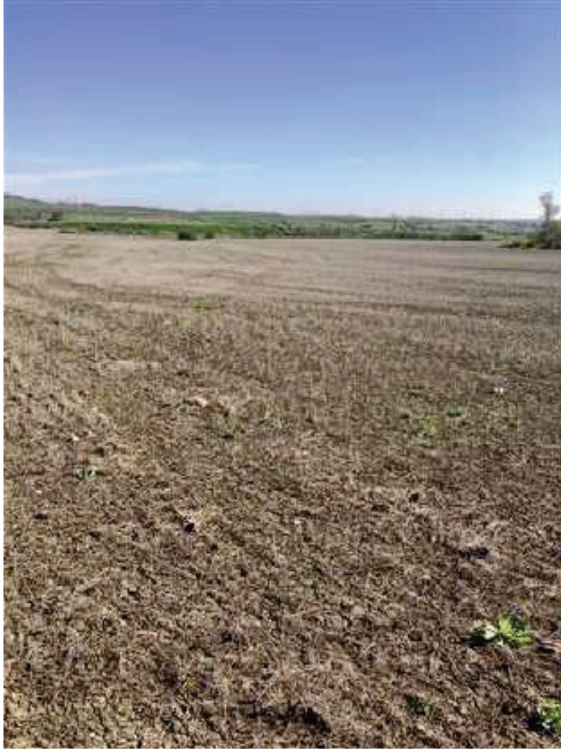
P5 looking NE-Evidence of cultivation by landowner.