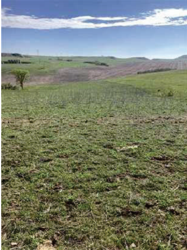
P22 looking NE, ROW has substantive vegetative growth.