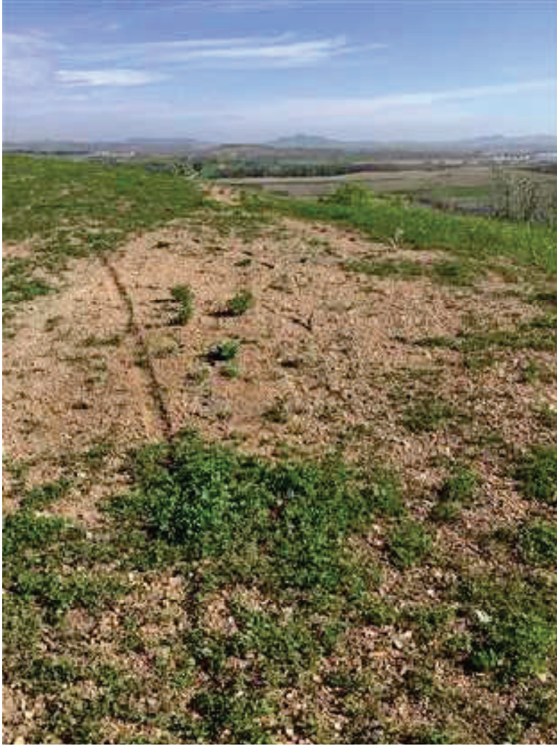
P11 looking North, bare spot with minimal plant cover. Will need reseeding.