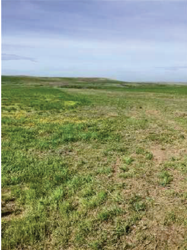
P31 looking SW, ROW continues on with adequate vegetative cover, after this is beyond scope of this project.