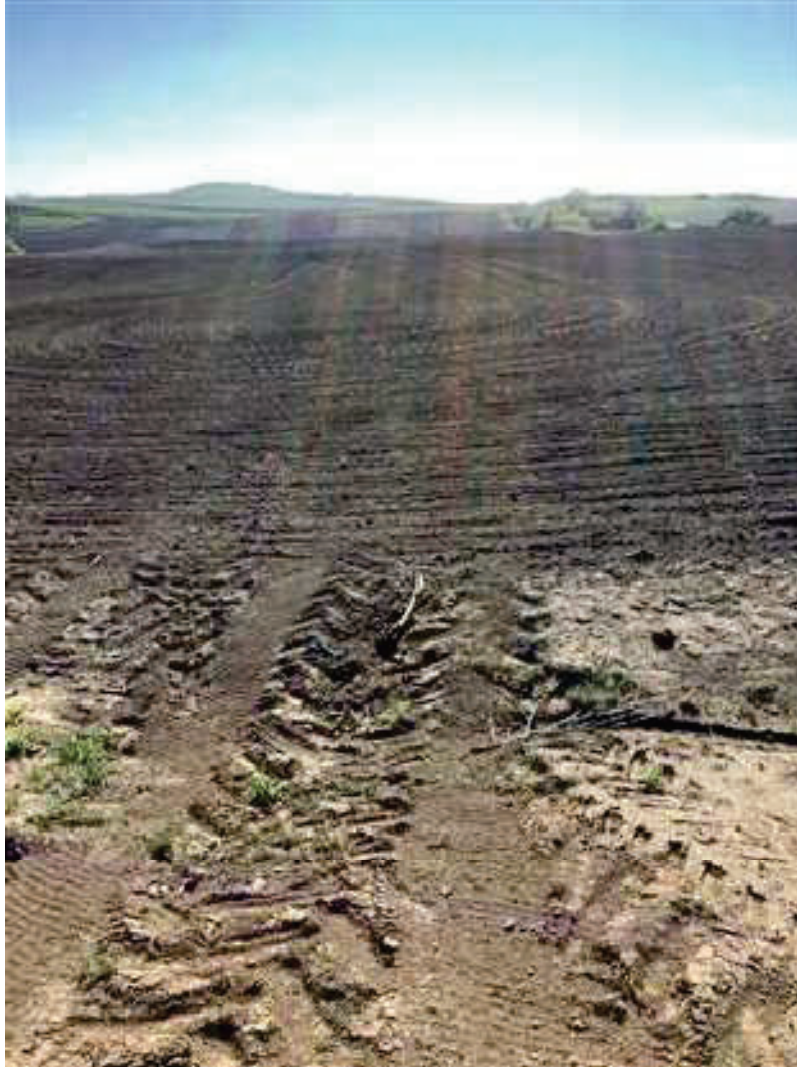
P 15 looking East, another farm field that has been worked, with farm equipment tracks visible.