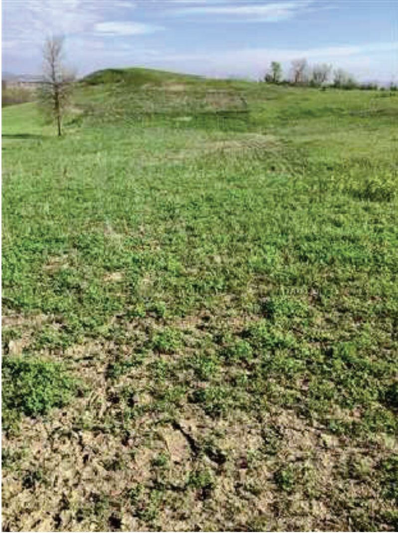
P13 looking North, substantive vegetative cover.