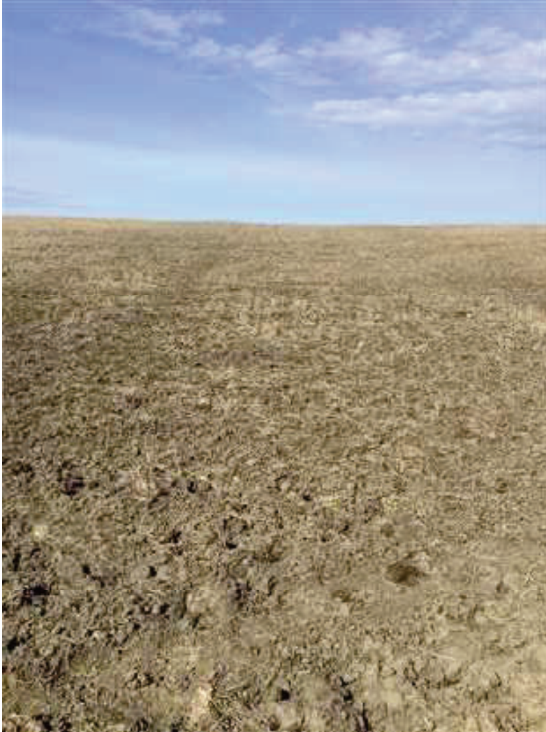
P24 looking WSW, More vegetation dead and trampled with hoof marks in the soil. The herd of black angus cows was maybe 100 feet south of inspector in this picture.