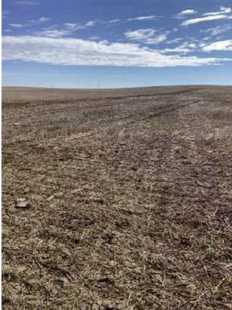
P25 looking NE, lots of dead vegetative material, all stalks from previous year's harvest.