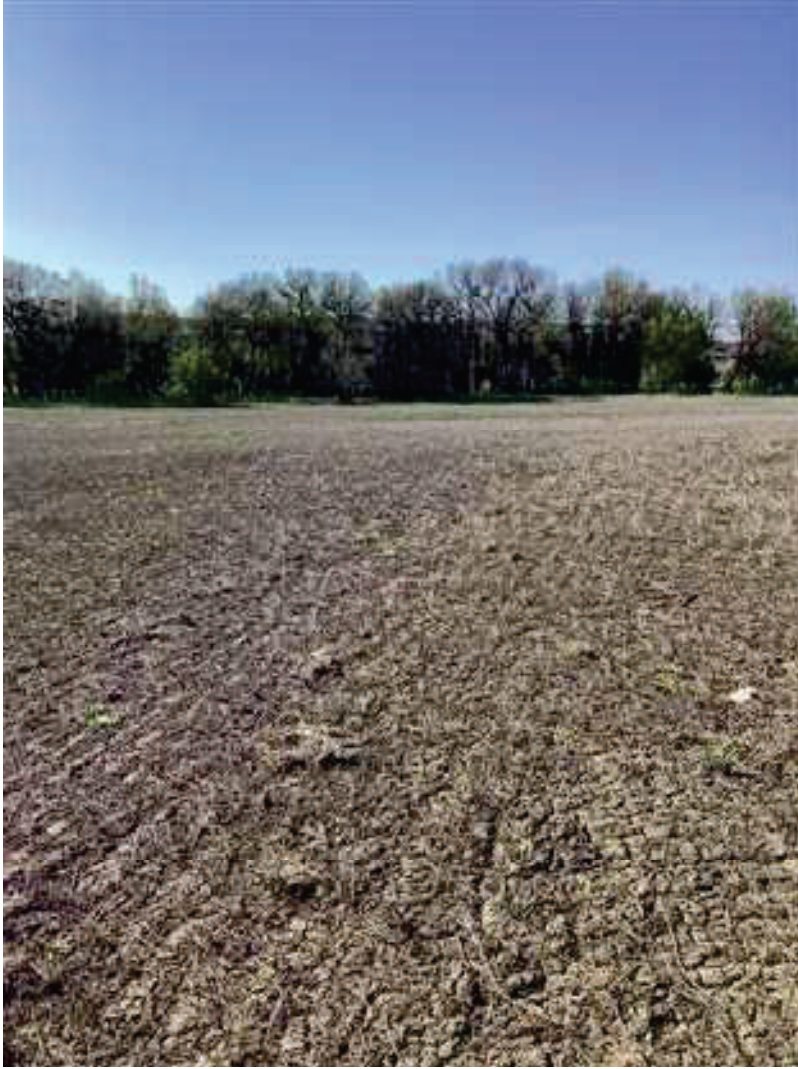
P6 looking SSE, landowner has reclaimed crop land, tree line undisturbed by construction activities.