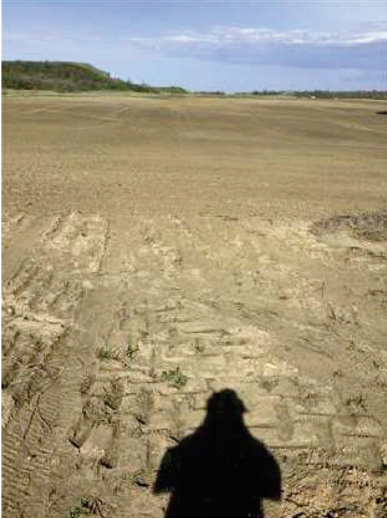
P14 looking West, tracks from farm equipment lead into a field, and field looks like it has been worked.