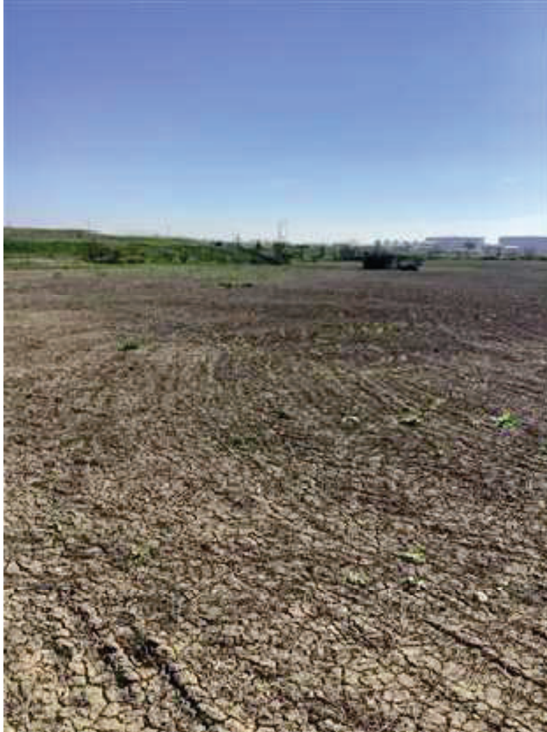
P3 looking NE. Soil cracking visible, however, landowner seems to be working the land.