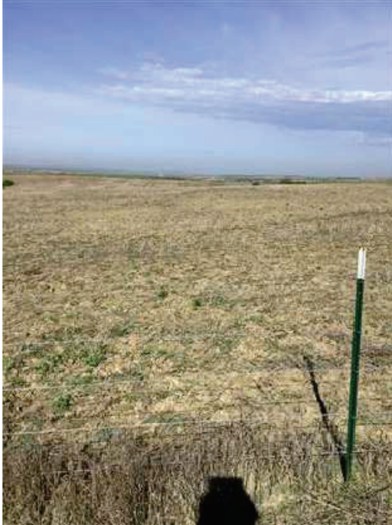
P19 looking West, farmlands have been worked recently, with stalks remaining from last year's harvest.