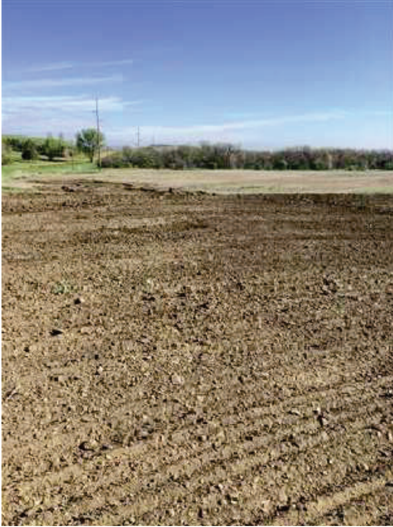
P7 looking North. Owner working crop land of ROW, some torn up material from a different company doing electrical work.