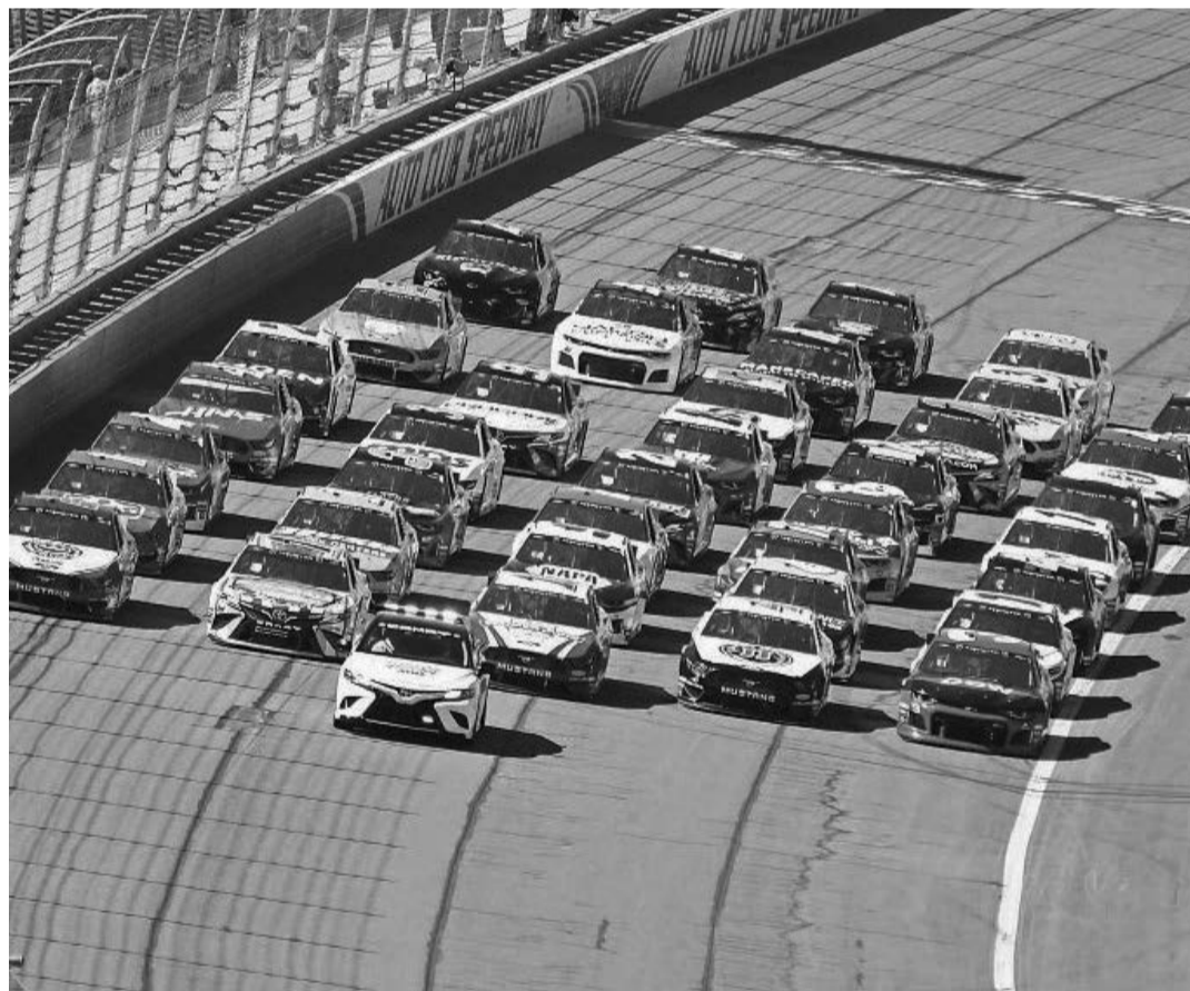
It's time to start engines on the NASCAR season. Ready or not, here they come!

Of the 16 drivers who qualify, let's get the easy ones out of the way: Elliott, Harvick, Kyle Busch, Denny Hamlin, Martin Truex